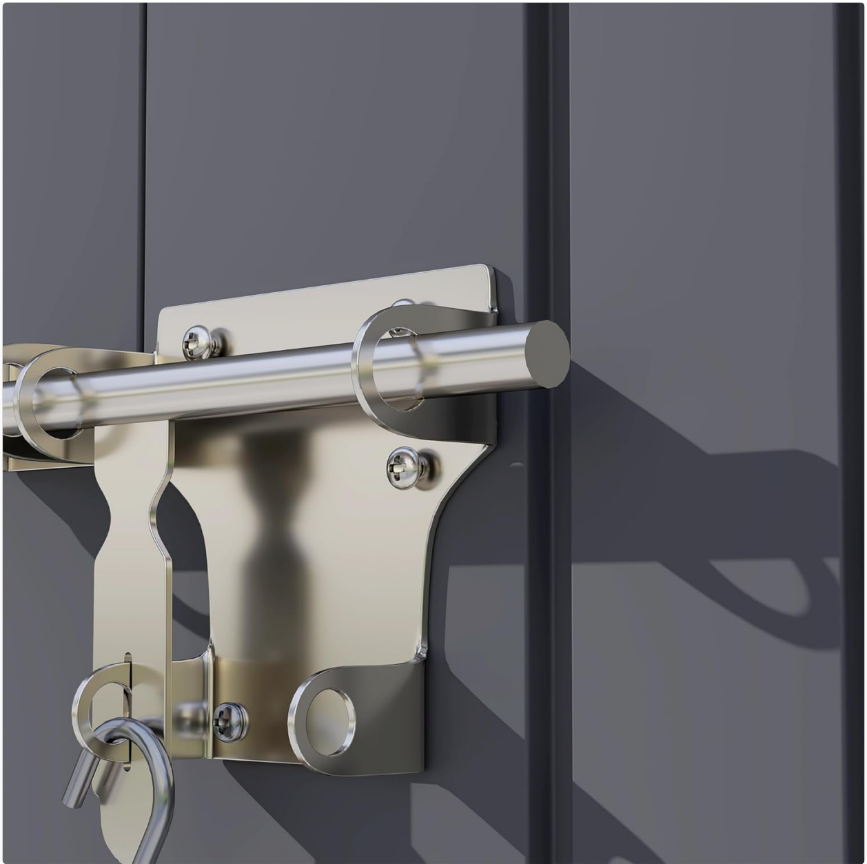
Image 4.2: A detailed view of the shed's door lock, highlighting its robust construction and the mechanism for securing the door.