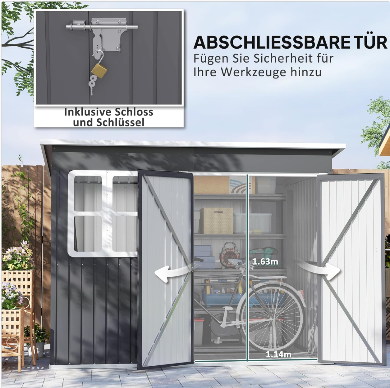
Image 4.1: A close-up view of the lockable door mechanism, showing the included padlock and key for enhanced security of your stored items.