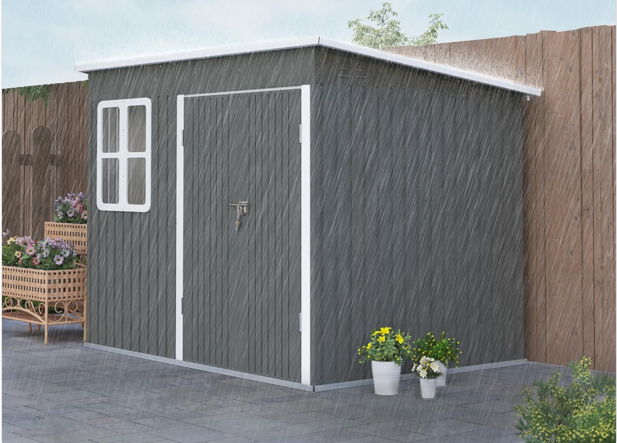
Image 5.1: This image highlights the benefits of the galvanized steel construction, including protection from rain and snow, rust protection, and no maintenance requirements.