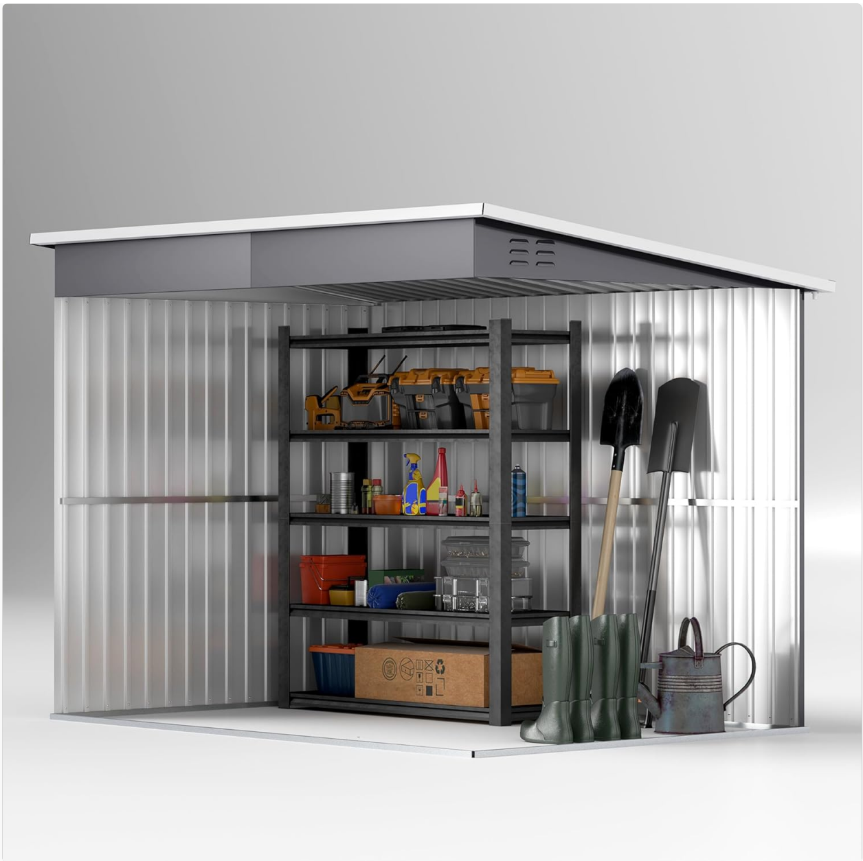
Image 4.4: An interior view of the shed, demonstrating the potential for organizing tools and equipment with shelving units.