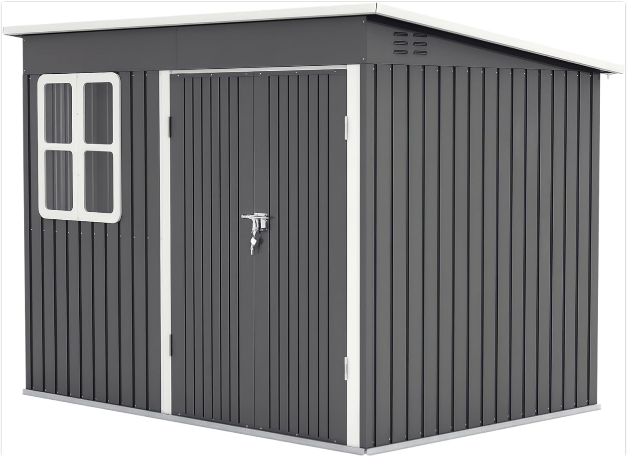
Image 1.1: The Outsunny Metal Garden Shed, showcasing its dark grey finish, window, and single door.