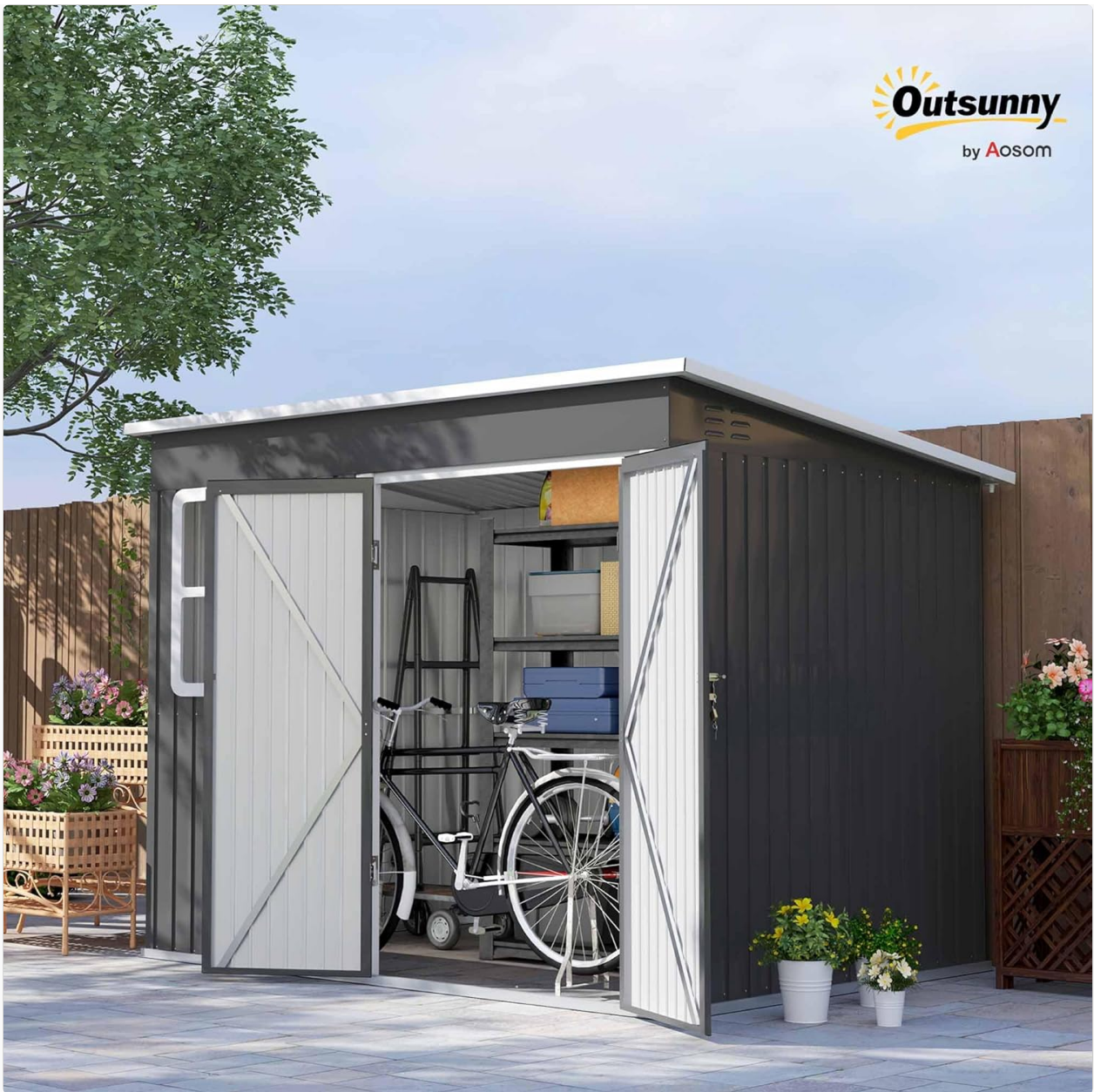
Image 1.2: The shed with its wide double doors open, demonstrating ample space for storing items like a bicycle and shelving units.