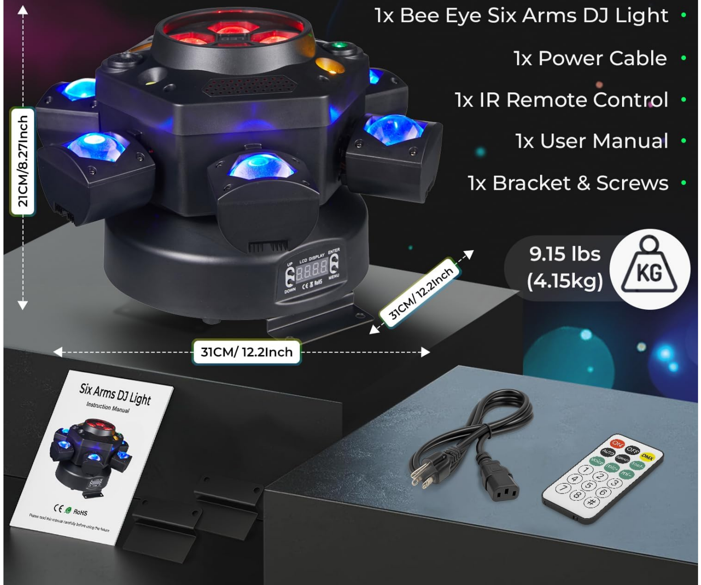
Image: Contents of the product packaging, showing the main light unit, power cable, remote, manual, and mounting hardware.