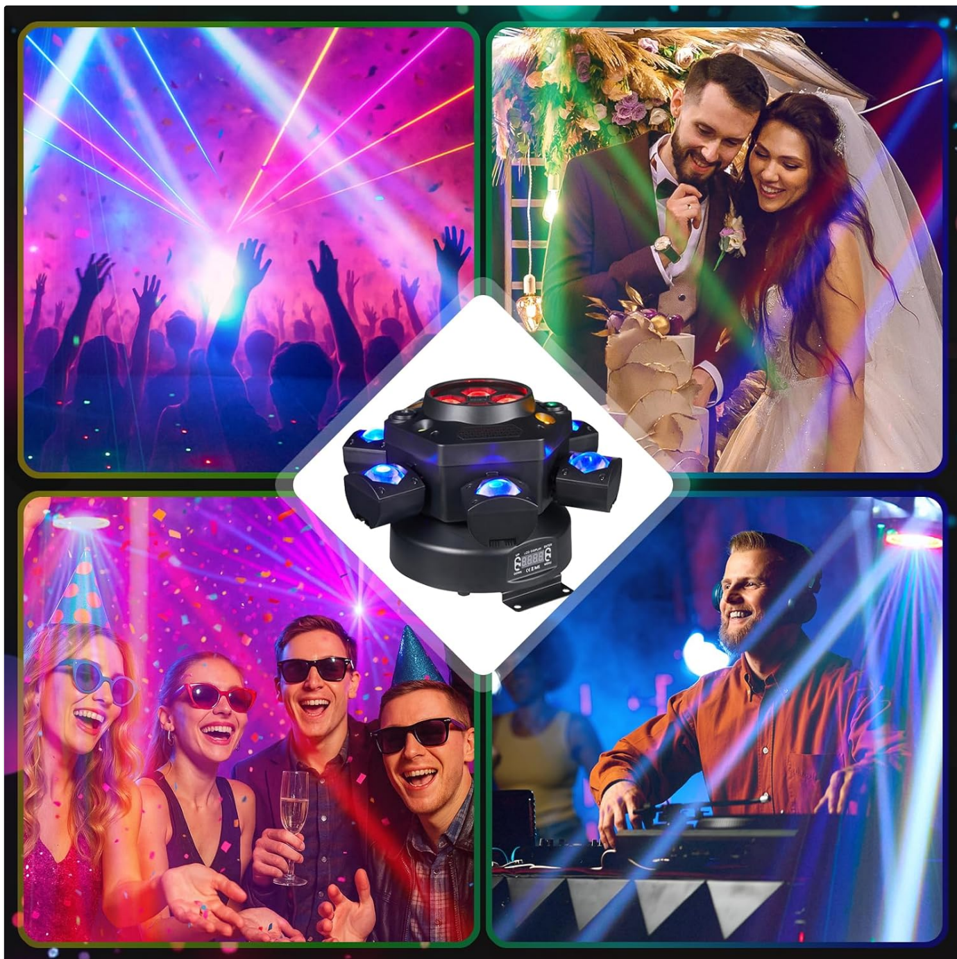
Image: Overview of the light's features, including DMX control, various effects, and movement capabilities.