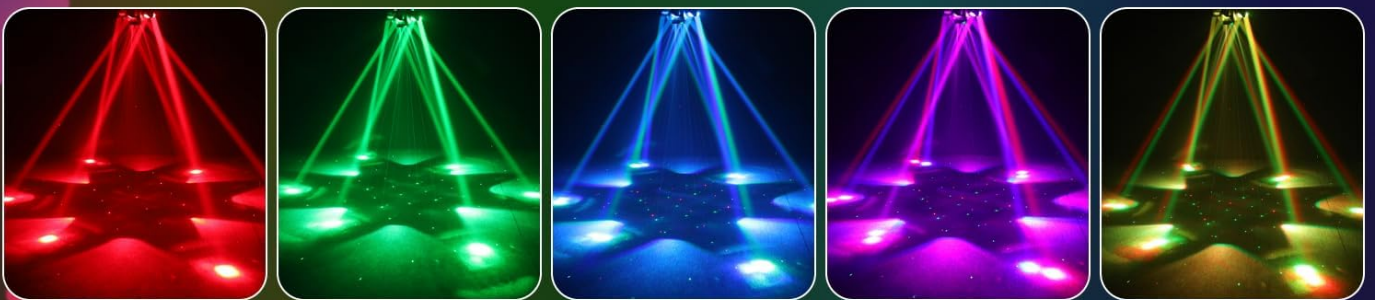
Image: Examples of the diverse lighting effects, such as 6-arm moving RGBW beams, white and amber strobes, and bee-eye effects.