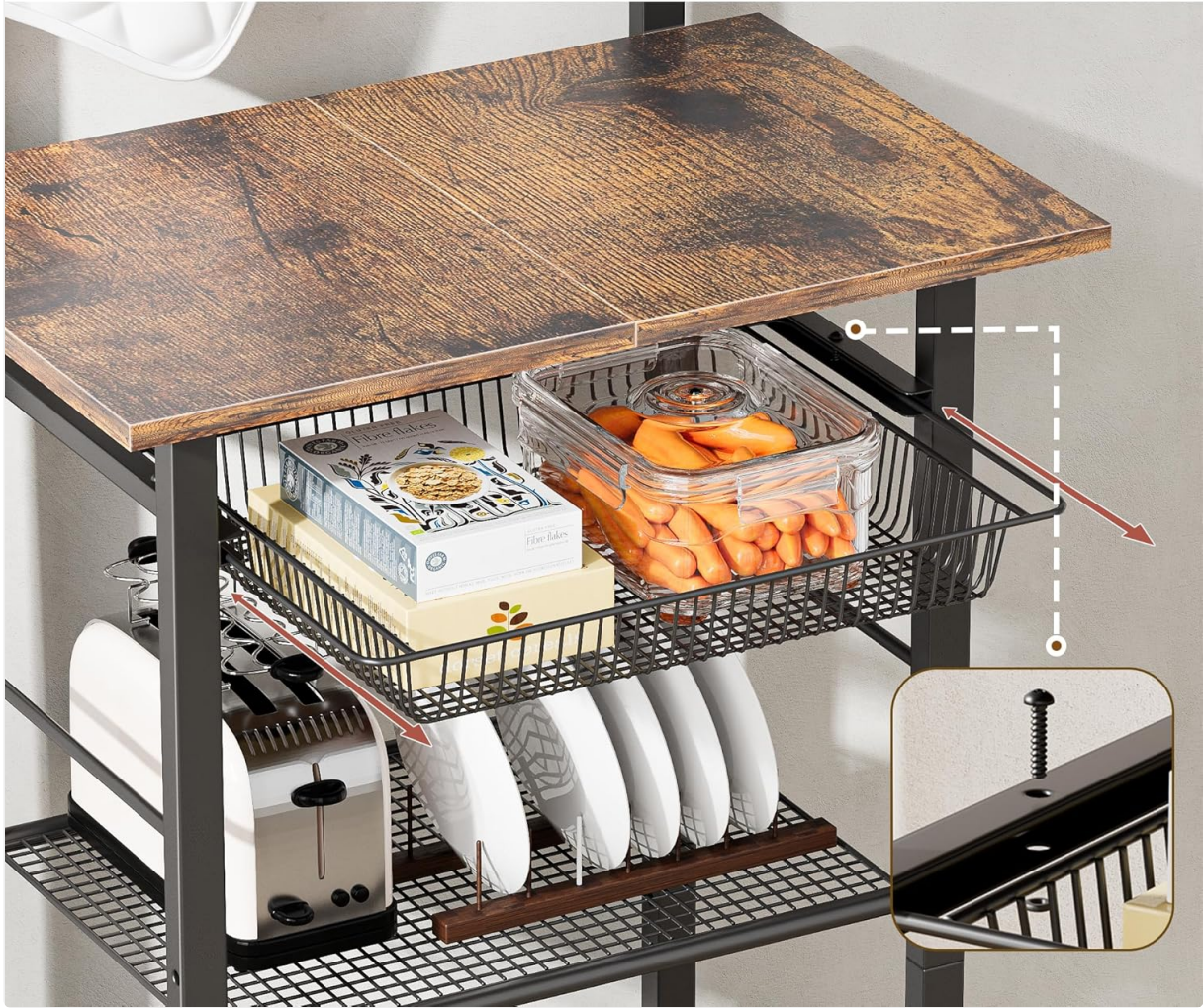
Figure 4: Detail of the pull-out mesh basket, featuring a stopper to ensure secure access to stored items without the basket detaching.

Allows easy access to items and won't fall out