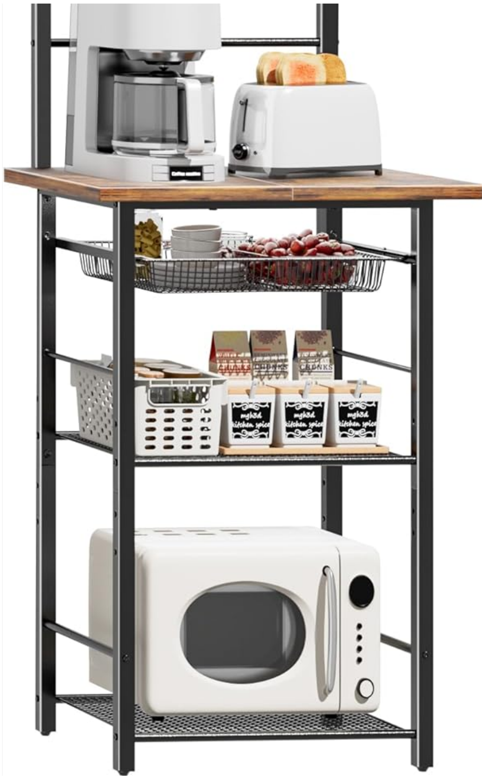
Figure 1: Fully assembled LAKEMID 6-Tier Microwave Stand / Bakers Rack, showcasing its storage capabilities for various kitchen items including a microwave, coffee maker, and spices.