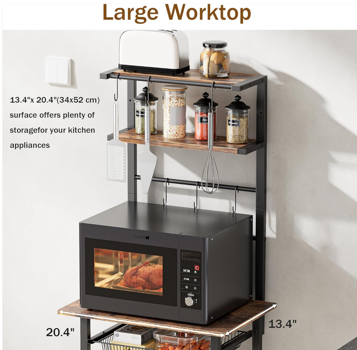
Figure 3: The spacious main worktop, measuring approximately 13.4"D x 20.4"W, designed to accommodate kitchen appliances like microwaves or toasters.

Place the large wooden worktop onto the middle section of the frame. Secure it with screws from underneath. This forms the primary surface for your microwave or coffee bar.