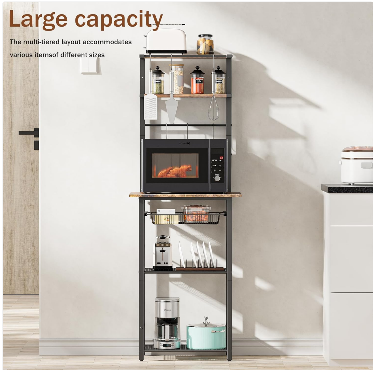
Figure 5: The rack integrated into a kitchen, illustrating its multi-tiered layout and large capacity for various kitchen items, from appliances to pantry staples.