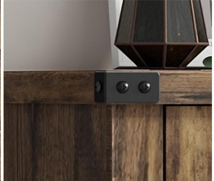
Stylish & Sturdy Iron Corner