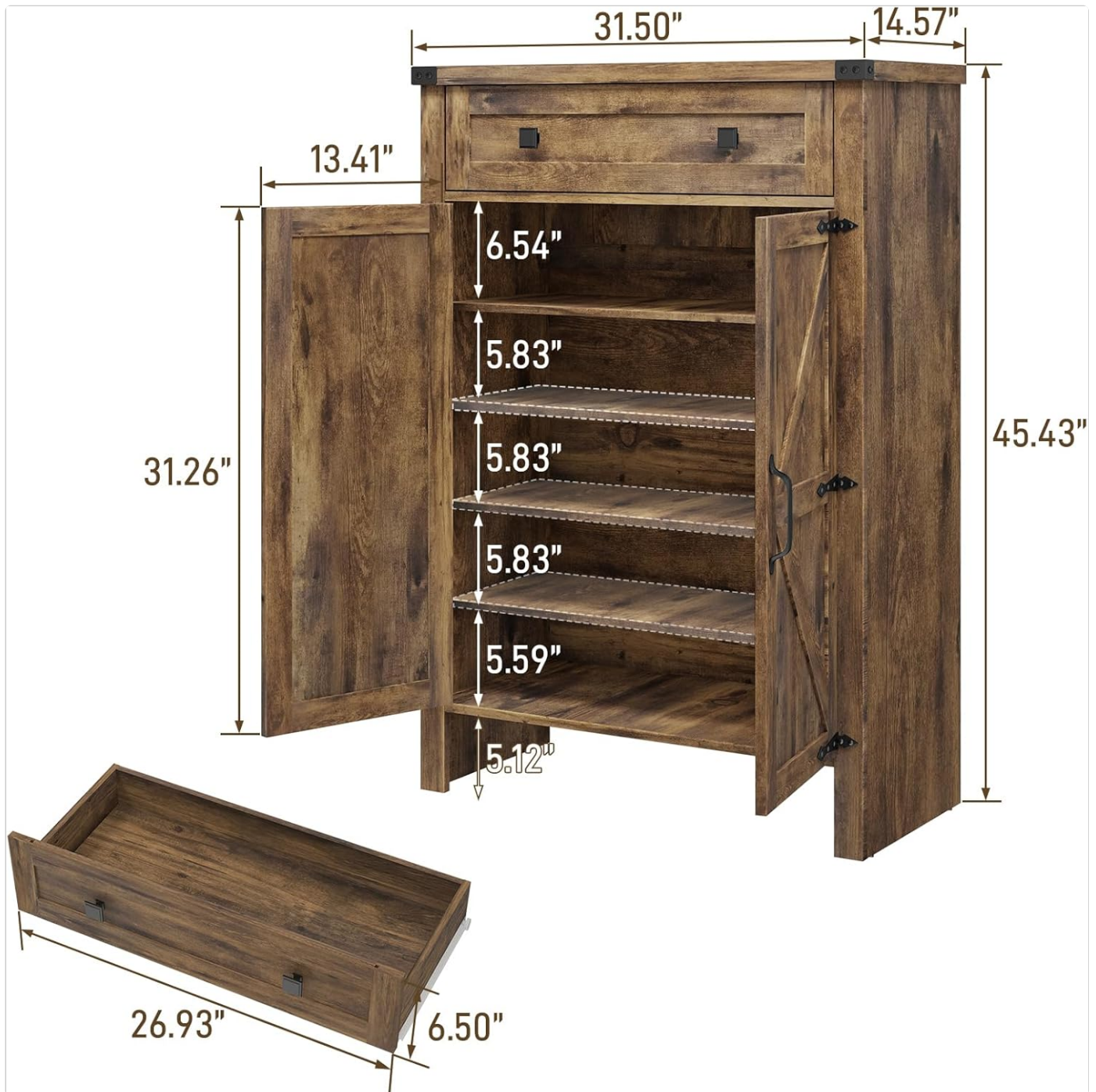
Image: A technical drawing of the shoe cabinet with all key dimensions labeled in inches, including the overall height (45.43"), width (31.50"), depth (14.57"), and internal shelf heights, as well as drawer dimensions.