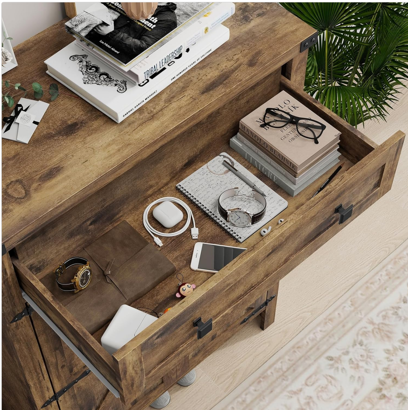
Image: A close-up, overhead view of the open top drawer of the shoe cabinet. The drawer contains various small items such as eyeglasses, a notebook, a pen, a watch, wireless earbuds, and a wallet, demonstrating its utility for storing everyday essentials.

the right demonstrates the adjustable shelf feature, with one shelf removed to create a taller compartment suitable for storing high boots upright.