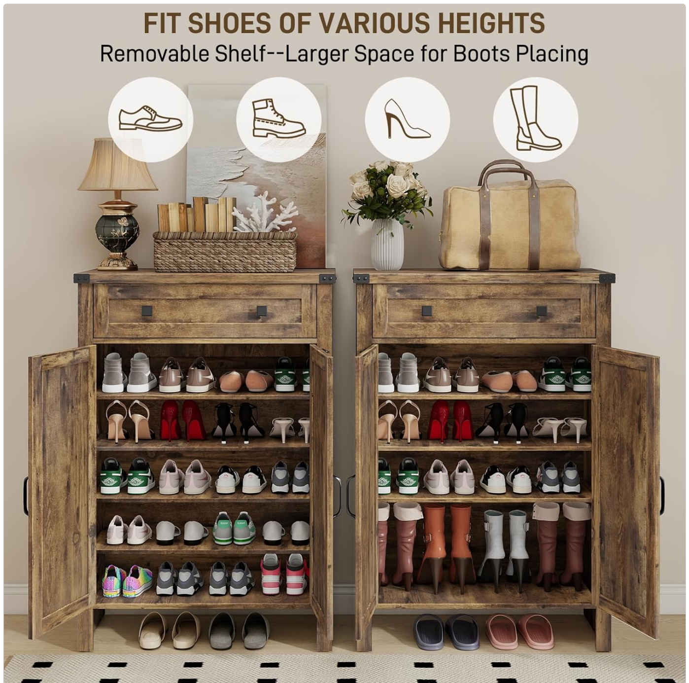
Image: Two identical shoe cabinets are shown. The cabinet on the left has all shelves in place, storing various low-profile shoes. The cabinet on