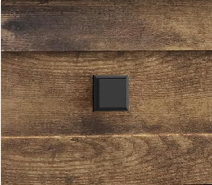
Elegant Metal Handles