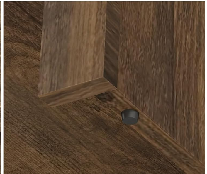
Stable Legs with Anti-slip & Scratch-resistant Pads

Image: A collage of four close-up images detailing the cabinet's design elements: elegant black metal handles, stylish and sturdy iron corner protectors, the distinctive X-shaped barn door pattern on the cabinet doors, and the stable legs equipped with anti-slip and scratch-resistant pads.