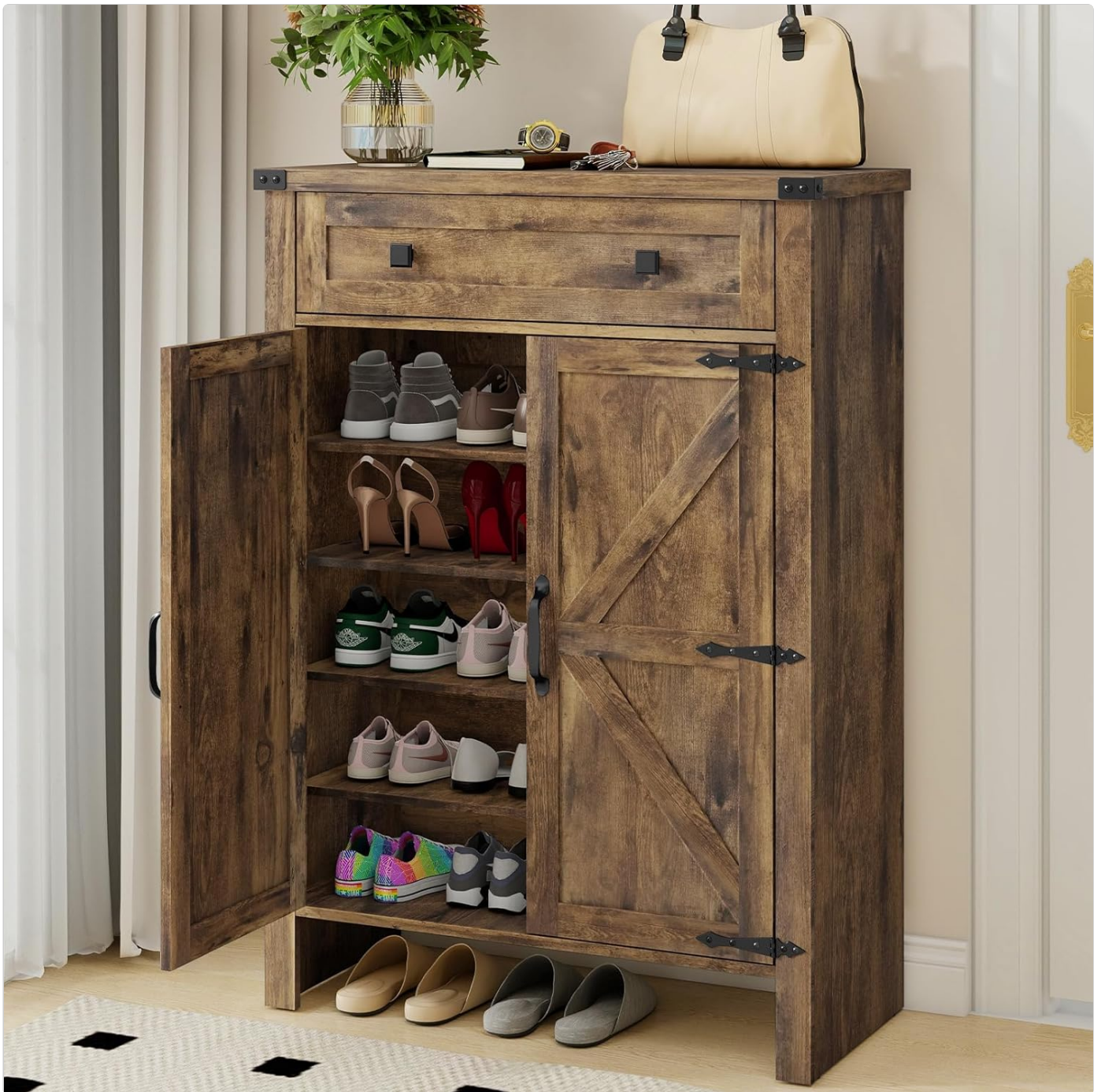
Image: The Halitaa Farmhouse Shoe Storage Organizer with its double doors open, showcasing multiple shelves filled with various types of shoes. A top drawer is also visible, and the cabinet features a rustic brown finish with black metal hardware.