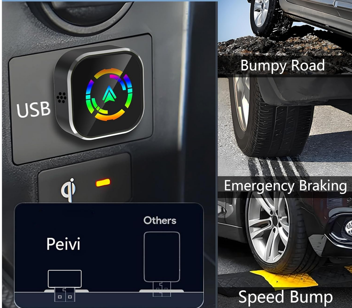
Image 1.3: The adapter's secure, flush fit in a car's USB port, designed to prevent disconnections during driving conditions like bumpy roads or emergency braking.

100% Increase in Secure Connections Almost flush with socket to prevent wobbling