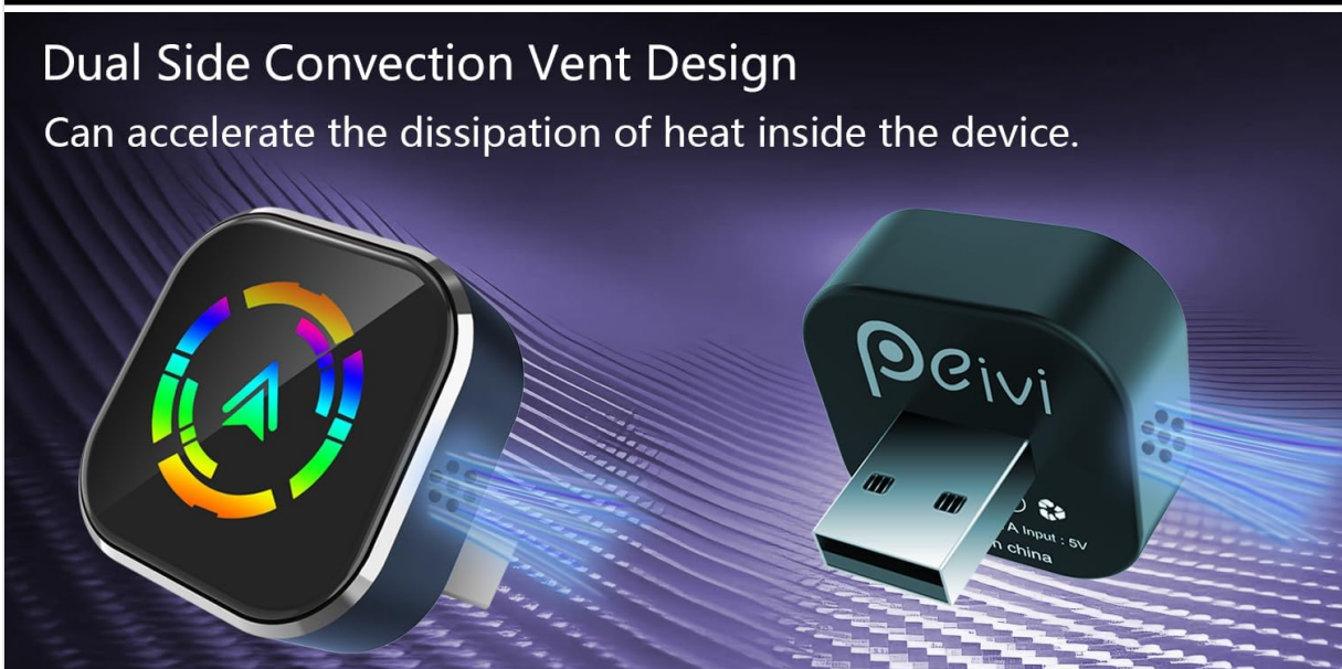
Image 4.1: The adapter allows full use of original CarPlay and Android Auto functionalities, including voice commands, navigation, music, calls, and calendar.

Can accelerate the dissipation of heat inside the device.