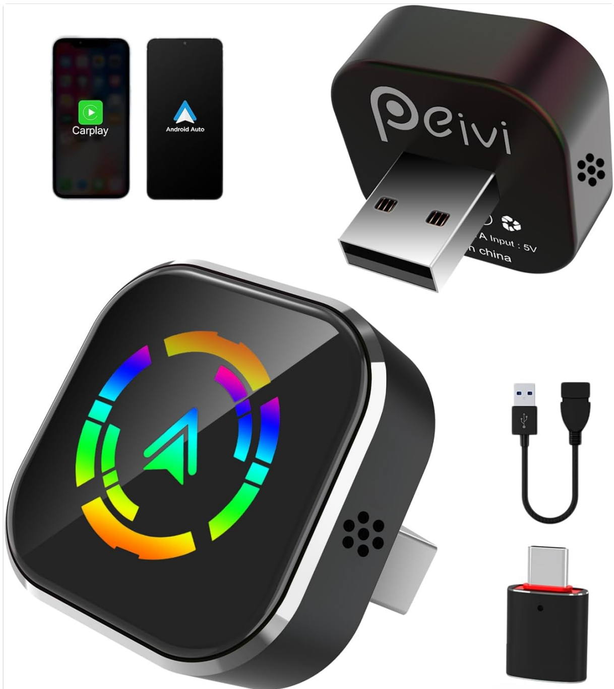
Image 1.1: The peivi Wireless CarPlay and Android Auto Adapter, shown with a USB Type-C adapter and a USB Type-A extension cable.