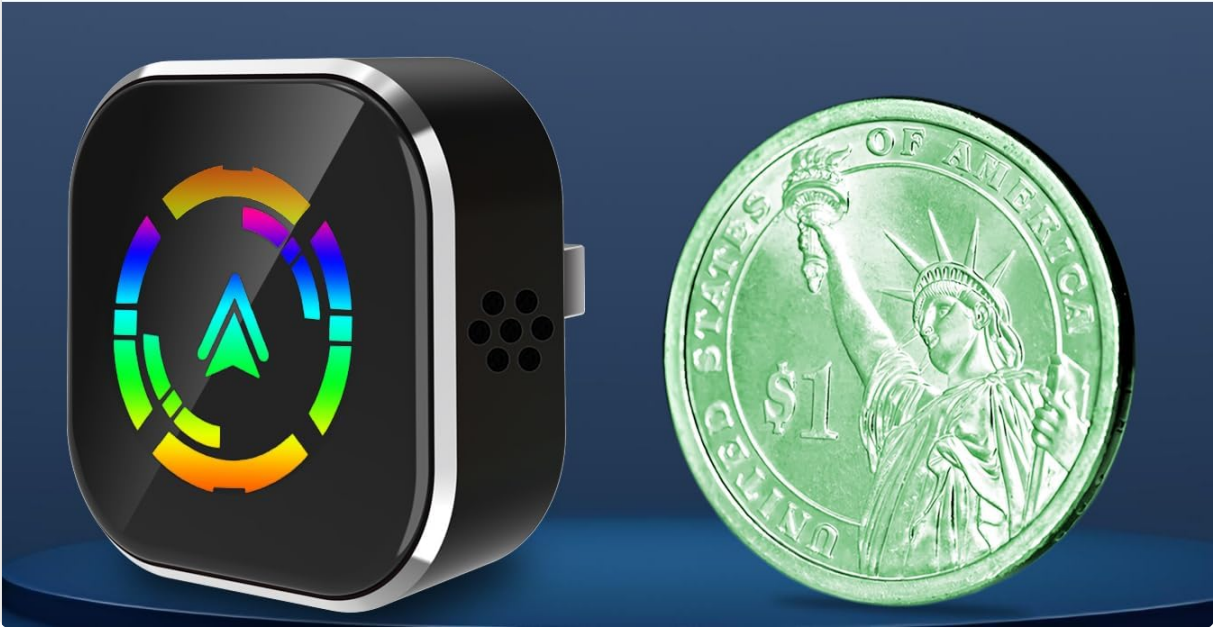
Image 1.2: The adapter's compact size, illustrated next to an AirPods case and a US dollar coin for scale.