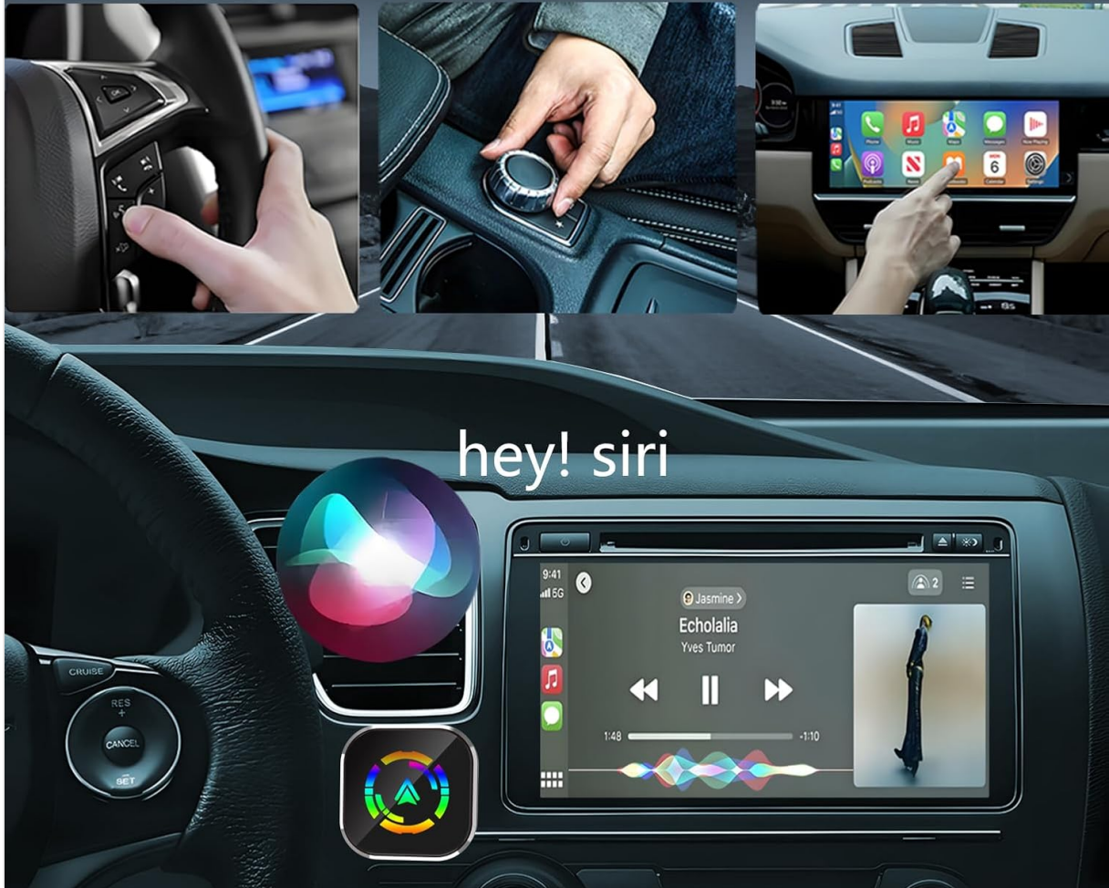
Image 5.1: The adapter is compatible with a wide range of car manufacturers and requires iOS 10+ or Android 11+.

For a detailed list of compatible vehicles, please refer to the official compatibility pages: