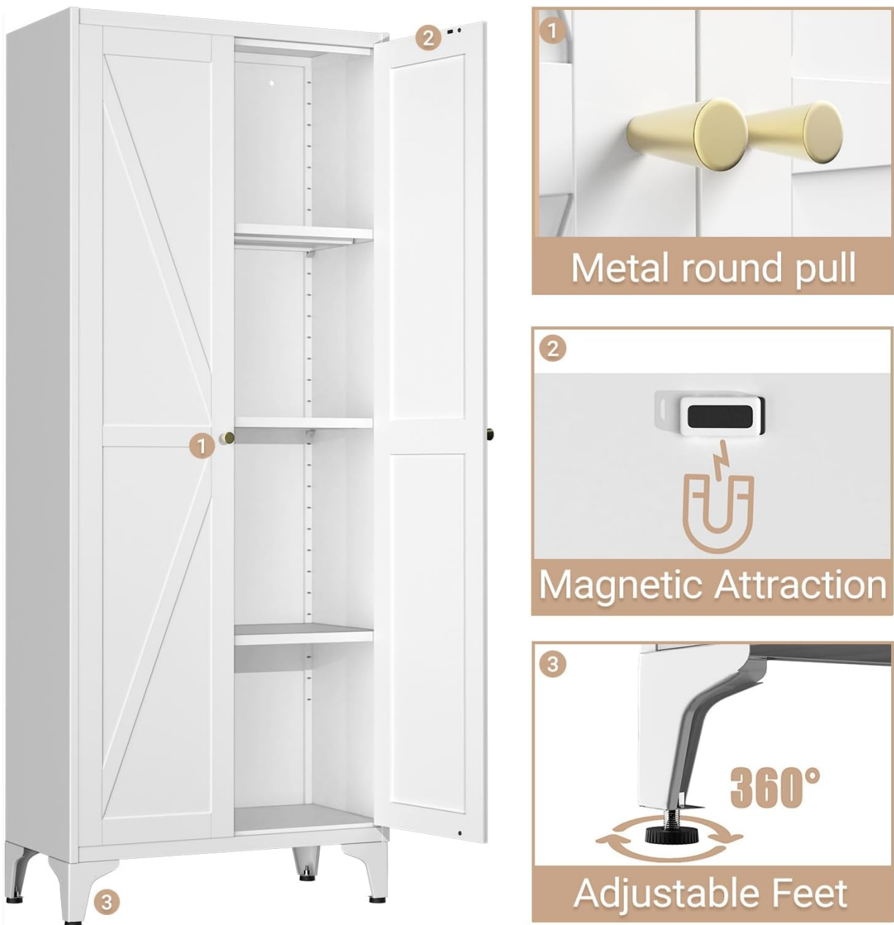
Image 4.2: Detailed view of the cabinet's features, including the metal round pull, magnetic door attraction for secure closure, and 360-degree adjustable feet for leveling.