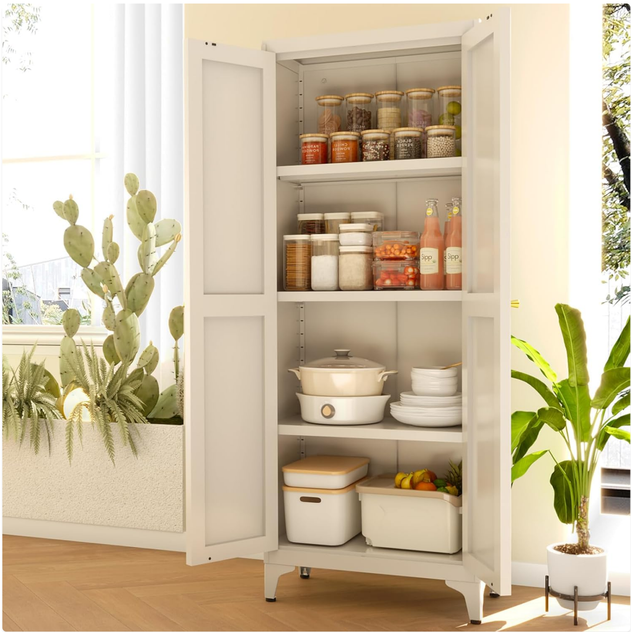
Image 5.2: The cabinet with its doors open, revealing a well-organized interior filled with various food containers, dishes, and small appliances, demonstrating its large storage capacity.