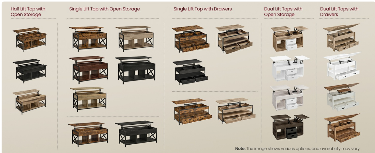
Image: All-in-One Storage features of the VASAGLE Coffee Table.