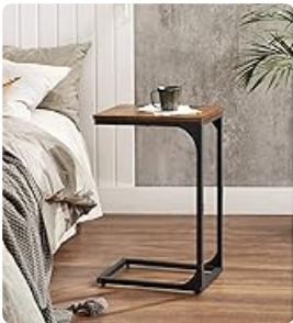
Image: Product dimensions and load capacity.