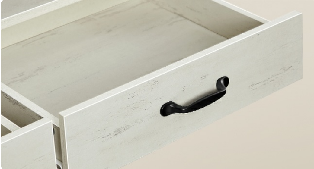
Image: Versatile use options for the coffee table.

Your browser does not support the video tag.