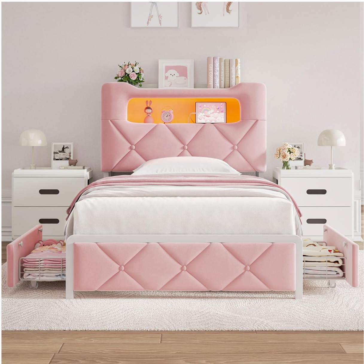
Image: The Jocoevol Twin Upholstered LED Bed Frame in pink, showcasing the headboard with LED lighting and open storage drawers at the foot of the bed.