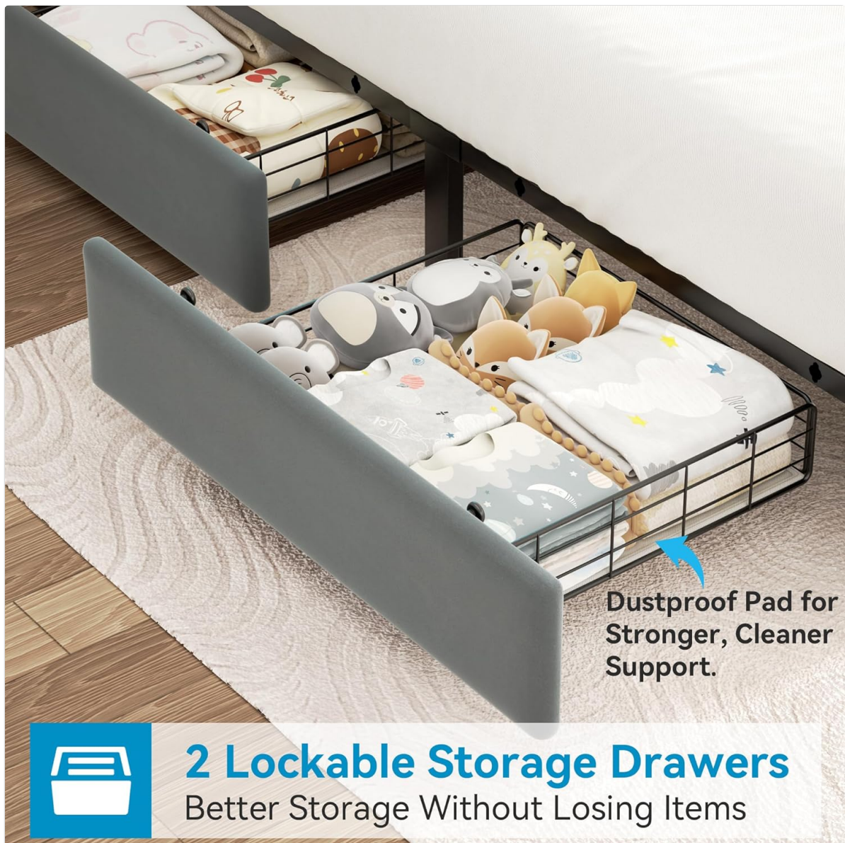
Figure 3: The two lockable storage drawers provide ample space and feature dustproof pads for protection.