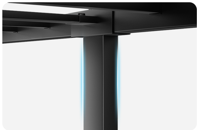
Figure 8: Detailed view of LED light features and control options.