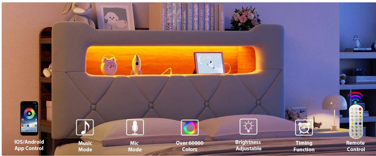
Figure 6: The multi-functional headboard features an LED strip, USB & Type-C ports, and 2-tier storage.