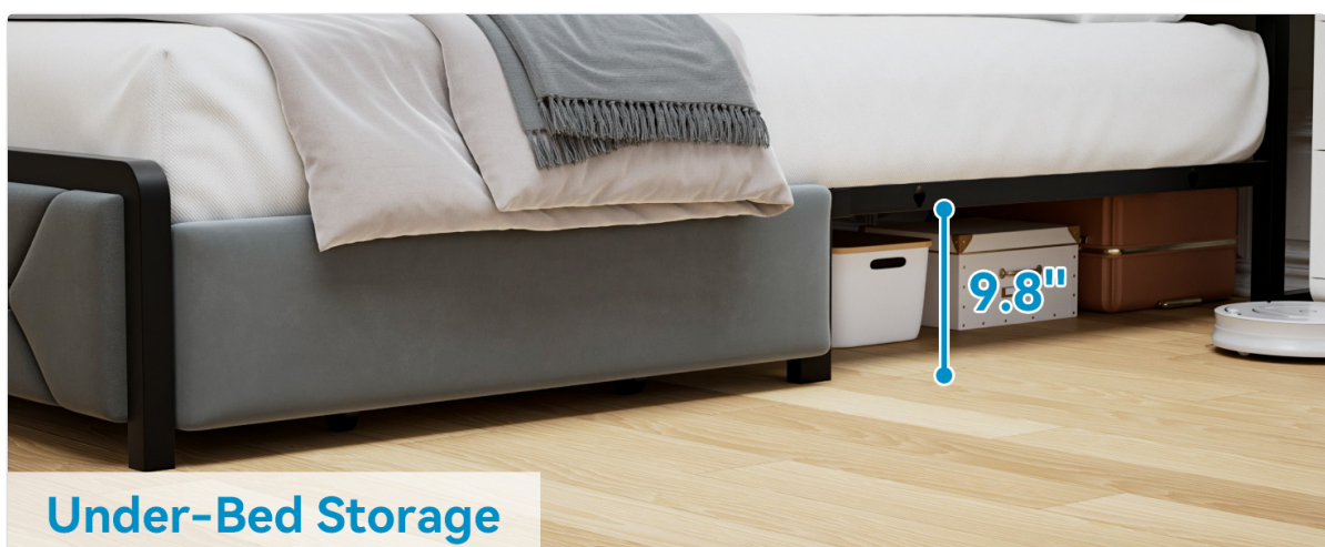
Figure 4: Generous storage space provided by the smooth-rolling drawers.