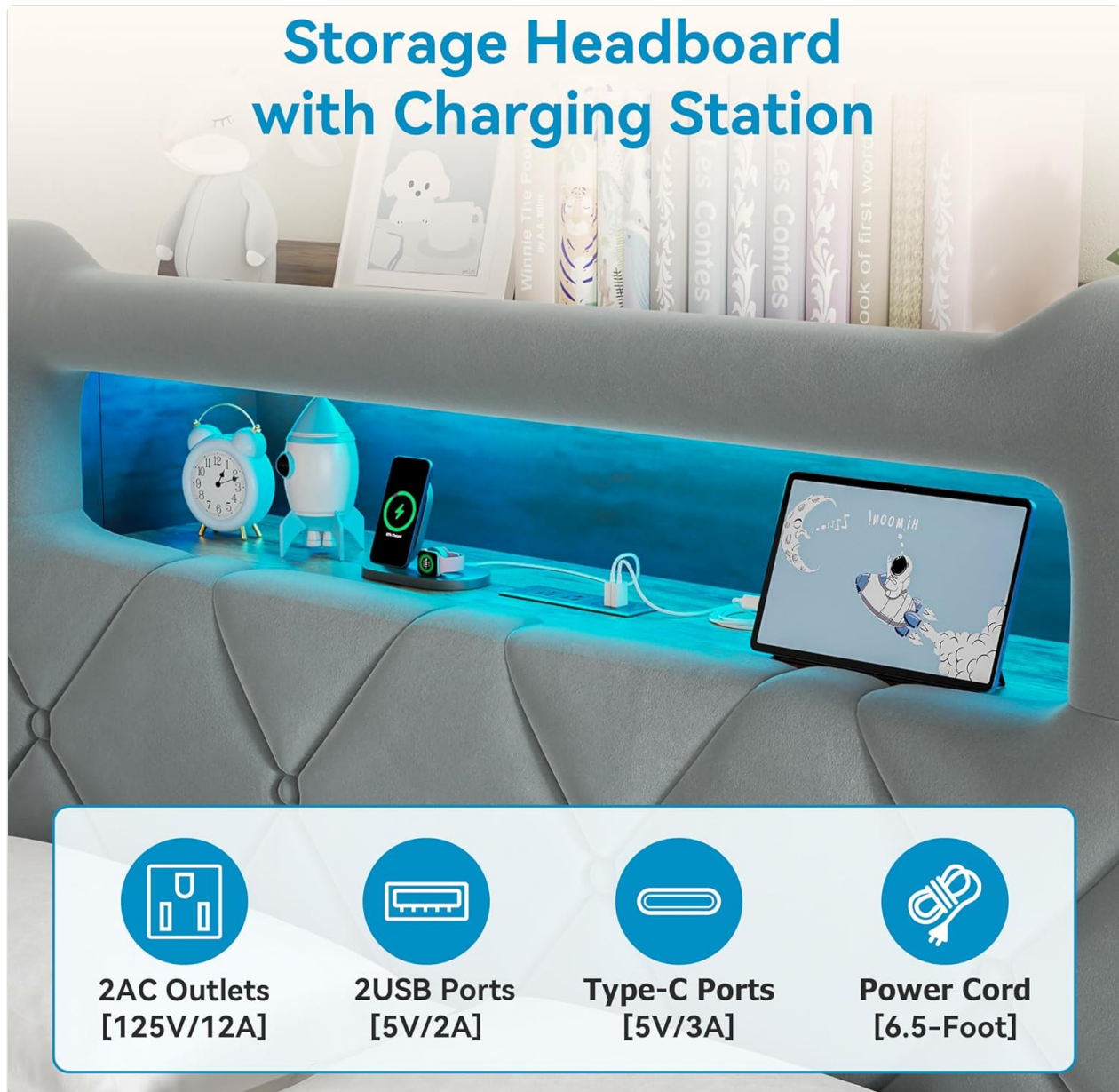
Figure 5: Integrated charging station with AC outlets, USB, and Type-C ports for convenient device charging.