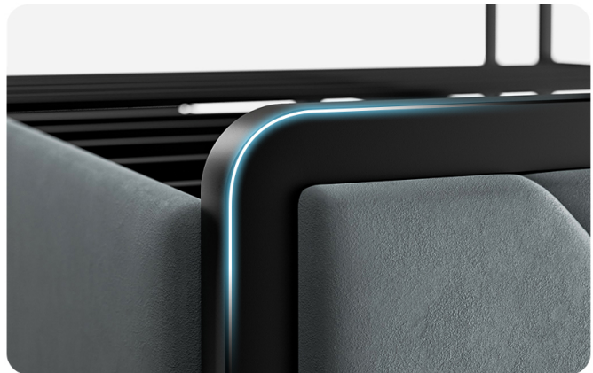
Figure 2: Detail of the steel support system with EVA foam for silent operation.