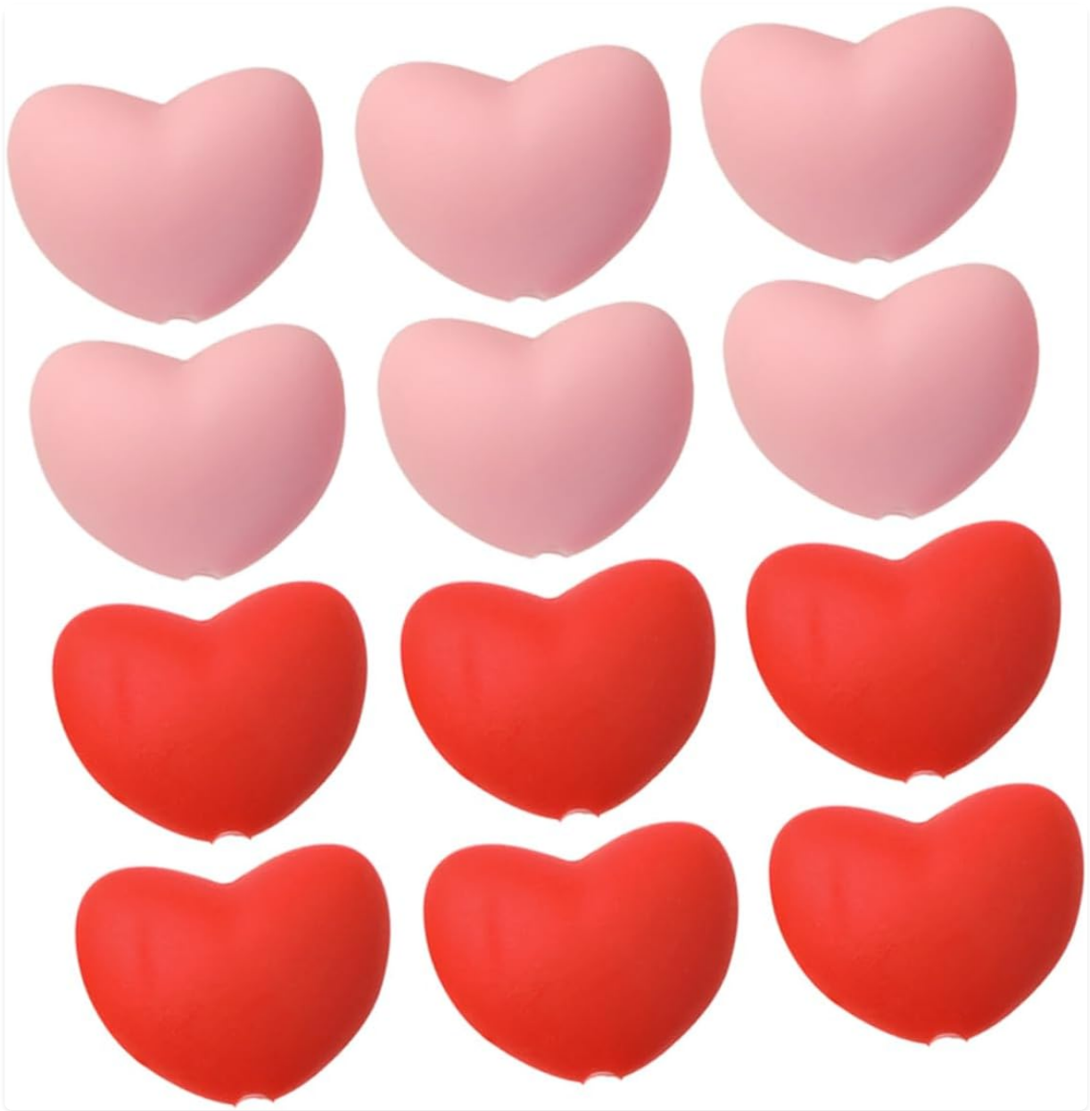
Image: A set of Angoily Heart Shaped Silicone Needle Caps, showcasing the variety of colors included.