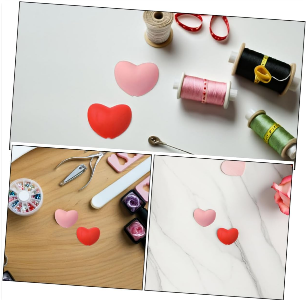
Image: Angoily Needle Caps shown in a crafting environment, demonstrating their use with knitting and sewing accessories.