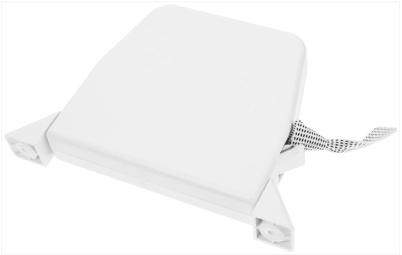
Figure 1: Front view of the LIFKOME Blind Cord Winder. This image shows the compact, white housing of the winder with the cord neatly integrated.