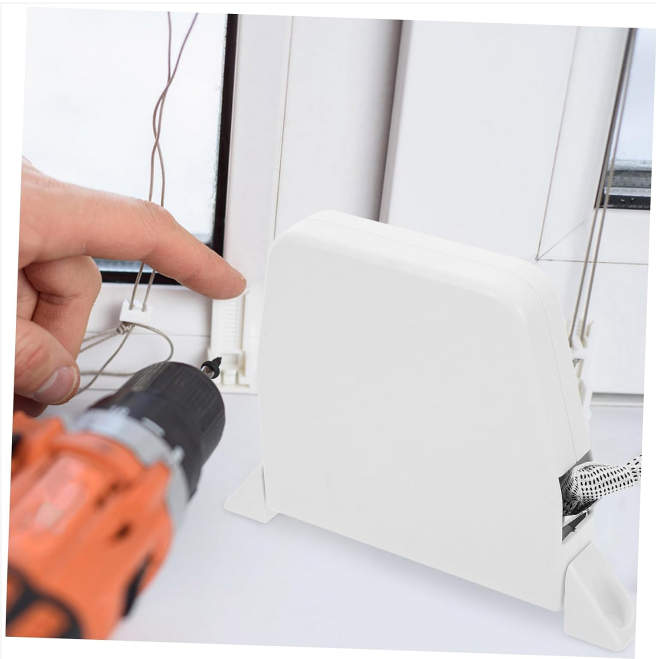
Figure 6: Cord insertion detail. A close-up view showing the patterned blind cord entering the winder's slot, indicating how the cord is managed.