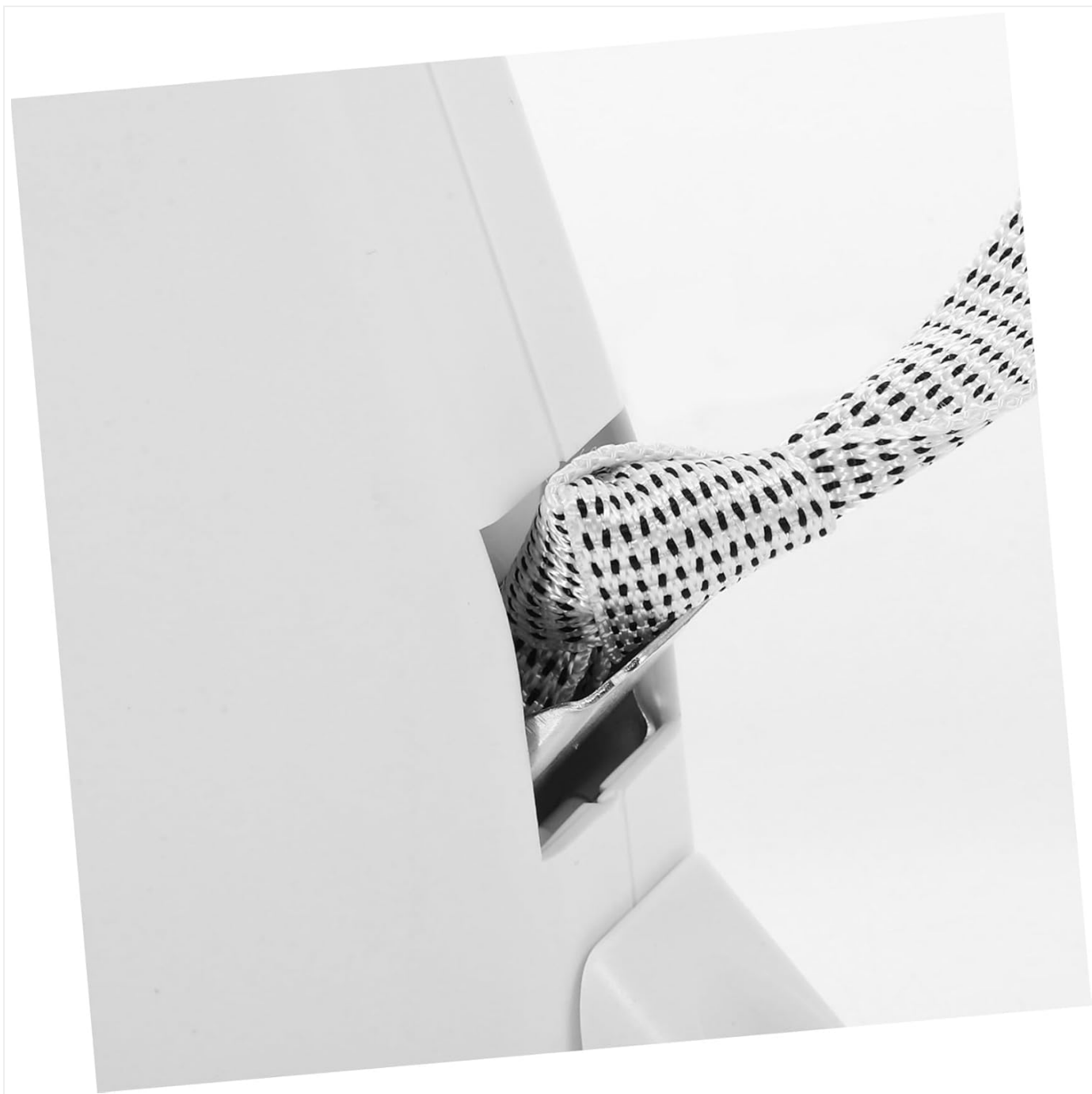
Figure 7: Winder in operation with plantation shutters. This image shows the winder mounted and managing the cord for a set of white plantation shutters, demonstrating its discreet integration.