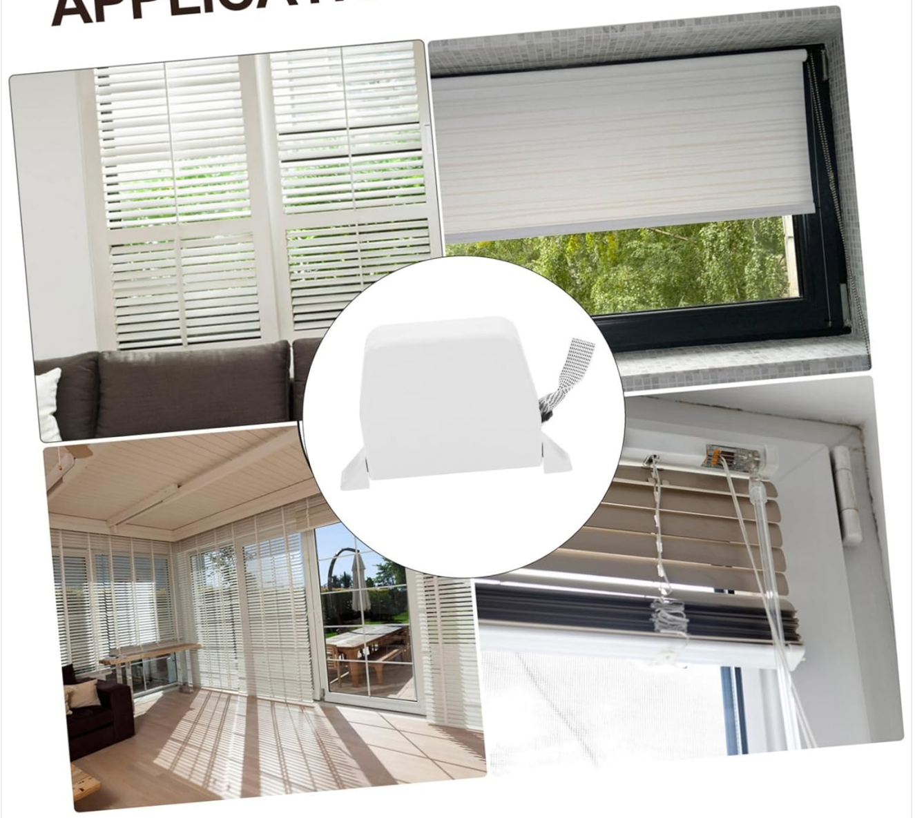
Figure 3: Application scenarios. This image displays various window types and blind setups where the cord winder can be effectively used, including standard window blinds and plantation shutters.