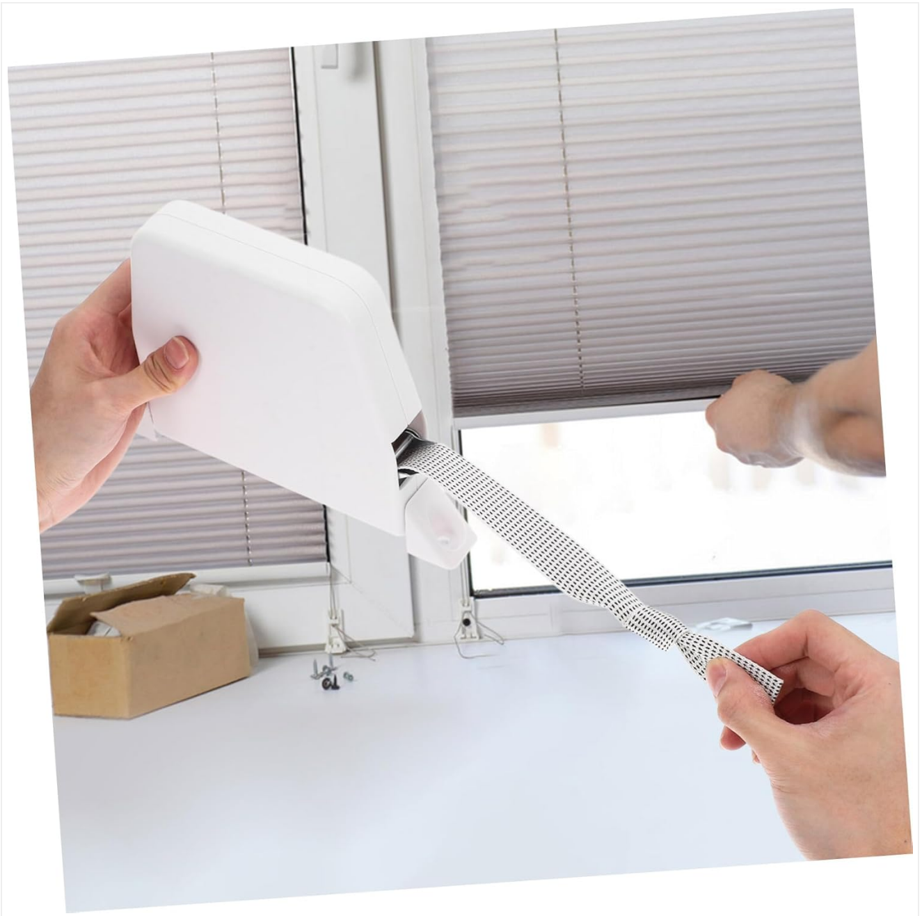
Figure 4: Preparing the blind cord. This image shows hands holding the blind cord and the winder, demonstrating the initial step of feeding the cord into the device.