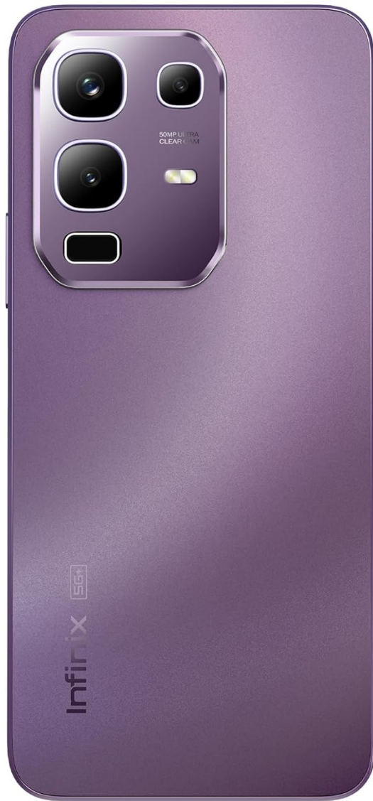
Image Description: Rear view of the Infinix Note 50x 5G+ smartphone, highlighting the rectangular camera module with multiple lenses and the Infinix branding.