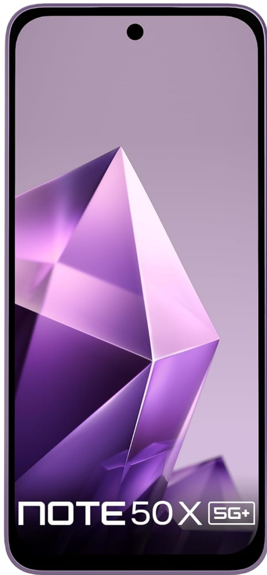
Image Description: Front view of the Infinix Note 50x 5G+ smartphone, showcasing its display with a punch-hole camera at the top center.