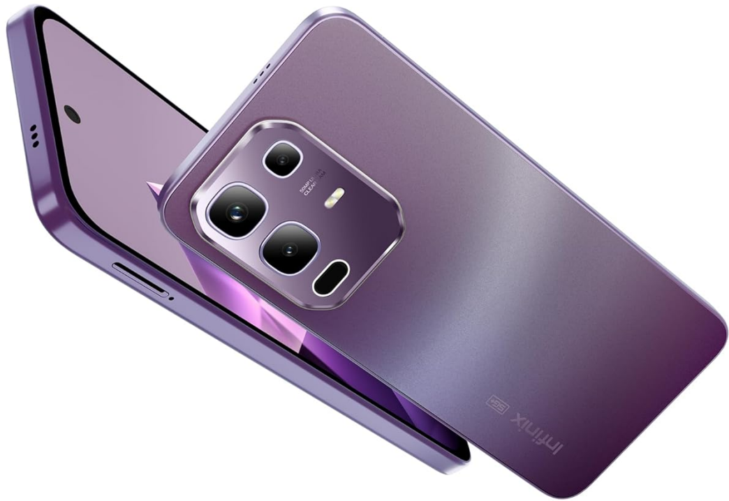
Image Description: A detailed view of the Infinix Note 50x 5G+ camera module, highlighting the 50MP dual rear cameras, flash, and the Active Halo Lighting feature.