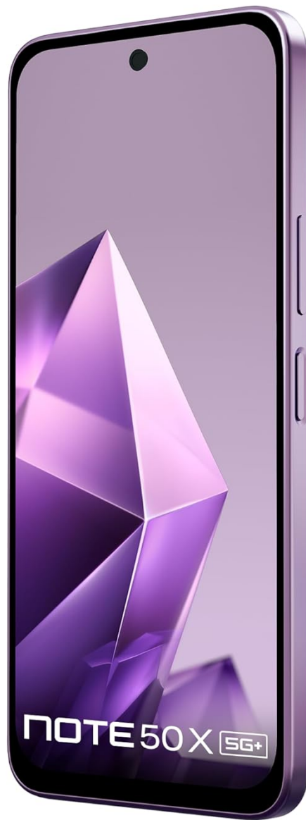
Image Description: Side view of the Infinix Note 50x 5G+ smartphone, illustrating the placement of the power button (which includes the fingerprint sensor), volume rocker, and SIM card tray.