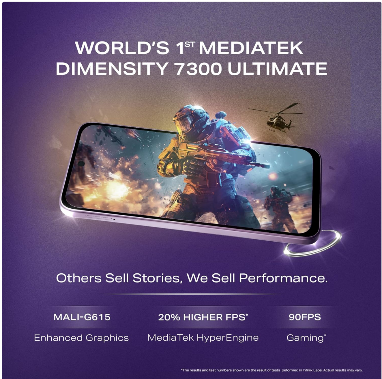
Image Description: A visual representation of the Infinix Note 50x 5G+ delivering smooth 90FPS gaming performance in BGMI, highlighting its MediaTek Dimensity 7300 Ultimate processor.

The Infinix Note 50x 5G+ is powered by the MediaTek Dimensity 7300 Ultimate processor, offering robust performance for demanding applications and gaming.