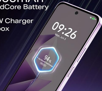
Image Description: The Infinix Note 50x 5G+ highlighting its MIL-STD-810H military-grade durability and IP64 rating, indicating resistance to drops, dust, and water splashes.