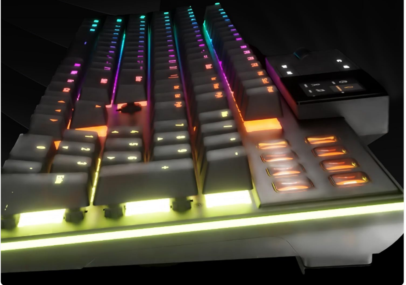
Image: The keyboard illuminated with per-key ARGB lighting and a surrounding lightbar, creating dynamic and atmospheric effects.