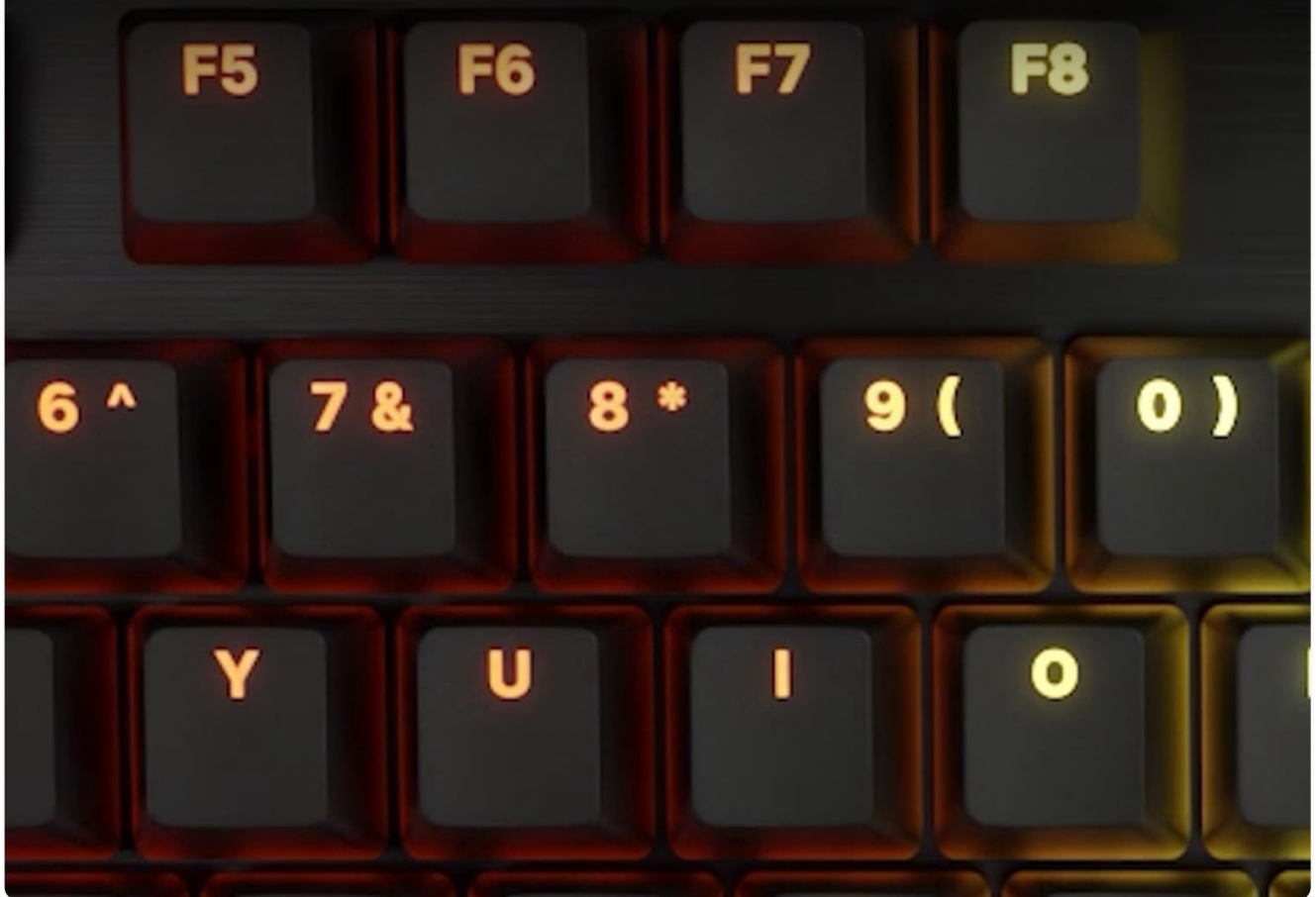
Image: A close-up of the high-quality PBT double-shot keycaps, featuring translucent legends that are resistant to wear and fading.

High-quality PBT double-shot keycaps with translucent legends that will never fade or wear off