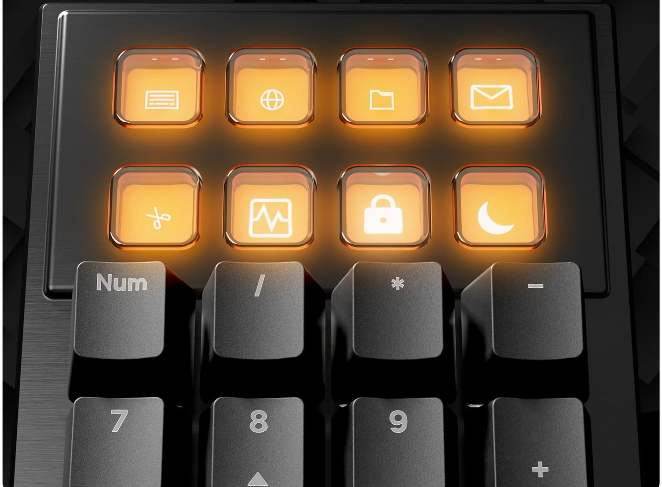
Image: The keyboard's 8 customizable display keys, each capable of showing custom icons or animated GIFs for quick access to functions or applications.