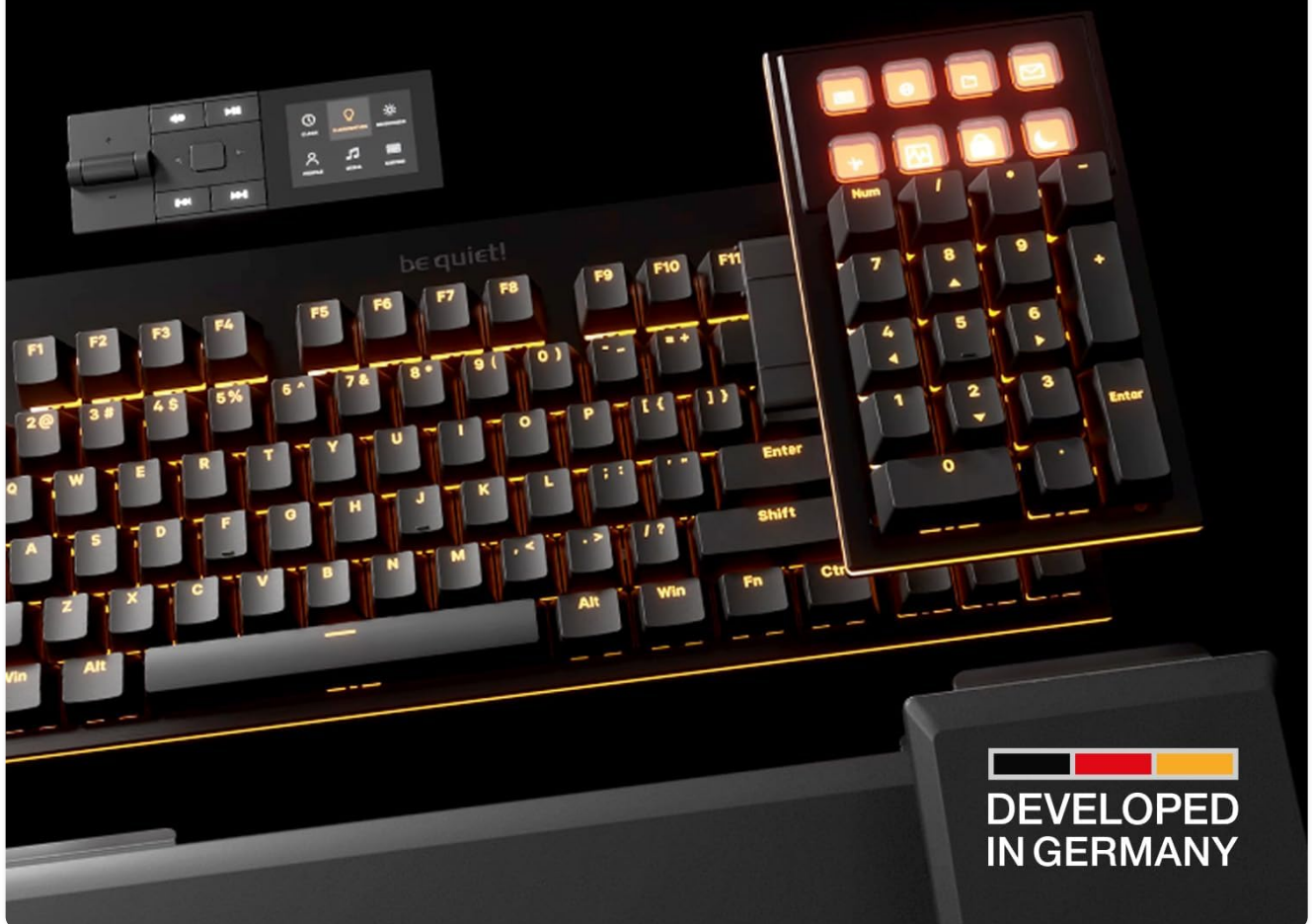
Image: The be quiet! Dark Mount Mechanical Keyboard showcasing its unparalleled modularity with a detachable Numpad and Media Dock, allowing for flexible configurations.