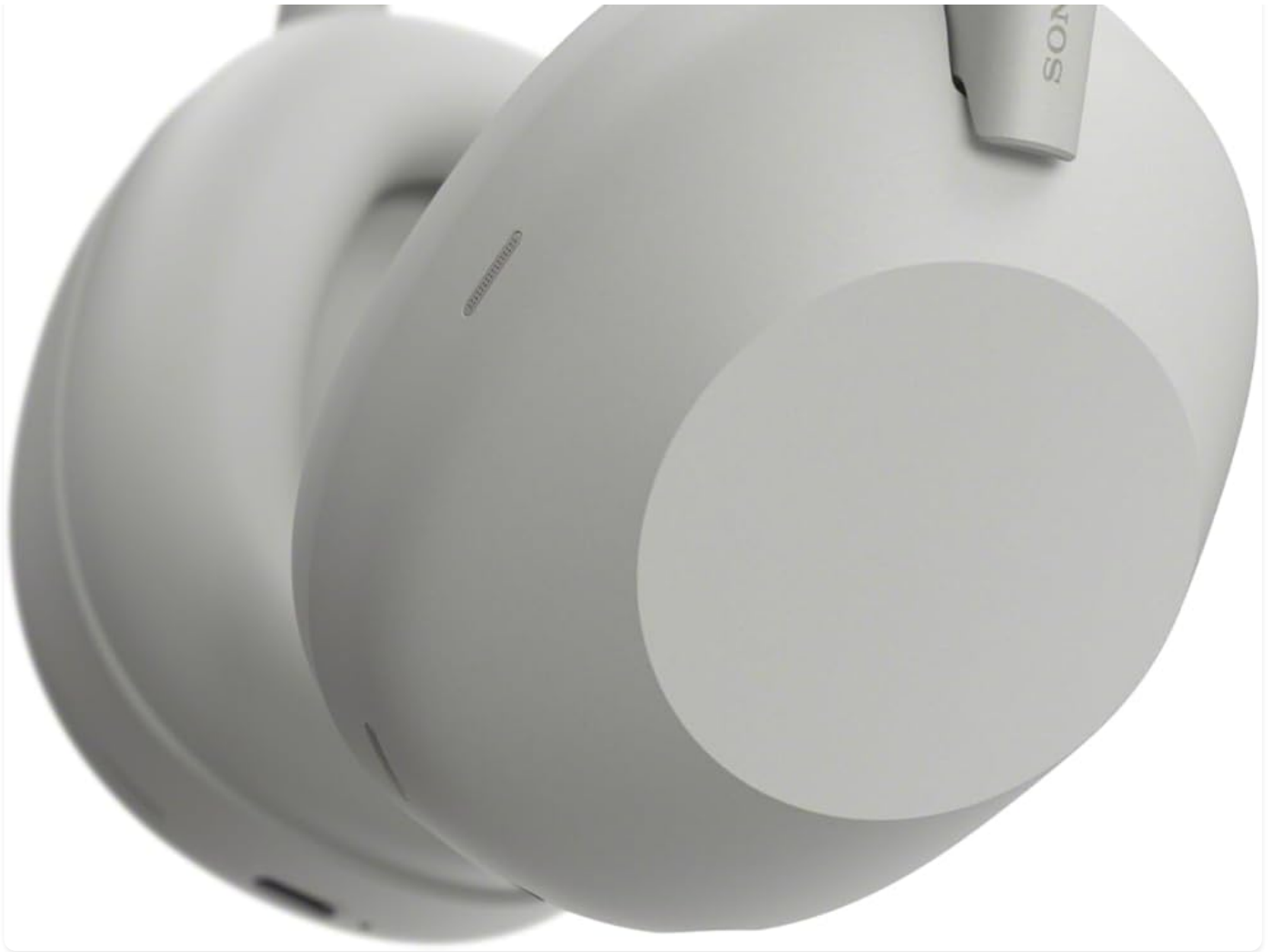
Image: Front view of the Sony WH-1000XM6 headphones in Platinum Silver.