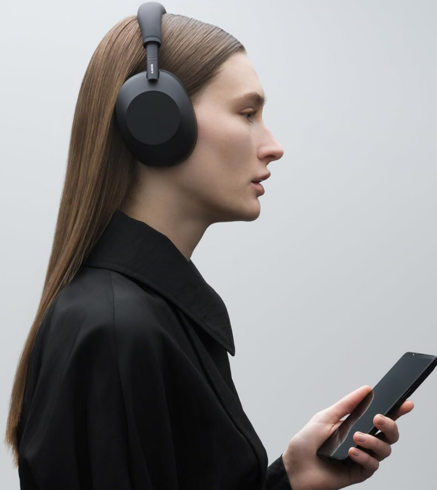
Image: A person wearing the headphones, demonstrating the noise cancellation feature in a busy environment.

A 6-microphone AI beamforming system isolates your voice from background noise.