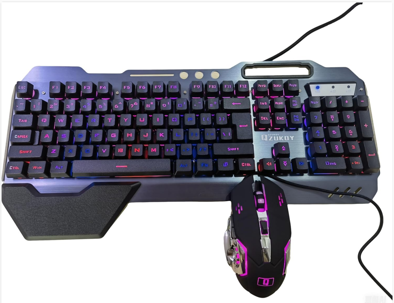
Image: The QZUKOY RGB Gaming Keyboard and Mouse Set connected and illuminated, ready for use.