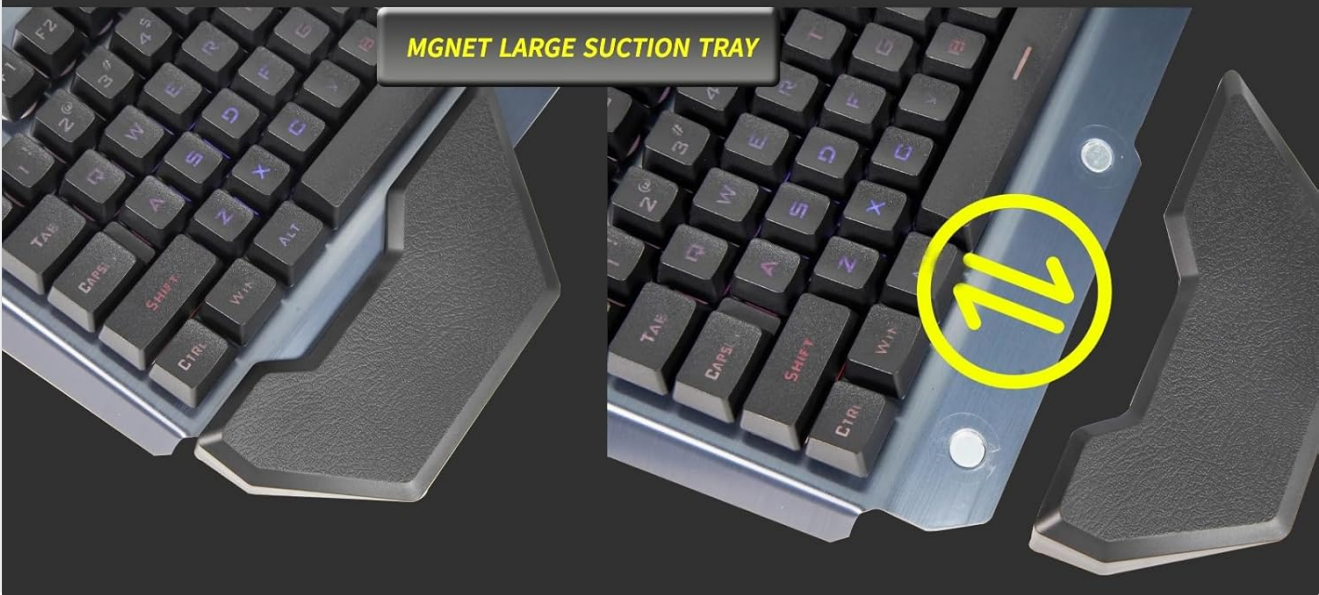
Image: The QZUKOY RGB Gaming Keyboard showcasing its integrated phone holder and ergonomic wrist rest.