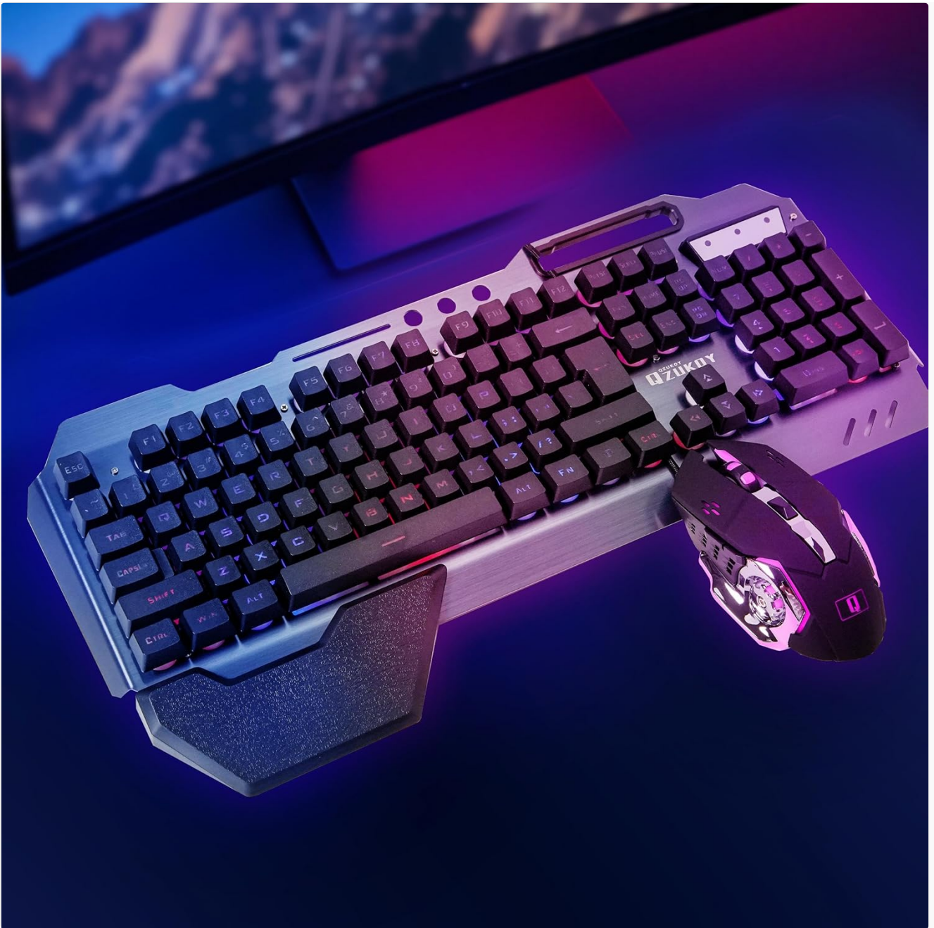
Image: The QZUKOY RGB Gaming Mouse, highlighting its buttons and adjustable DPI settings.