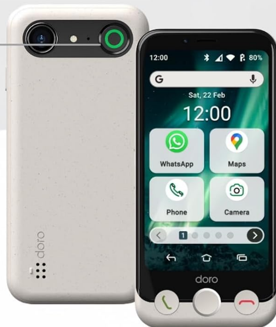
Image: A visual representation of the Doro Aurora A10 highlighting its key features such as the Easy Interface, Doro Secure Button, ClearSound technology, and physical tactile buttons.