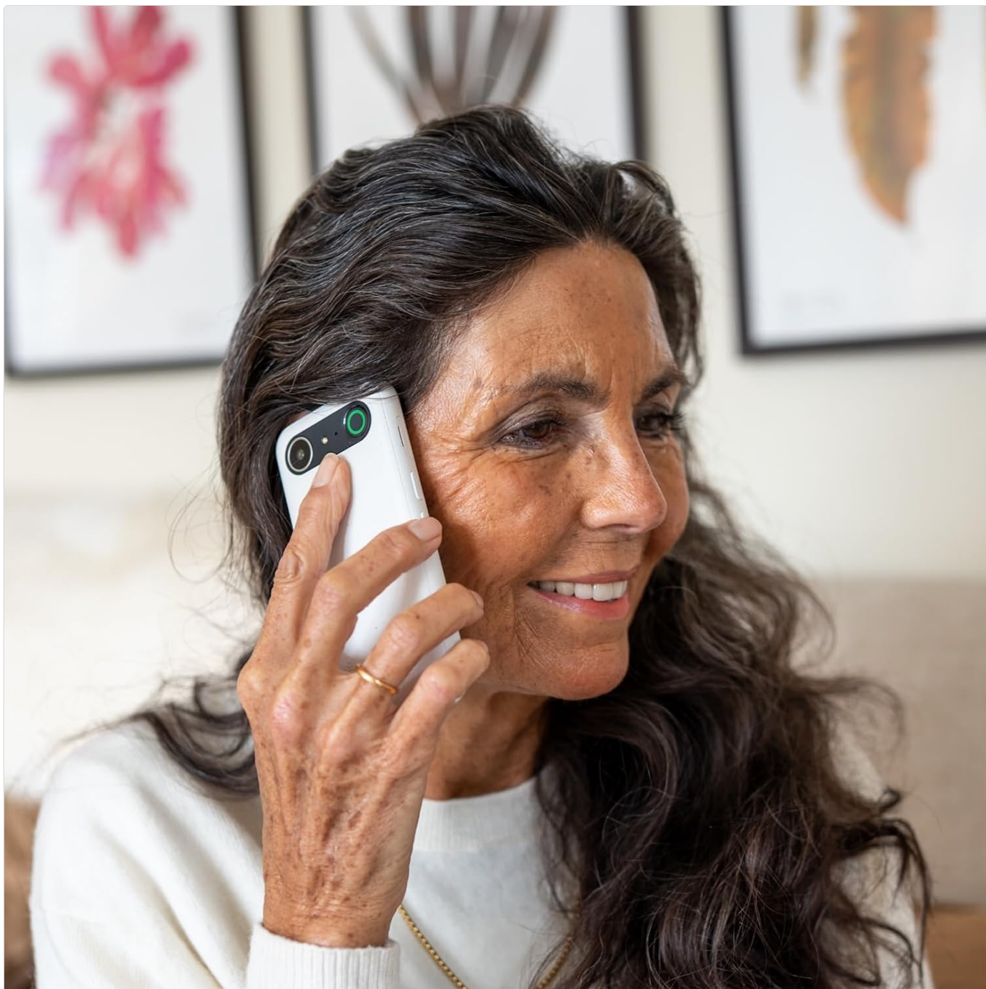
Image: A woman smiling while holding and using the Doro Aurora A10 mobile phone, demonstrating its comfortable grip and user-friendly design.