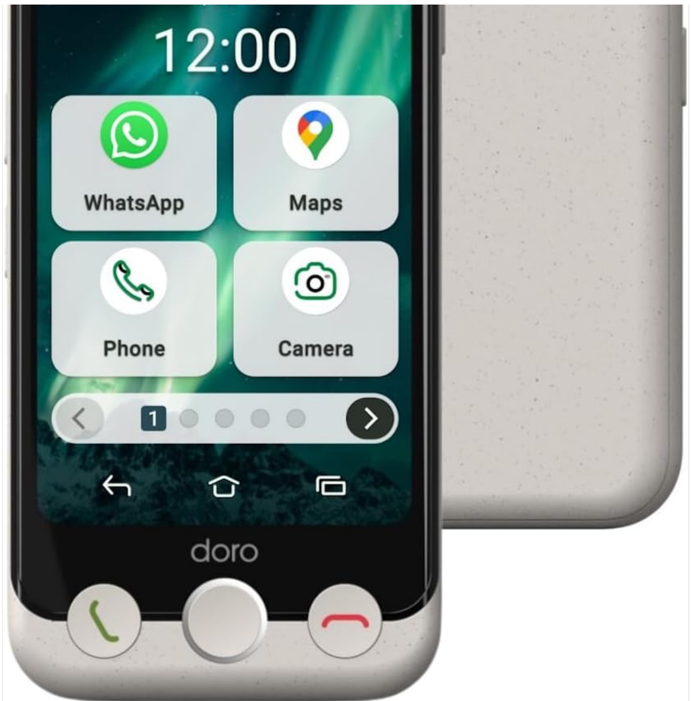
Image: The Doro Aurora A10 mobile phone, showing its front and back, alongside the included USB cable.