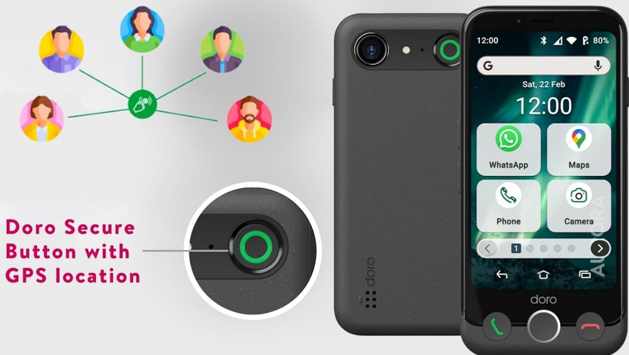
Image: An illustration showing the Doro Secure Button on the back of the Doro Aurora A10, emphasizing its GPS location feature and how it connects to a network of responders.

With optimised sound and three physical buttons, the Doro Aurora A10 provides a genuine ease of use for daily activities. You'll stay easily connected with your loved ones using the Doro Easy Interface, and at ease thanks to the Doro Secure Button. It activates the Response by Doro app to alert your loved ones quickly, should you need help at any time.