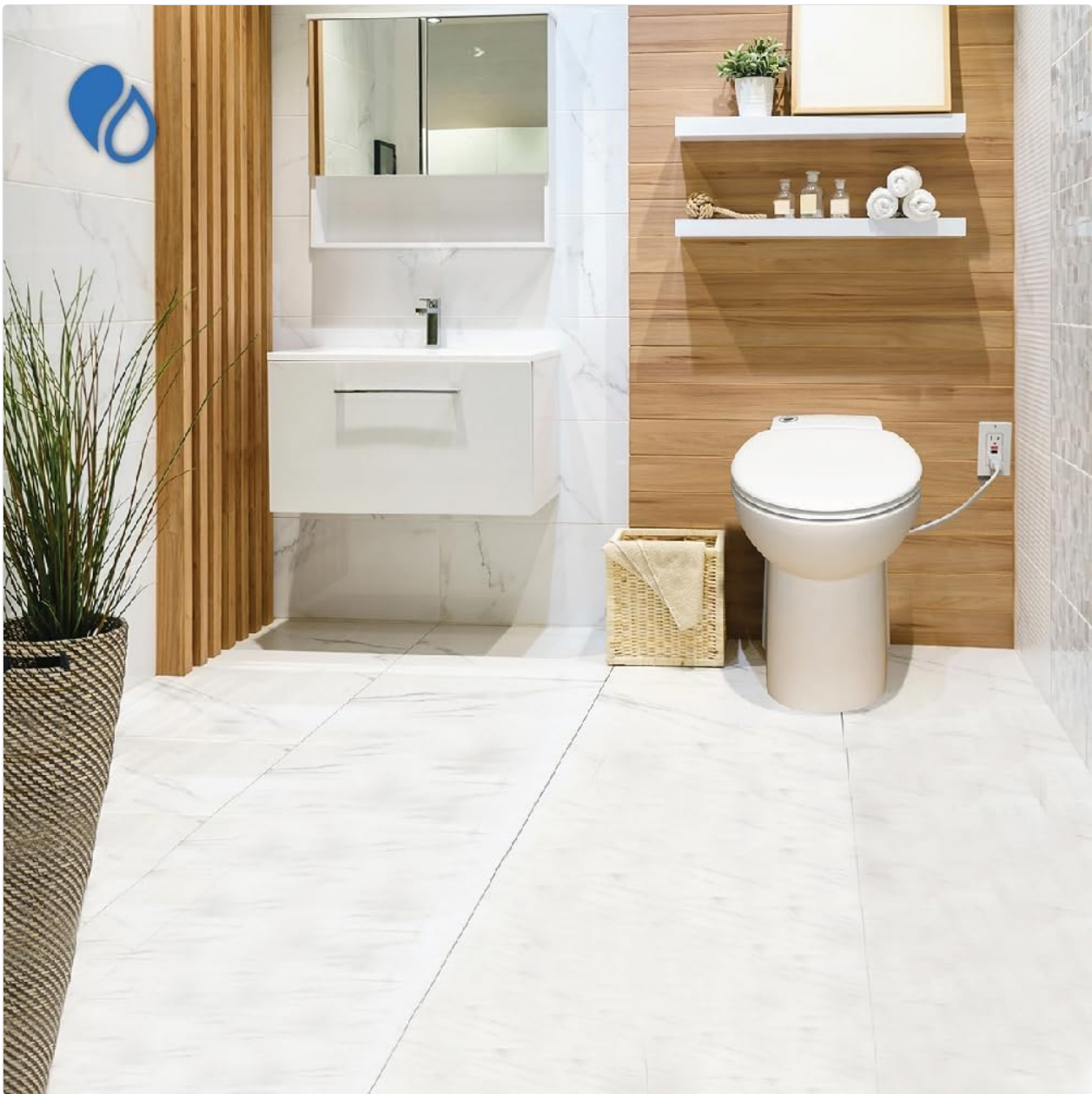
Figure 2: The Sanicompact Model 023 installed in a compact bathroom setting, demonstrating its space-saving design.