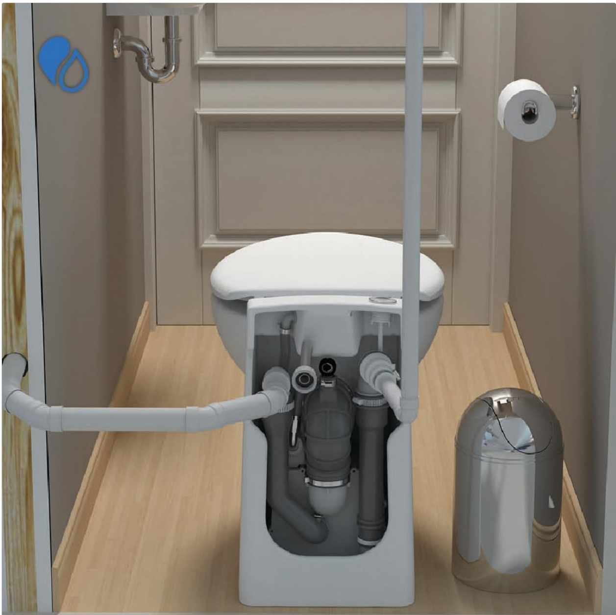
Figure 3: Cutaway view illustrating the internal macerating system and connection points for discharge and gray water inlet.

For detailed installation instructions, diagrams, and specific plumbing requirements, please refer to the official Saniflo website or the comprehensive manual provided with the product. A general product page can be found at: www.saniflo.com/us/home/74-sanicompact.html