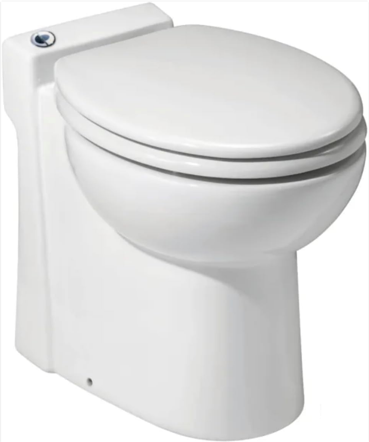
Figure 1: Front view of the Saniflo Sanicompact Model 023 macerating toilet.