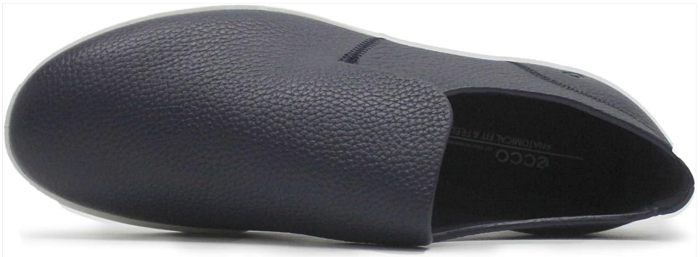
Image 4.1: Top-down view of the shoe, showing the overall shape and the opening for the foot.