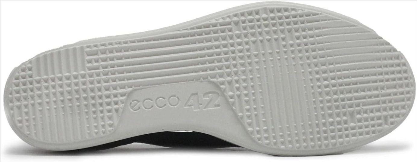
Image 6.1: View of the shoe's sole, showing the traction pattern and ECCO branding.