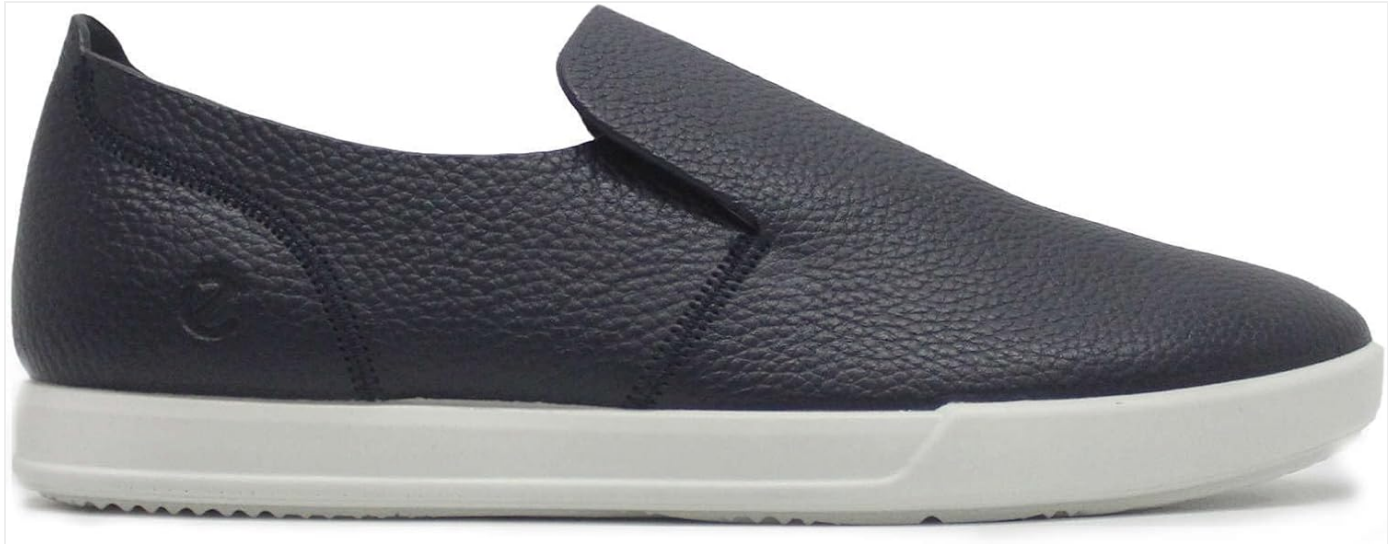
Image 1.1: Side view of the ECCO Mens Leisure 538824 Leather Marine Shoes, showcasing the dark leather upper and white sole.

The ECCO Mens Leisure 538824 Leather Marine Shoes are designed for comfort and durability, featuring a premium leather upper and a robust rubber sole. These slip-on shoes are suitable for various casual settings, offering both style and practical wear.