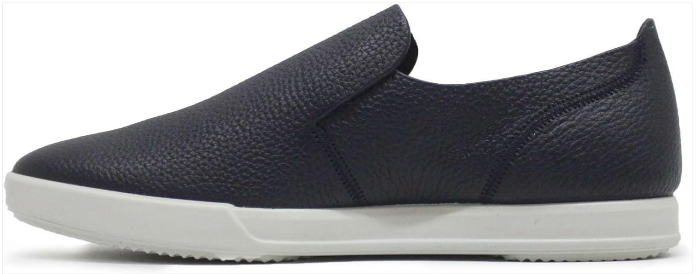
Image 2.1: Angled side view of the shoe, highlighting the texture of the leather and the sole design.