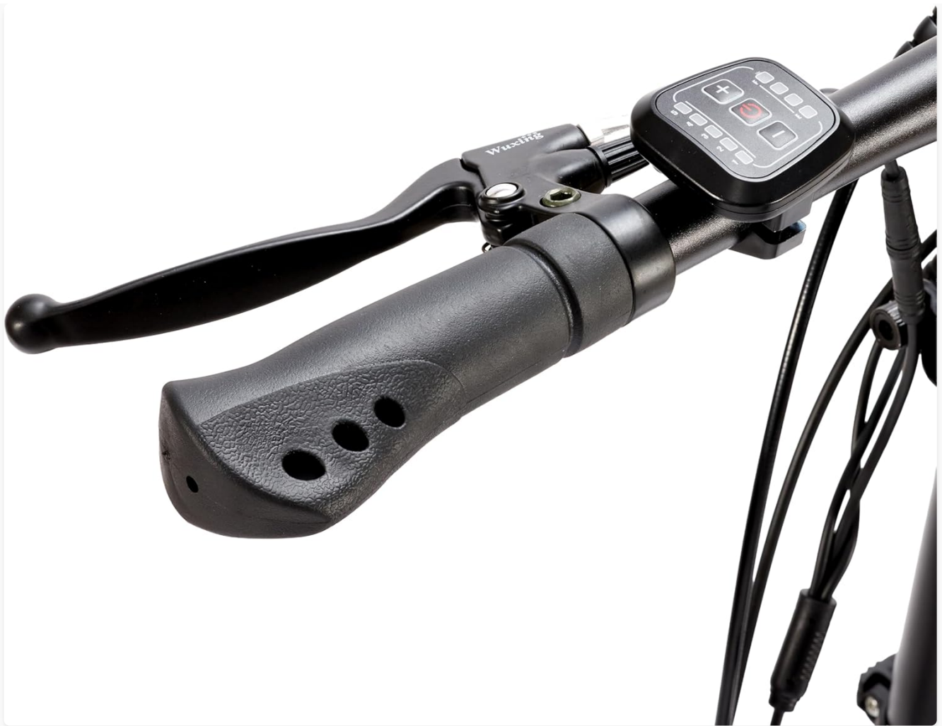
Image: Handlebar display and brake lever.