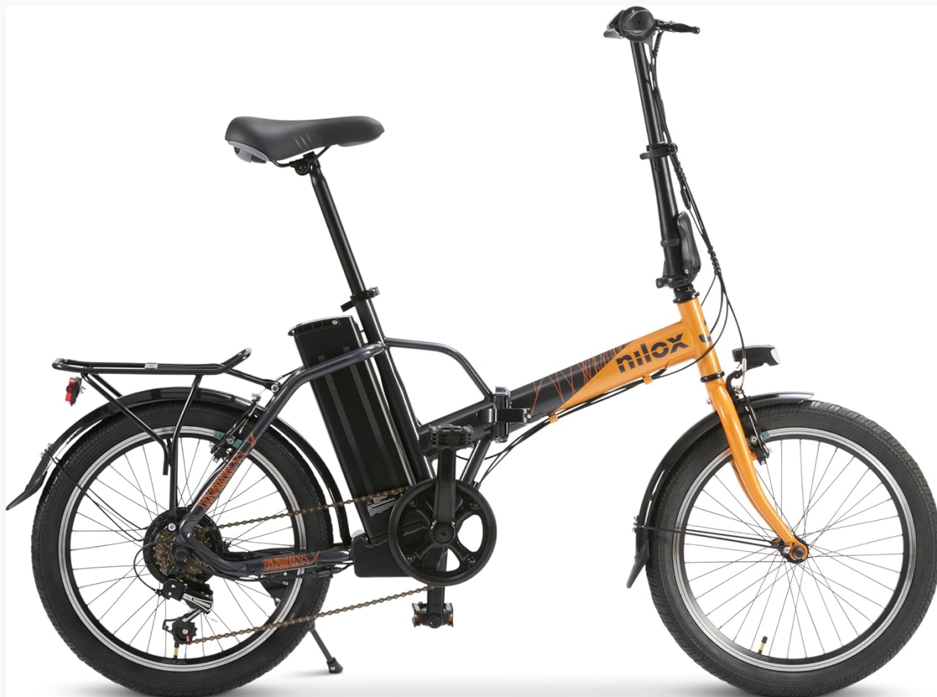
Image: Side view of the Nilox J1 PRO ORANGE Folding Electric Bike.

The Nilox J1 PRO ORANGE is a folding electric pedal-assisted bicycle designed for urban use. It combines portability with electric assistance, making it suitable for city commutes and leisure rides. This manual provides essential information for the safe and efficient use, assembly, and maintenance of your electric bike.