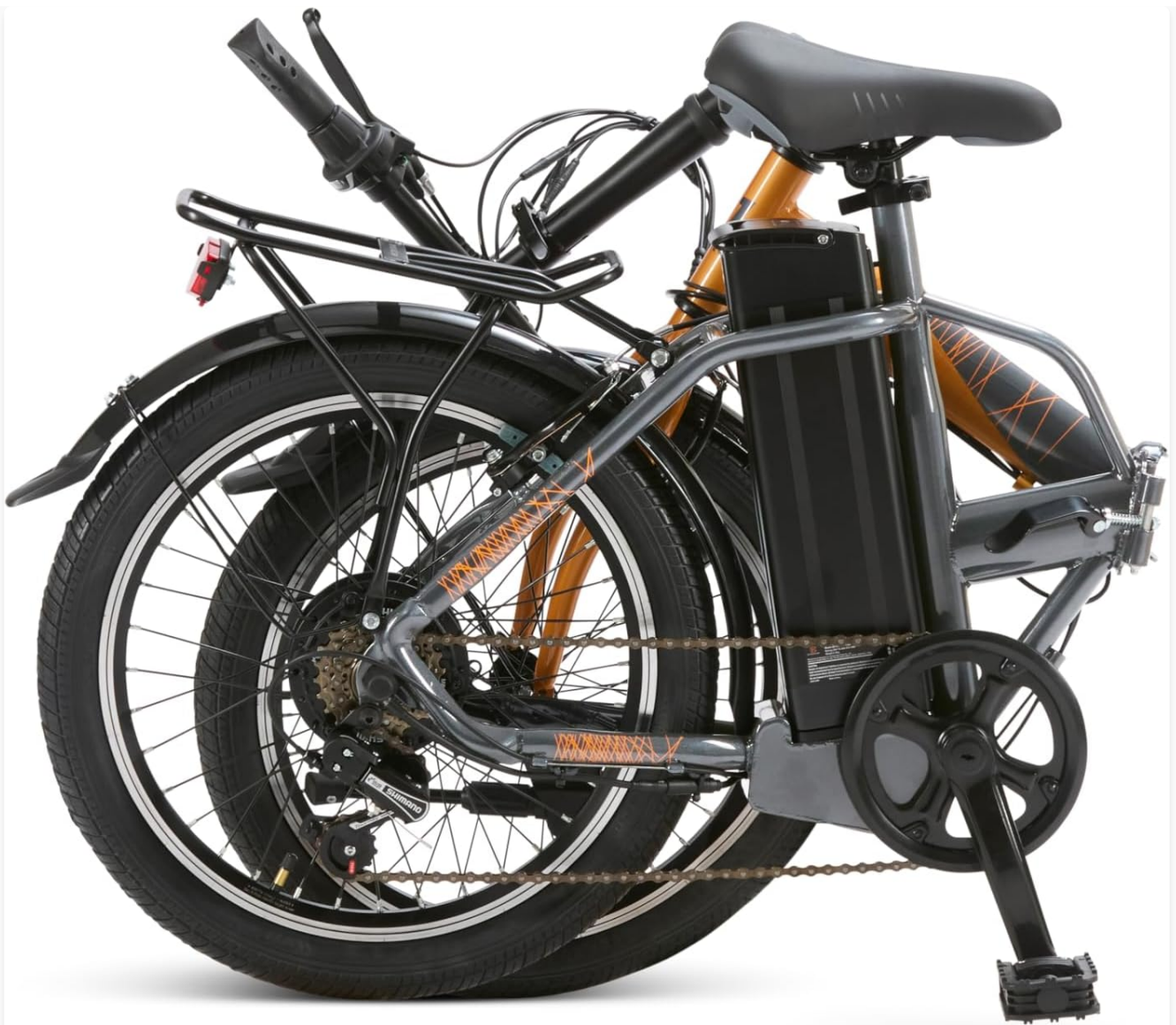
Image: The electric bike in its folded configuration.