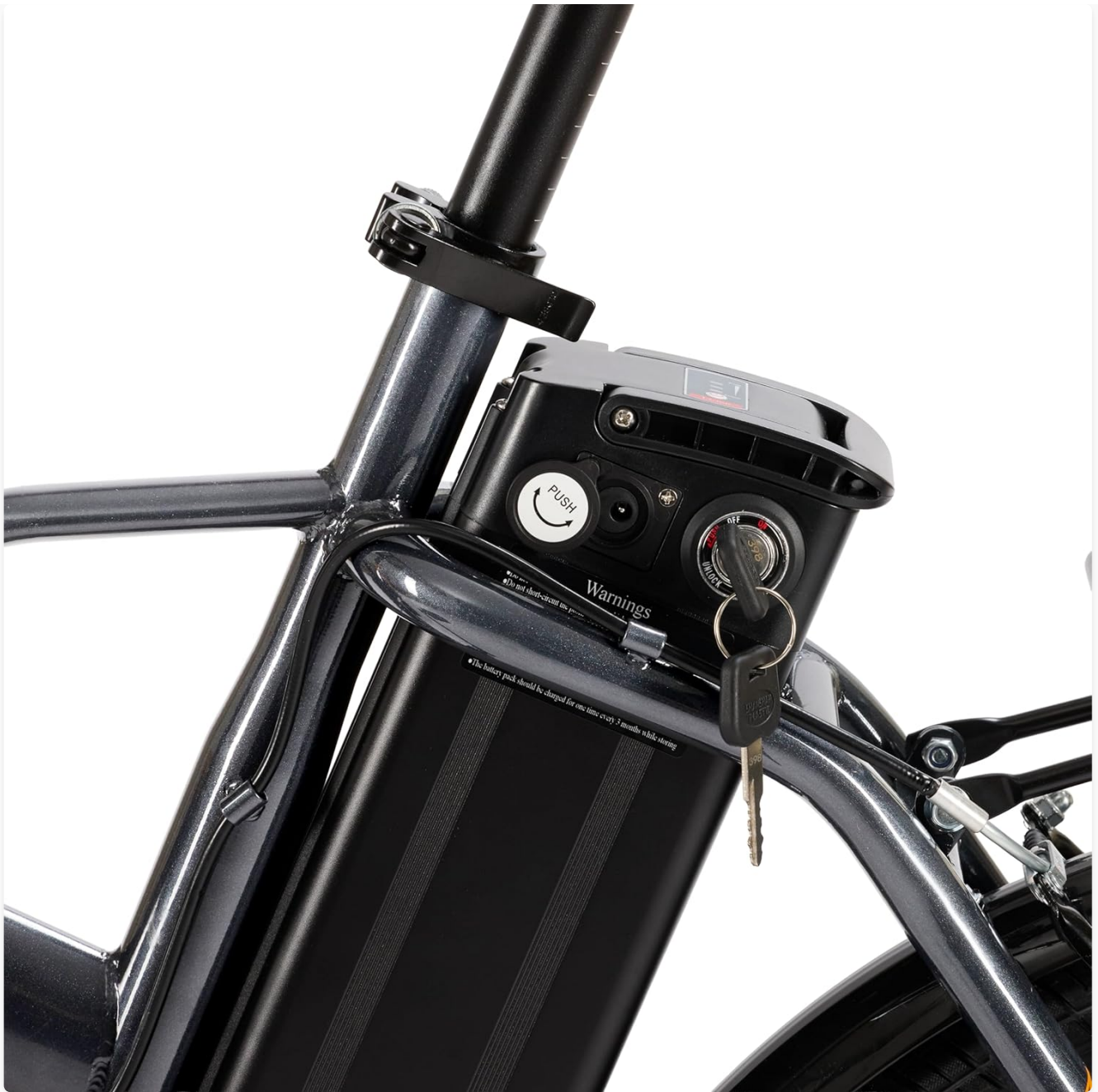
Image: Detail of the removable battery pack with key access.