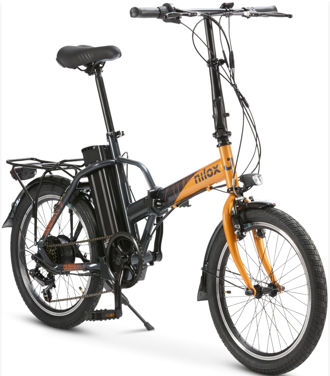
Image: Front view of the assembled electric bike.