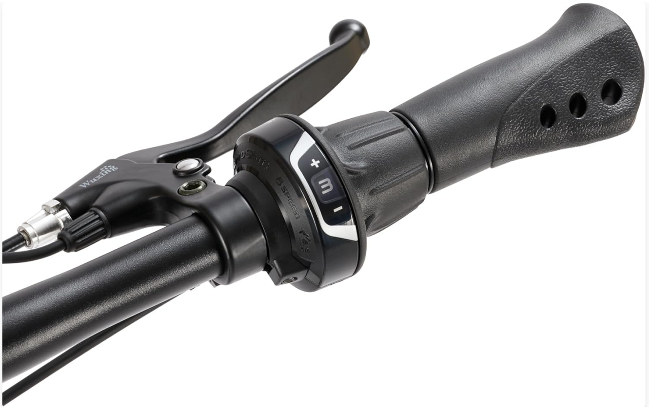
Image: Handlebar with gear shifter.