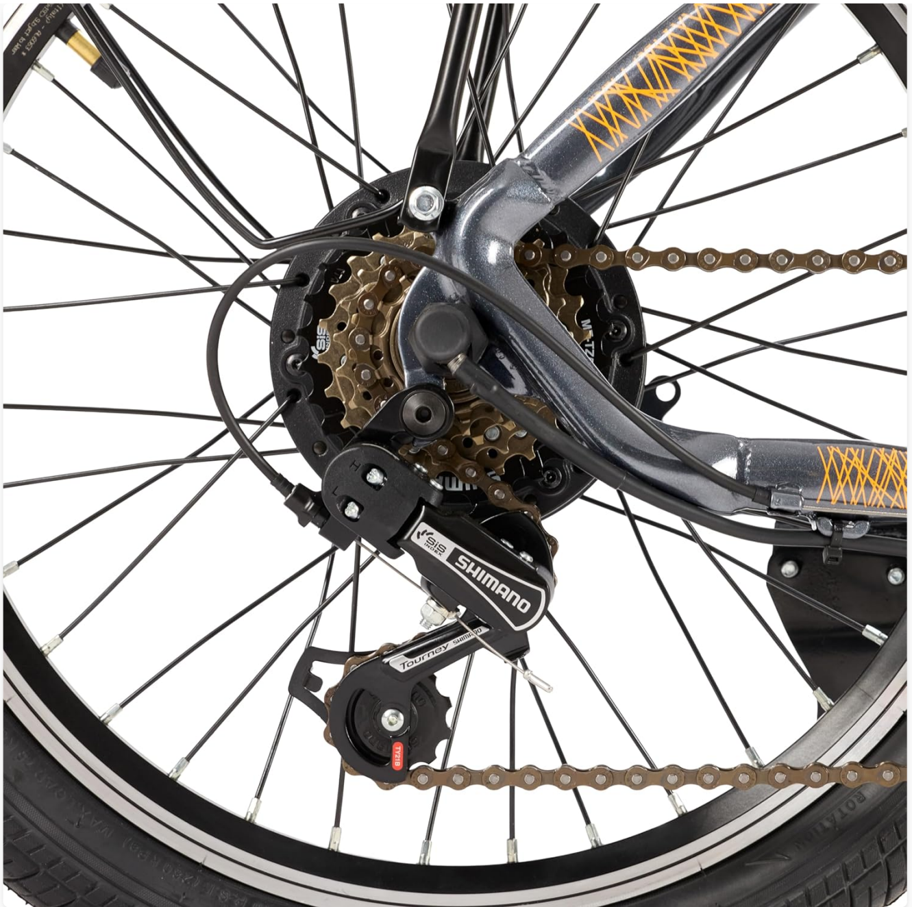
Image: Rear wheel with Shimano derailleur.