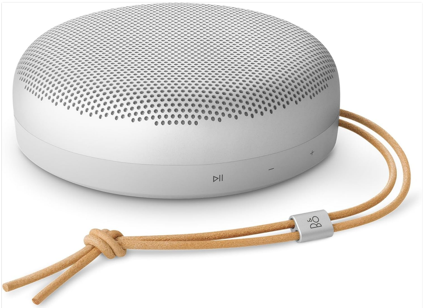
Figure 1: The Beosound A1 3rd Gen speaker in Grey Mist.

The Beosound A1 3rd Gen features advanced AAC and Qualcomm aptX™ codecs for high-quality audio, Bluetooth 5.1 for stable connectivity, and three built-in microphones for clear calls. Its updated design incorporates recycled aluminum and plastic, and it is Cradle-to-Cradle certified, emphasizing sustainability. The speaker is also IP67 certified, making it fully waterproof and dust-resistant.