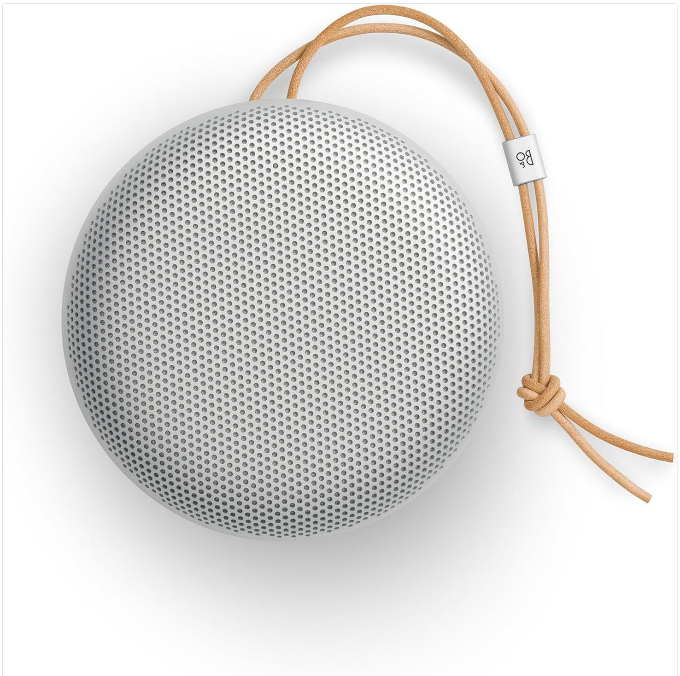
Figure 3: Control buttons on the side of the Beosound A1 3rd Gen.