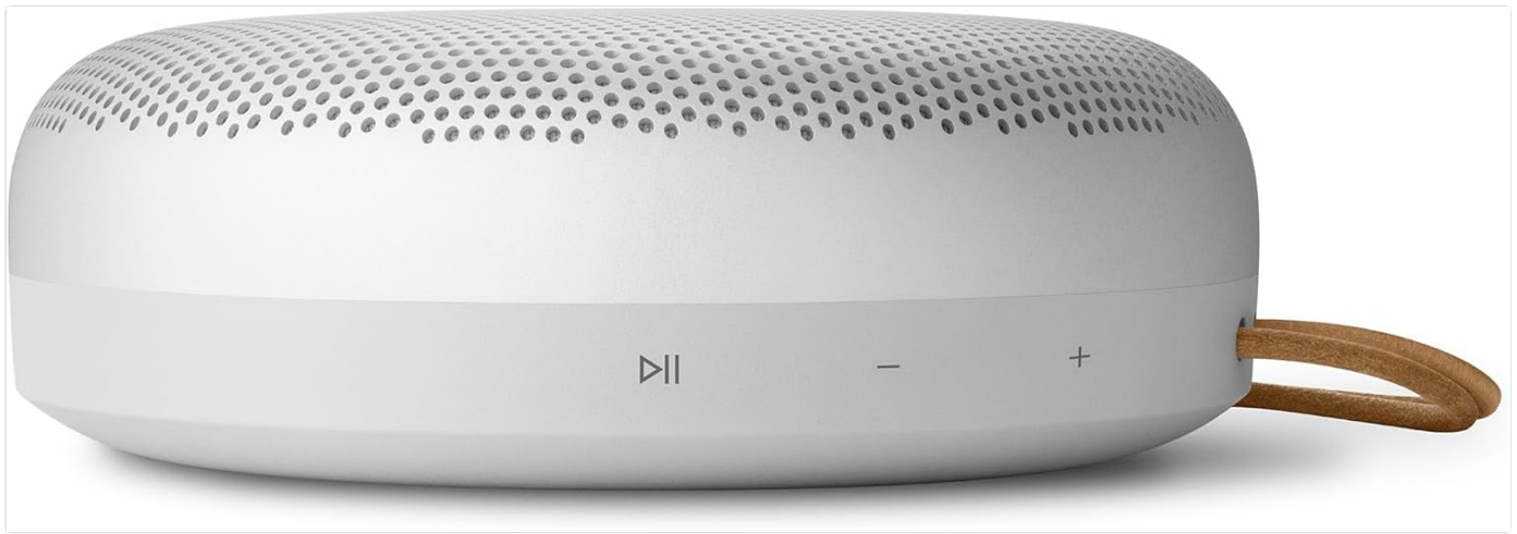
Figure 2: USB-C charging port on the Beosound A1 3rd Gen.