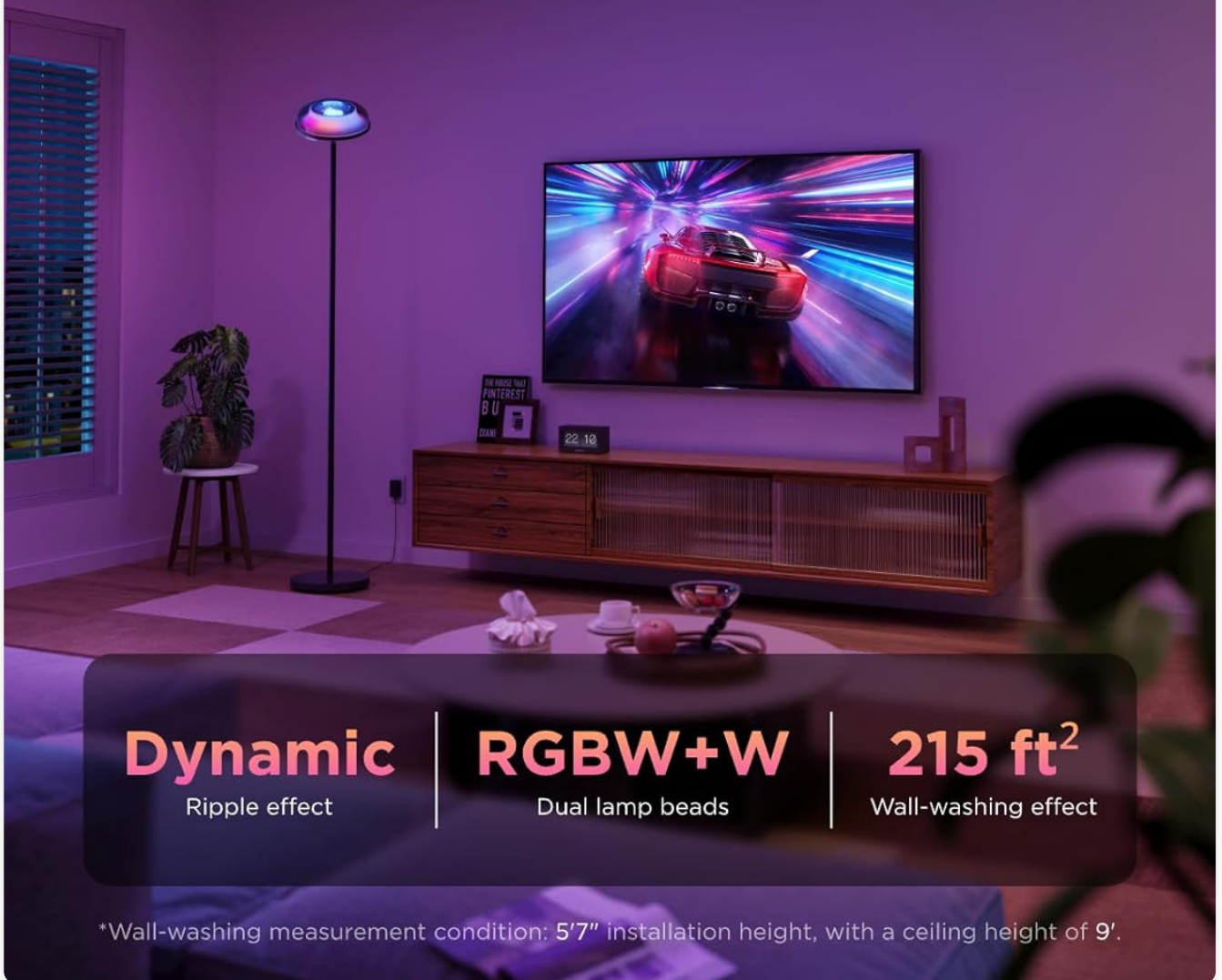
Image: The lamp projecting a dynamic ripple effect across a ceiling, demonstrating its wide coverage.