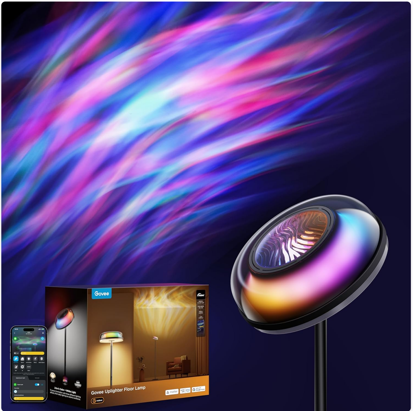
Image: Govee Uplighter Floor Lamp showcasing its RGBIC ripple projection and control via the Govee Home App on a smartphone.