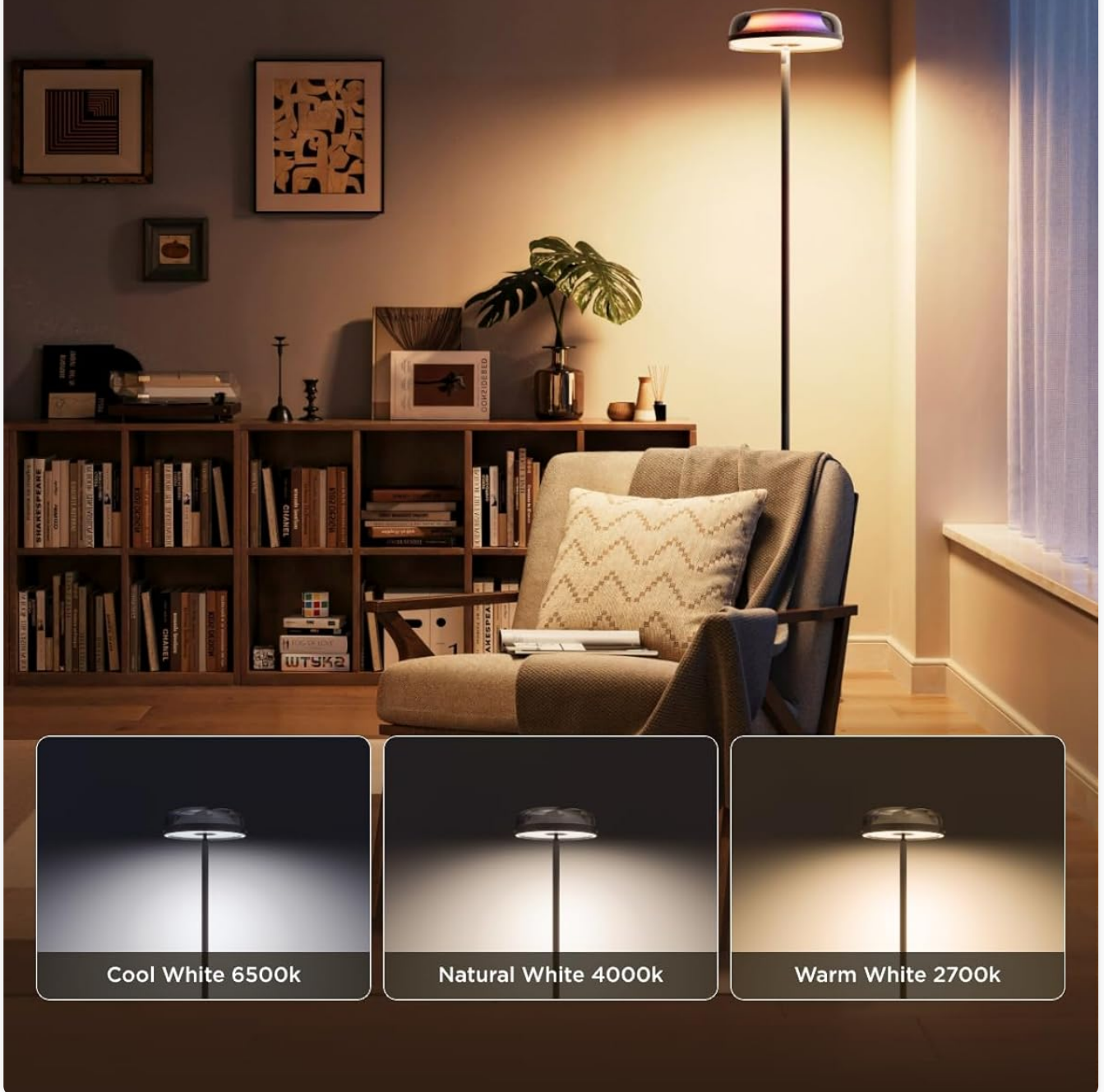
Image: Examples of the lamp's warm to cool white light settings.