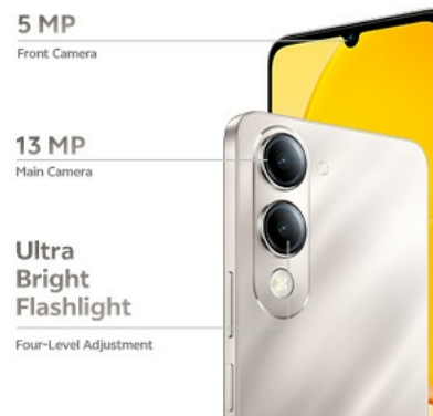
Diagram showing the 5 MP front camera, 13 MP main camera, and Ultra Bright Flashlight with four-level adjustment.