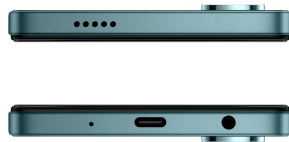
Top and bottom views of the VIVO Y19 5G, illustrating the USB-C port, speaker grille, and SIM tray.