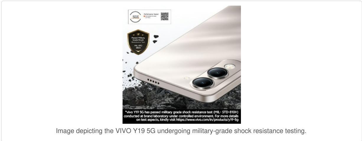
Image depicting the VIVO Y19 5G undergoing military-grade shock resistance testing.