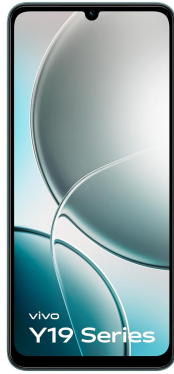
Front view of the VIVO Y19 5G, highlighting the display and front camera.