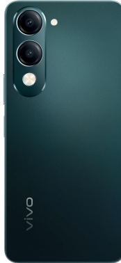
Rear view of the VIVO Y19 5G, showing the main camera setup and VIVO branding.