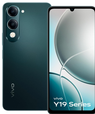
Front and back view of the VIVO Y19 5G smartphone, showcasing its sleek design and camera module.