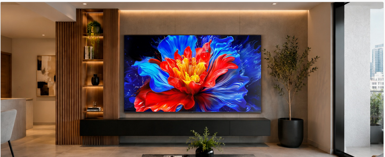
Image 1.1: The TCL 98Q7K QLED 4K Google TV integrated into a living room environment.

This manual provides essential information for setting up, operating, and maintaining your TCL 98Q7K 98-inch QLED 4K Google TV. This television features a stunning QLED 4K display with a 144 Hz panel for smooth motion, integrated Google TV for smart functionality, and advanced audio with Dolby Atmos. It also includes Google Assistant and Alexa compatibility for hands-free voice control, VisionHDR10+, and AiPQ™ processing for optimized picture quality.