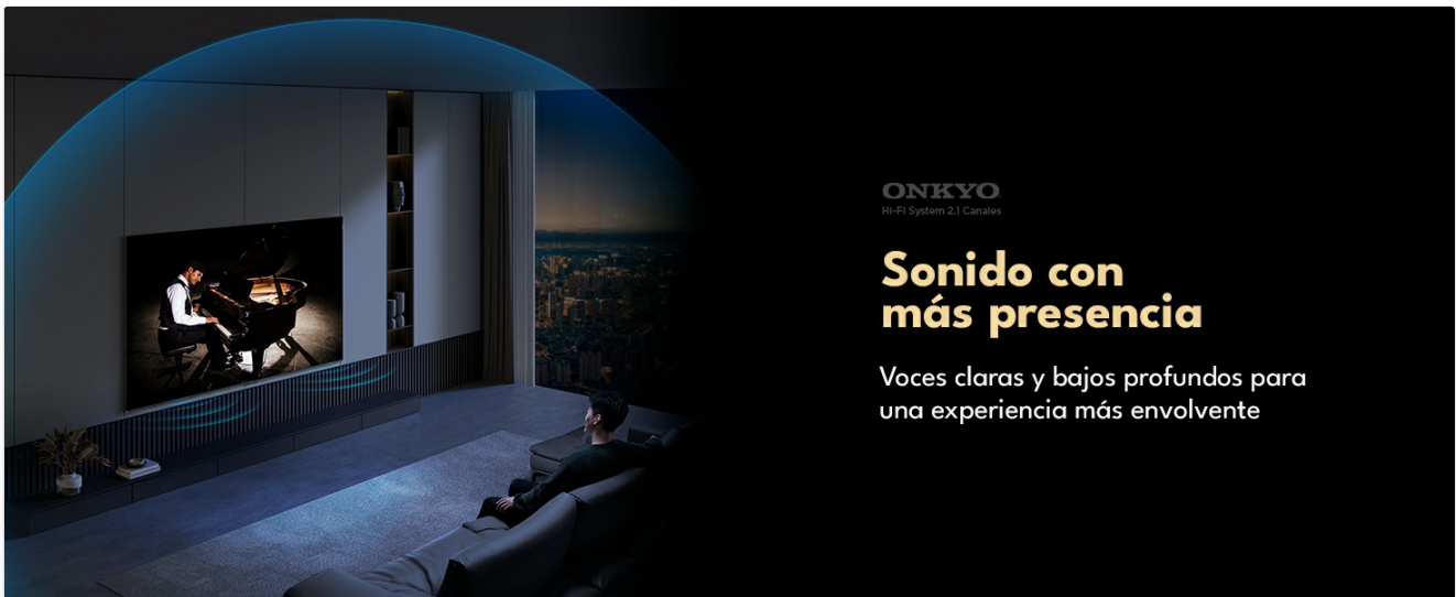
Image 3.3: Visual representation of the ONKYO Hi-Fi System 2.1 Channels, indicating clear and powerful audio output.