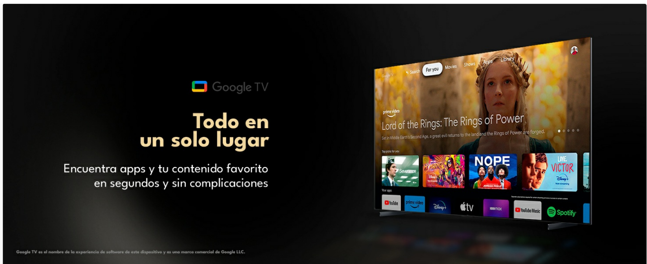
Image 3.1: The Google TV interface, showing various streaming applications and content recommendations.