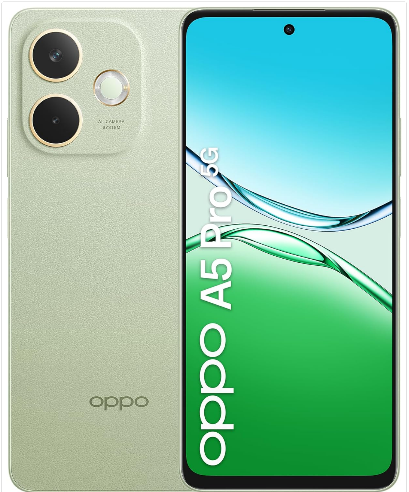
Figure 1: Front and back view of the Oppo A5 Pro smartphone in Olive Green.