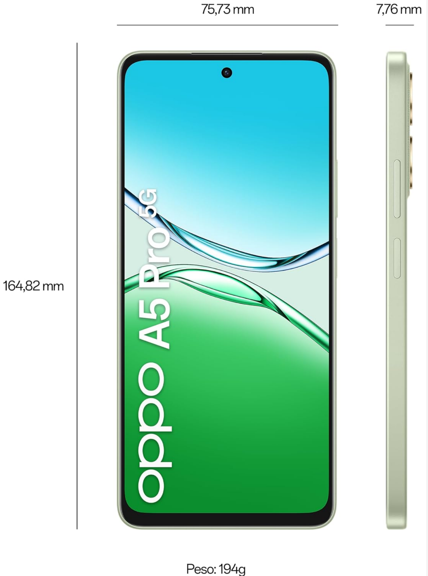
Figure 3: Physical dimensions of the Oppo A5 Pro: 164.82 mm height, 75.73 mm width, and 7.76 mm thickness. The device weighs 194 grams.