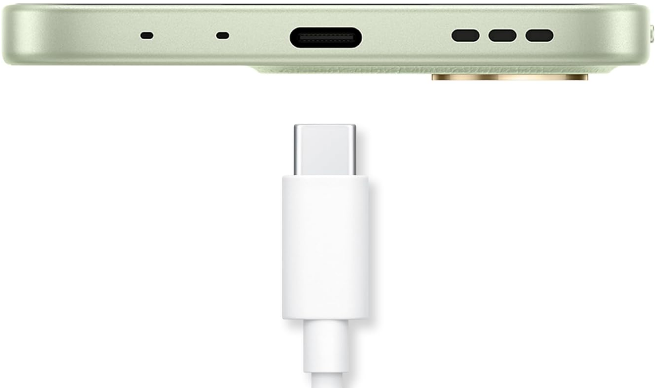
Figure 6: The device supports 45W SUPERVOOC™ fast charging technology.