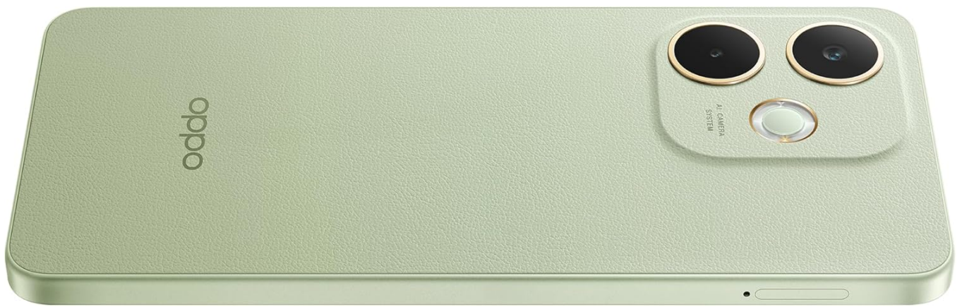
Figure 5: The Oppo A5 Pro features a 5800mAh long-lasting battery.