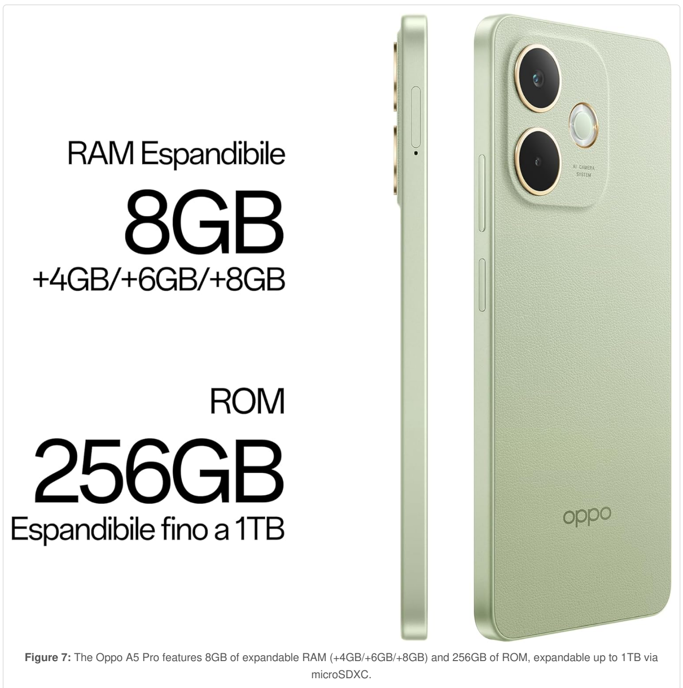
Figure 7: The Oppo A5 Pro features 8GB of expandable RAM (+4GB/+6GB/+8GB) and 256GB of ROM, expandable up to 1TB via microSDXC.