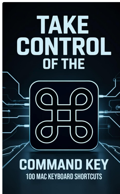
Front Cover: Displays the book's title and the iconic Command key symbol.