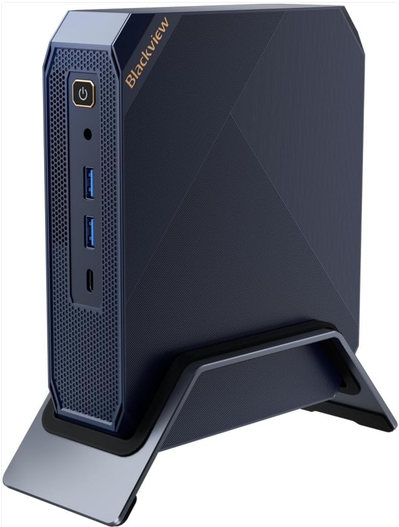
Image: Blackview MP200 Mini PC with its power adapter, HDMI cable, and VESA mount.