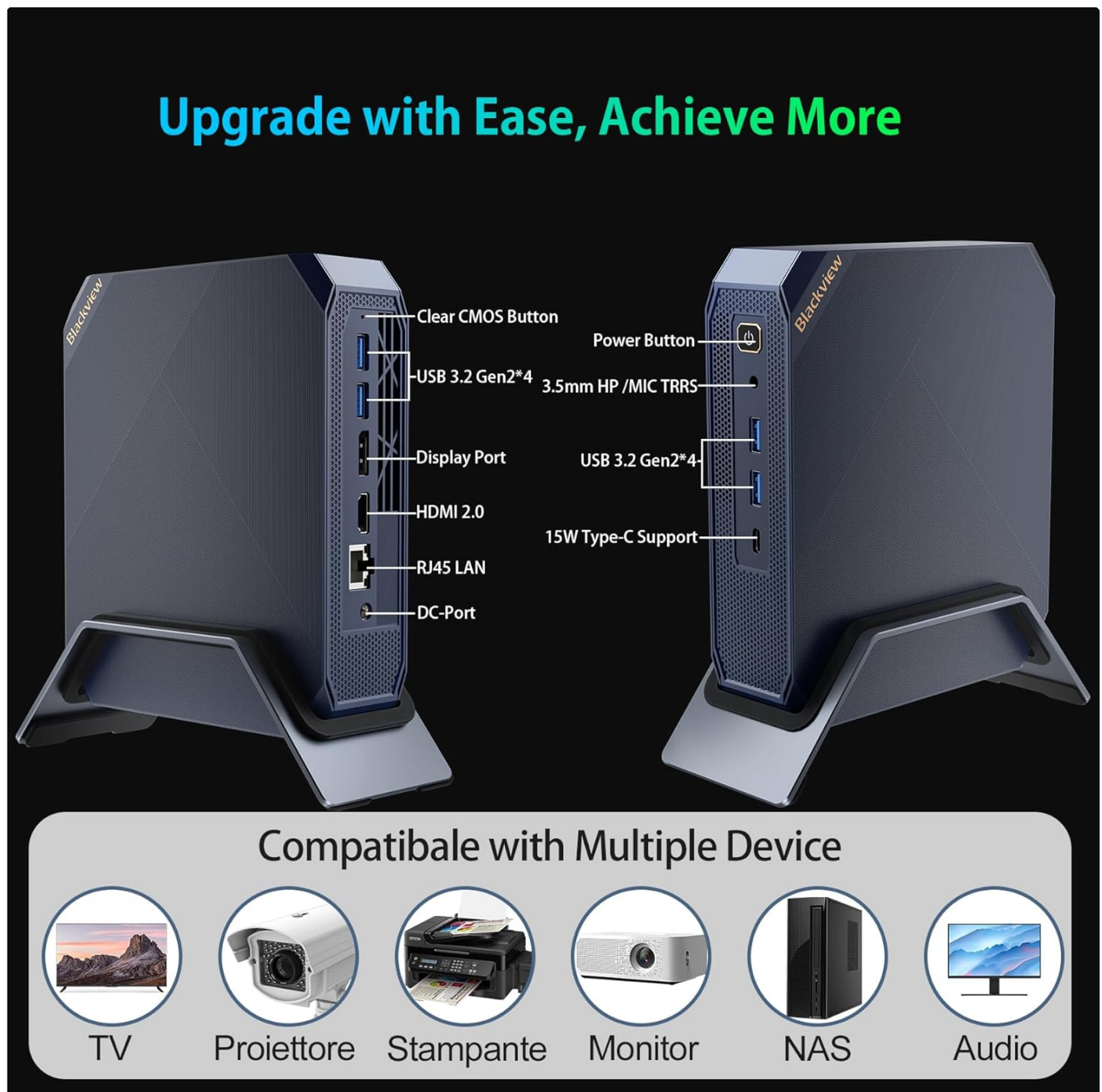
Image: Detailed view of the Blackview MP200 Mini PC's front and rear ports, including USB, HDMI, DisplayPort, Ethernet, and audio jacks.