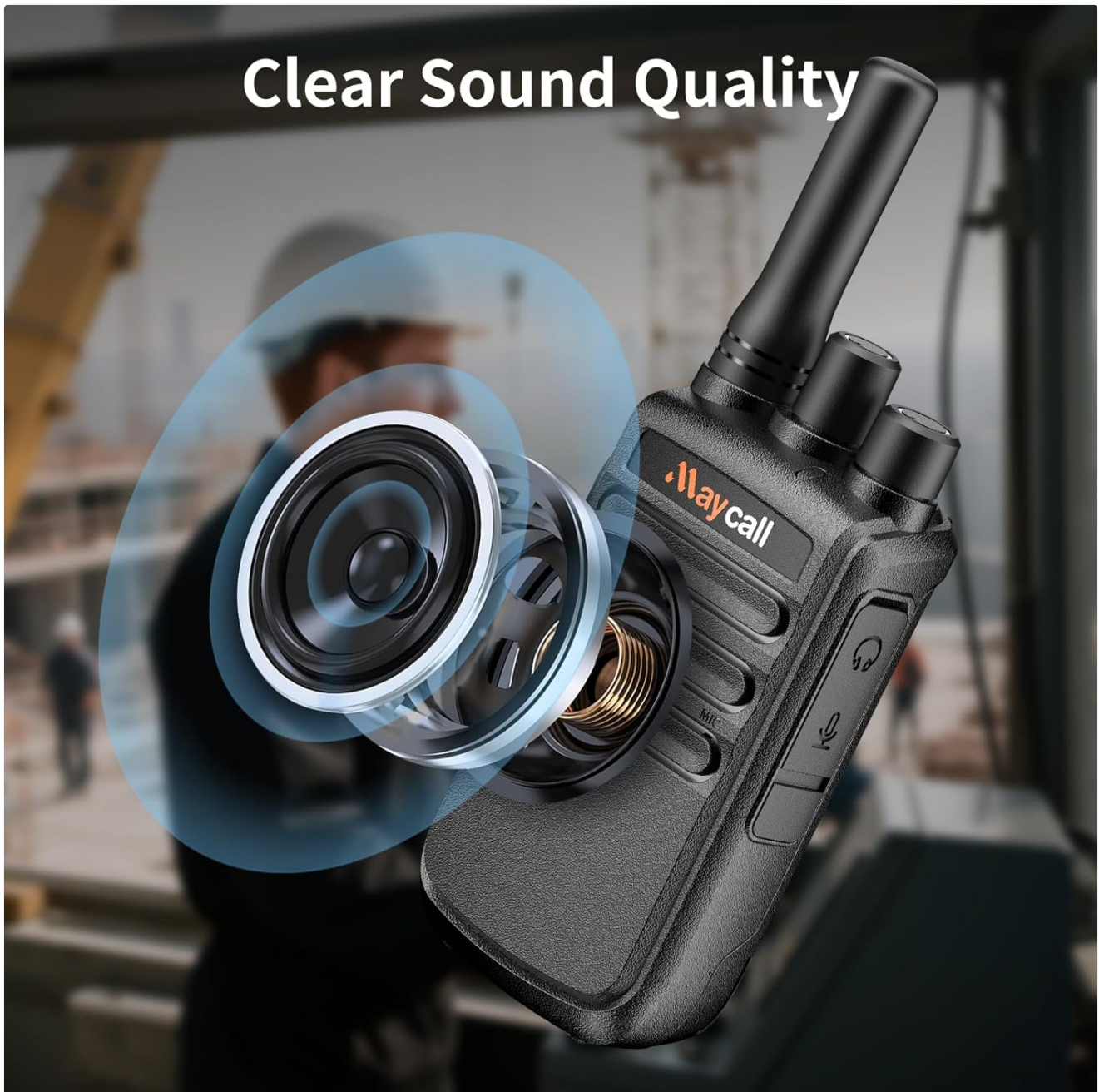
Figure 7: Diagram showing the speaker technology for clear sound output.

Equipped with a titanium-coated diaphragm transparent speaker, the MC-558 delivers high-density, lightweight, and excellent resolution sound, accurately restoring audio details for clear communication.