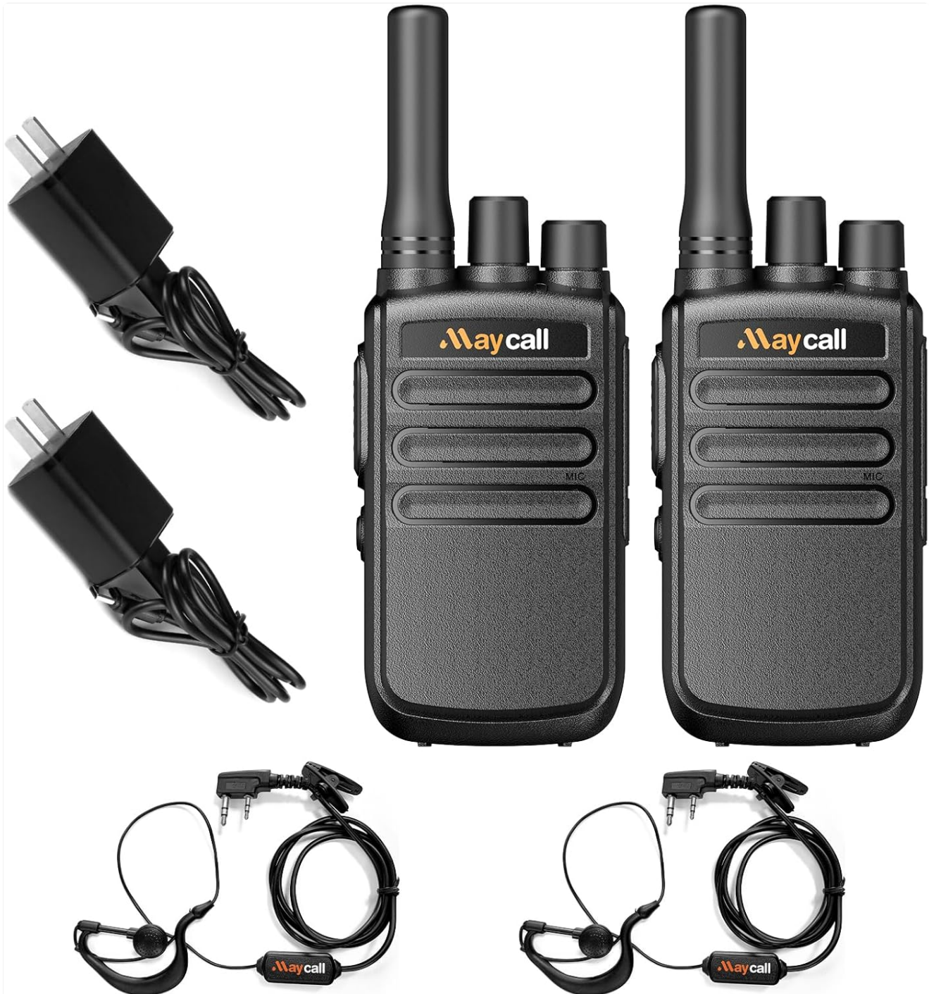
Figure 2: Contents of the Maycall MC-558 package, including two walkie-talkies, batteries, chargers, and earpieces.