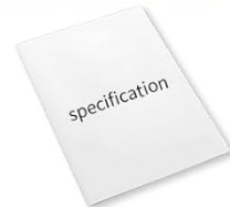
Instruction Manual *1