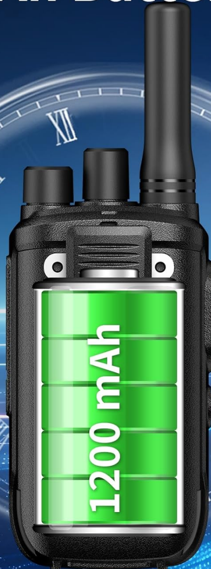
Figure 4: Details on the 1200 mAh battery capacity, charging time, and operational duration.