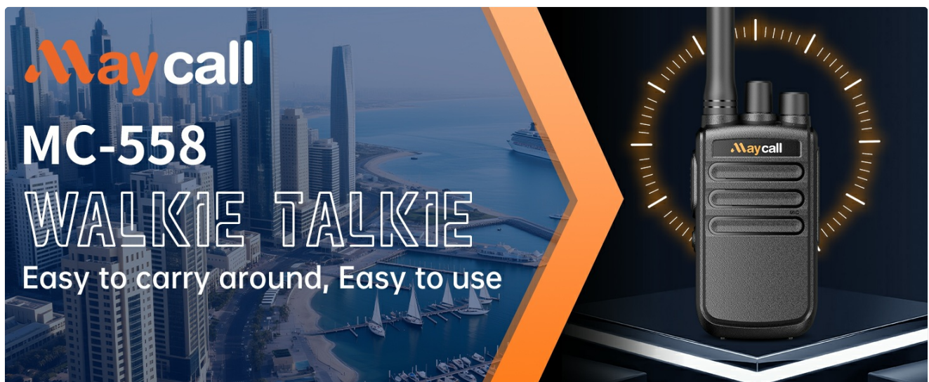
Figure 1: Maycall MC-558 Walkie Talkie: Portable and User-Friendly Design.

The Maycall MC-558 is a portable FRS two-way radio designed for reliable communication across various environments. Featuring 16 preset channels and a robust 1200 mAh rechargeable battery, it offers extended operating time and clear sound quality. This manual provides detailed instructions for setting up, operating, and maintaining your MC-558 walkie-talkies to ensure optimal performance.