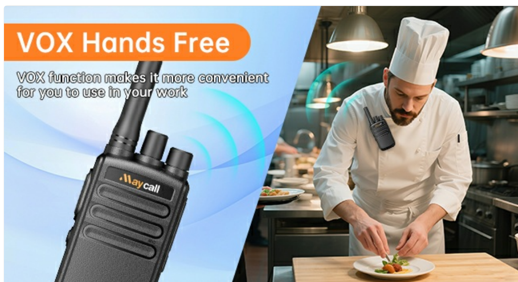
Figure 12: Illustration of the VOX hands-free feature in use.

The VOX function allows for hands-free operation, transmitting your voice automatically when you speak, without needing to press the PTT button. Refer to the detailed user manual (included in the box) for instructions on how to activate and adjust VOX sensitivity.