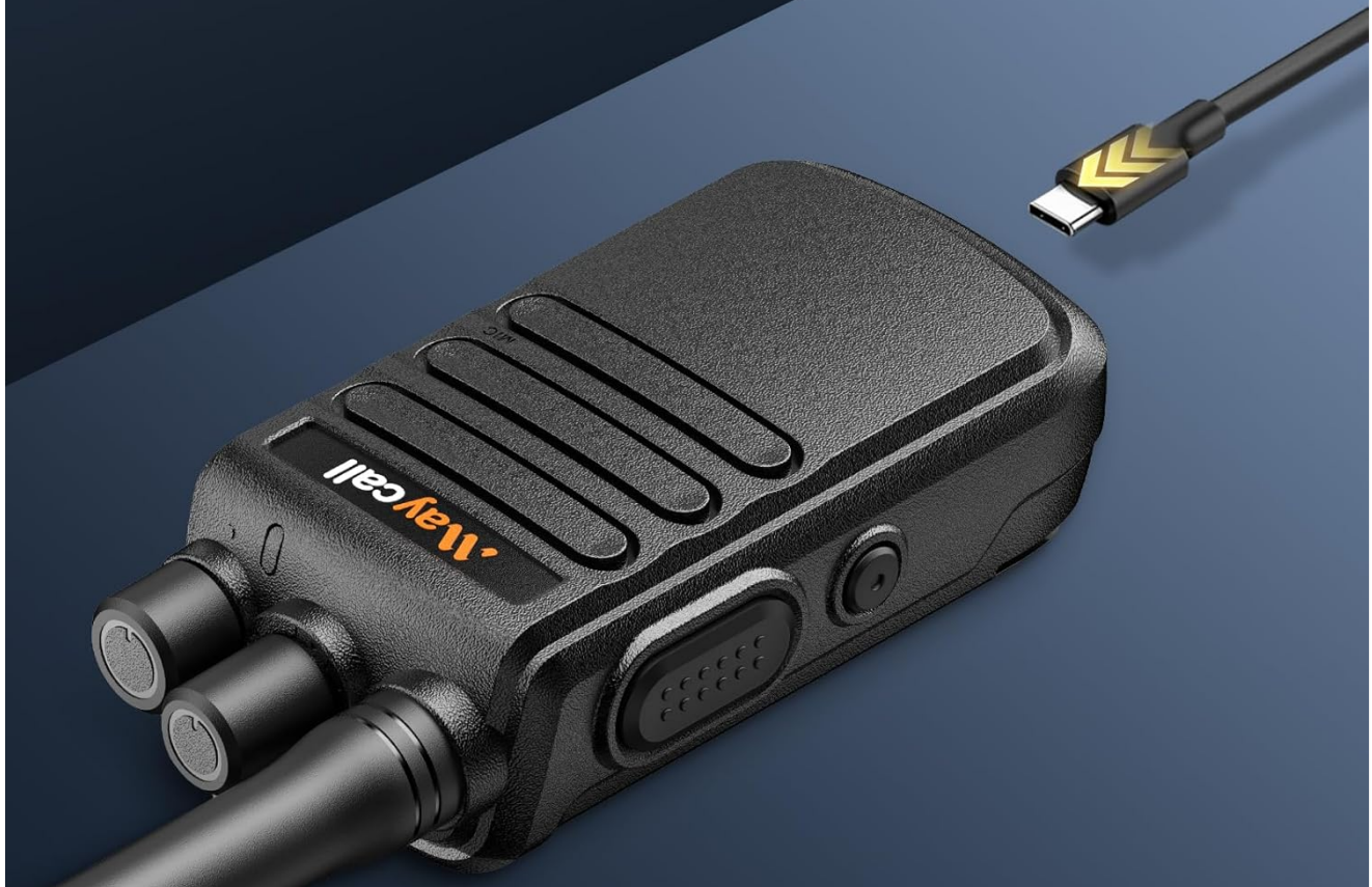
Figure 5: The versatile Type-C charging port allows charging from various sources like computers, car chargers, and power banks.