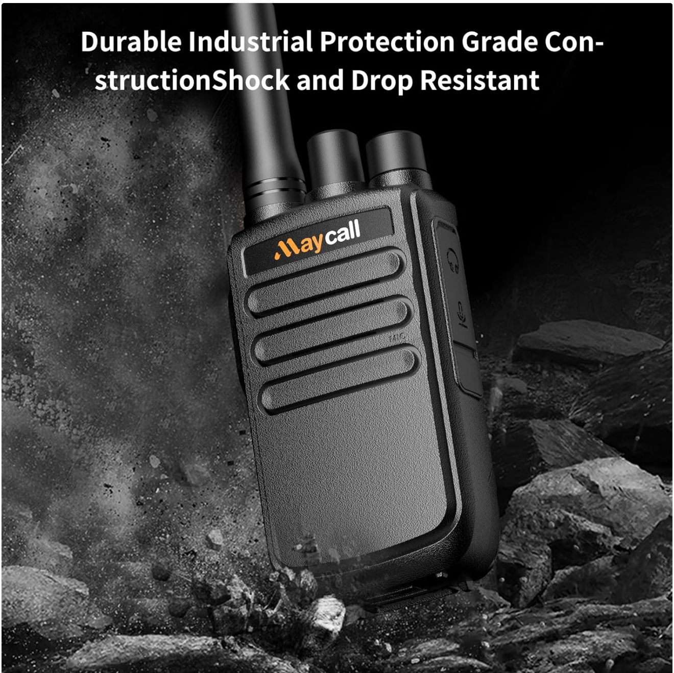
Figure 8: The MC-558 is built to withstand drops and impacts, ensuring longevity.