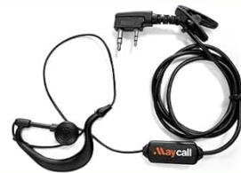
Walkie Talkie Earpiece *2