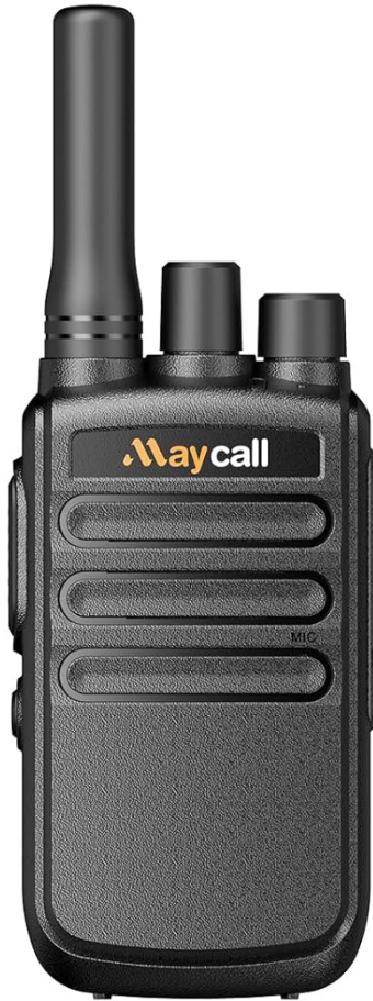
MC-558 Walkie Talkies *2