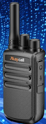
Figure 10: Further illustrations of suitable usage scenarios for the MC-558.