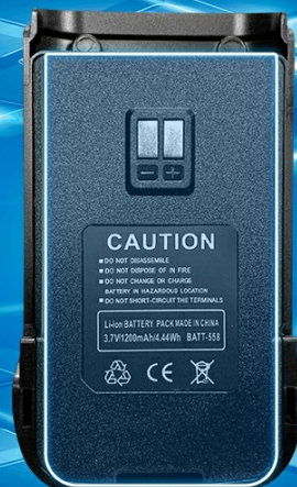
Figure 6: Visual representation of the integrated 1200mAh Li-ion battery and its benefits.