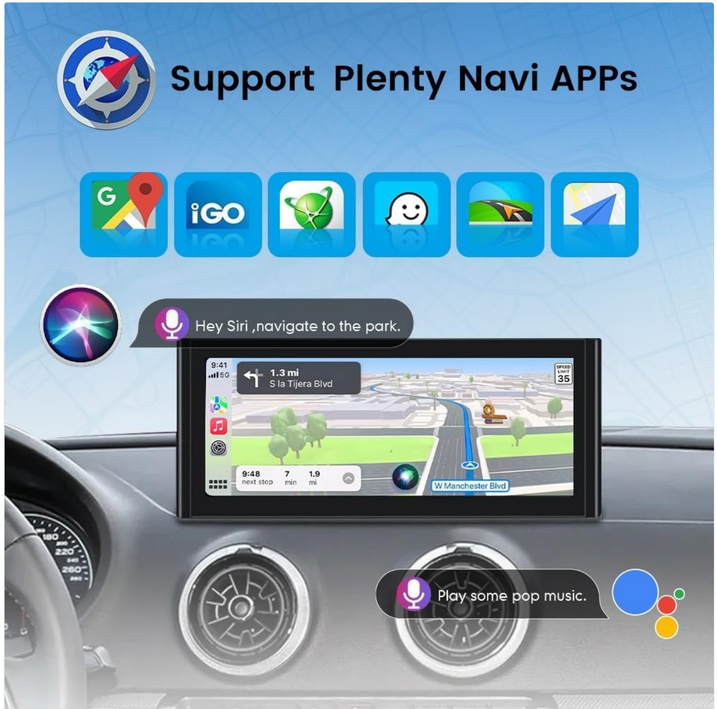
Image 5.1: The car stereo screen showing various navigation applications and demonstrating voice command interaction for navigation and music playback.

The unit supports various navigation applications. Once connected to Wi-Fi, you can download and use your preferred navigation apps from the app store. The integrated GPS antenna ensures accurate positioning.