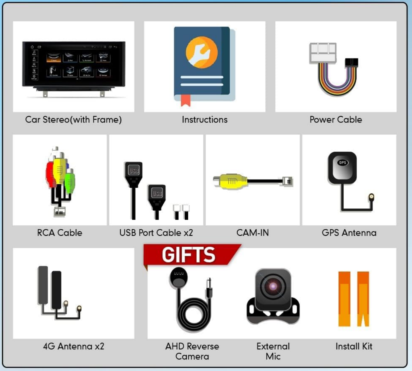
Image 2.1: Visual representation of all items included in the product package, such as the head unit, cables, antennas, and accessories.