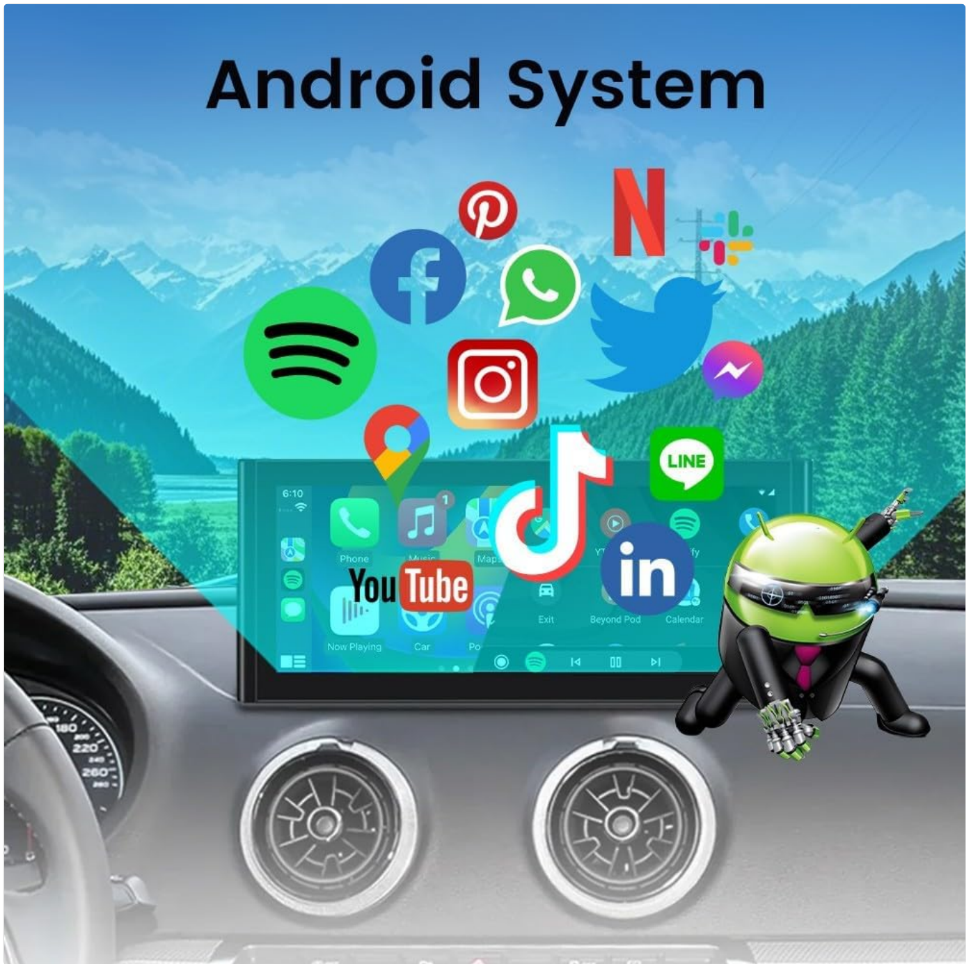
Image 6.1: The car stereo screen showcasing a variety of popular Android applications, highlighting the system's versatility.