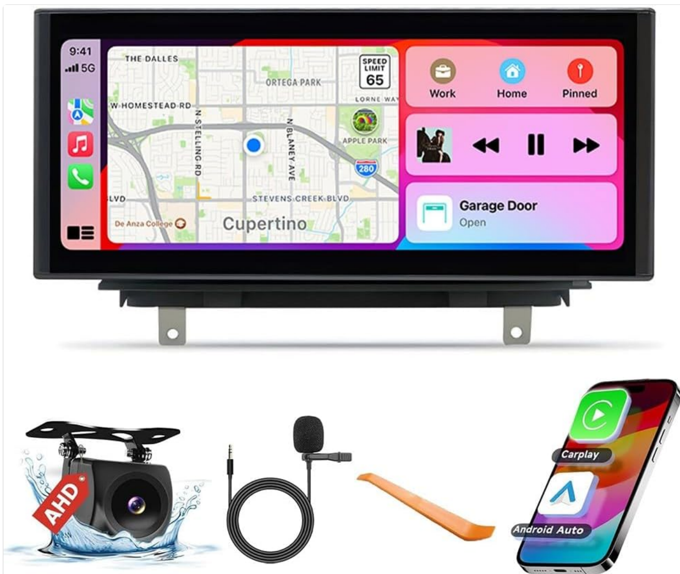
Image 1.1: KUNFINE 10.25-inch Android Car Stereo displaying the CarPlay interface, along with included accessories like a reverse camera, microphone, and installation tool.