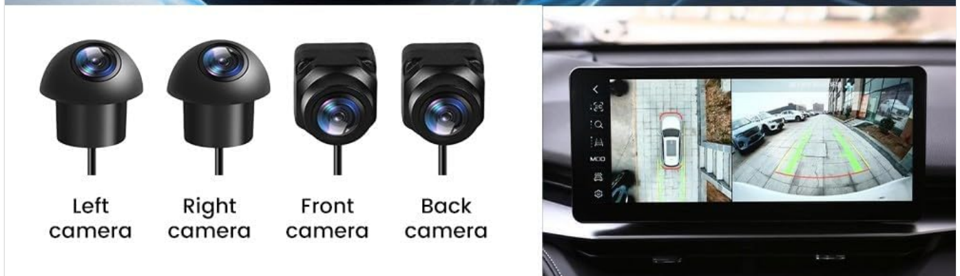
Image 5.3: Illustration of an optional 360-degree rear view camera system, showing various camera perspectives (front, back, left, right) and how they are displayed on the car stereo screen.