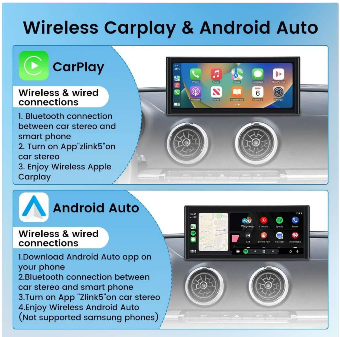
Image 4.1: Step-by-step guide for establishing wireless CarPlay and Android Auto connections with the head unit.