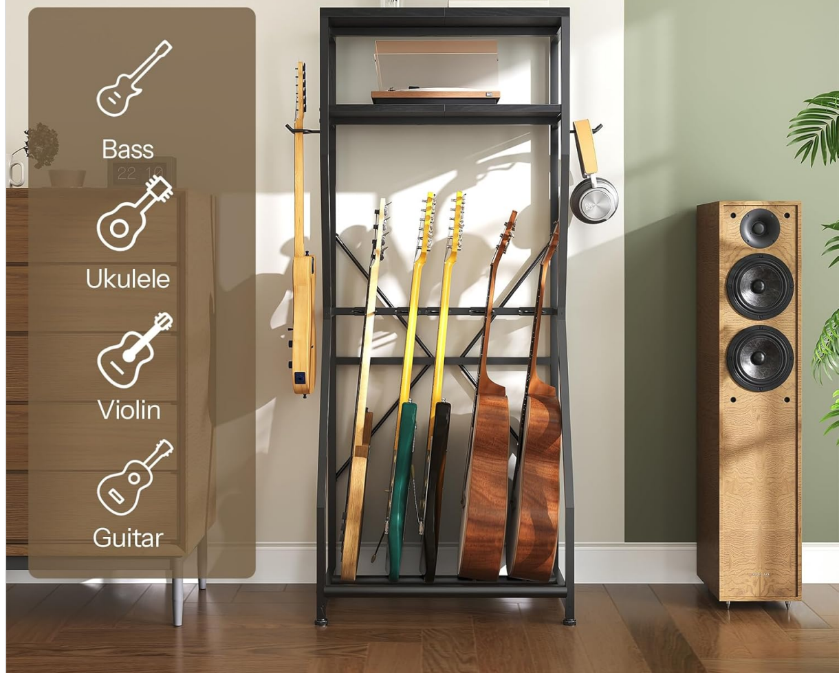
Image 5.3: Illustration of the stand's compatibility with different instrument types, including bass, ukulele, violin, and guitar.