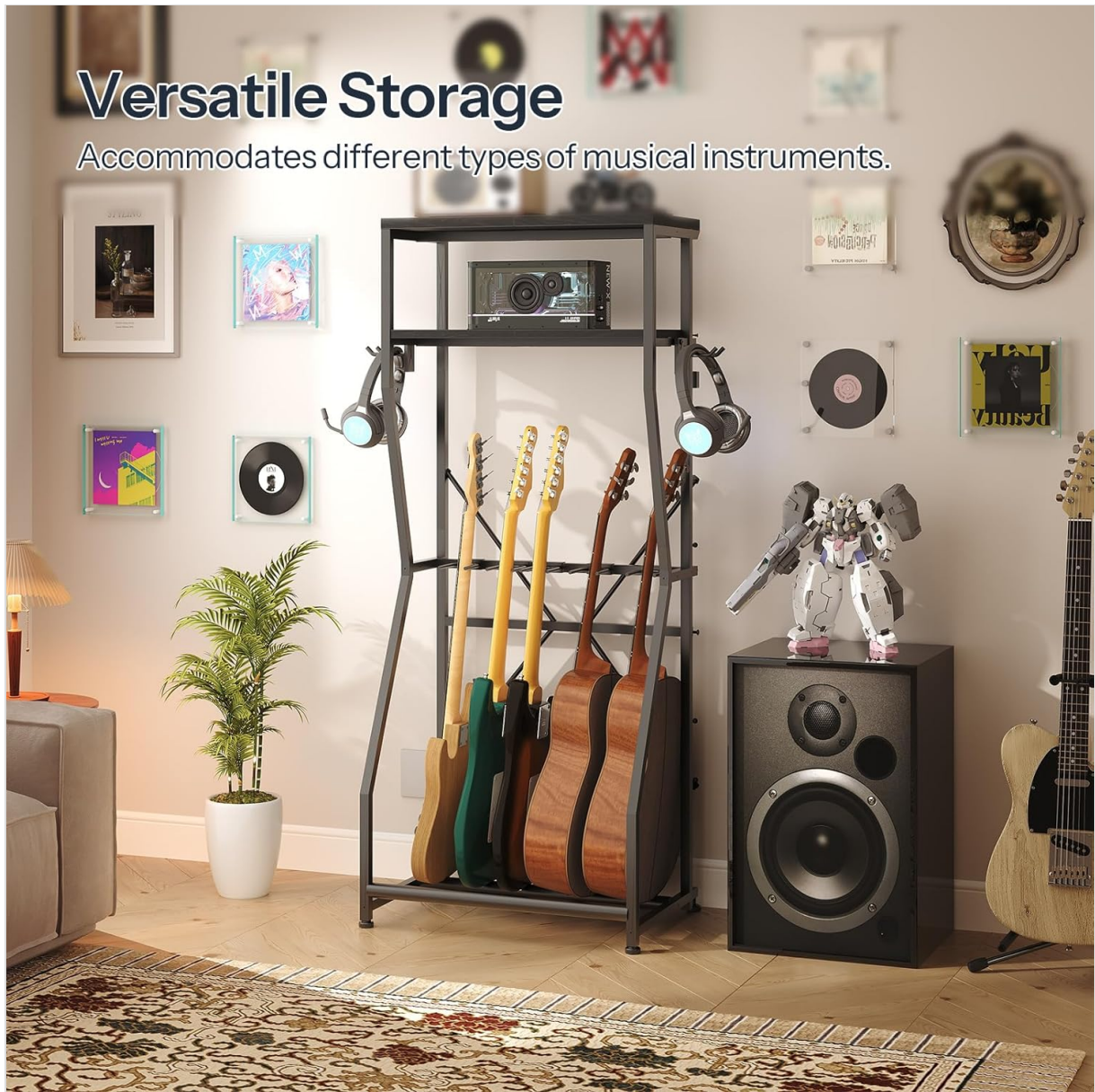
Image 5.2: The stand configured with multiple instruments and accessories on its shelves, demonstrating versatile storage.

Accommodates different types of musical instruments.