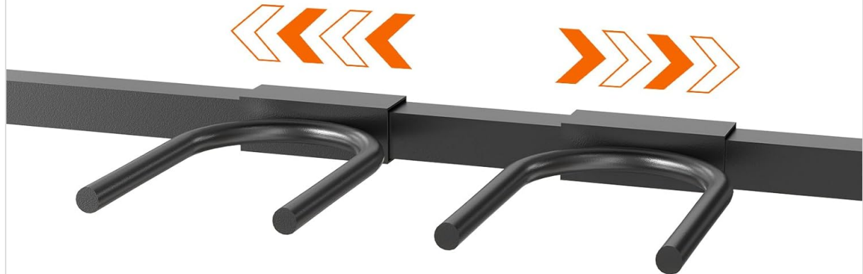
Image 5.1: The adjustable guitar holders can be moved to fit different instrument sizes.