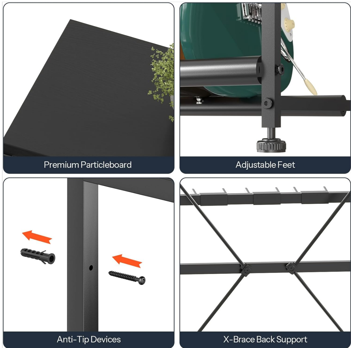
Image 4.2: Detailed view of key assembly components: premium particleboard shelves, adjustable feet for leveling, anti-tip devices for wall mounting, and the X-brace back support for structural integrity.