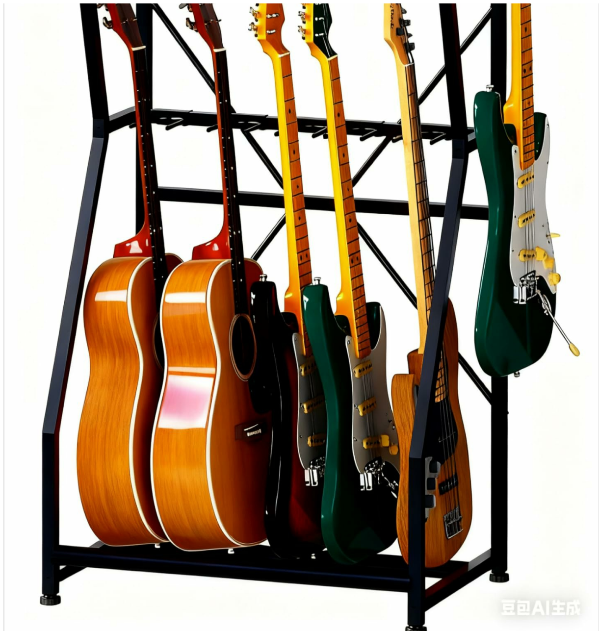
Image 1.1: The HOOBRO Multiple Guitar Rack Holder, showcasing its capacity for several guitars and two storage shelves.