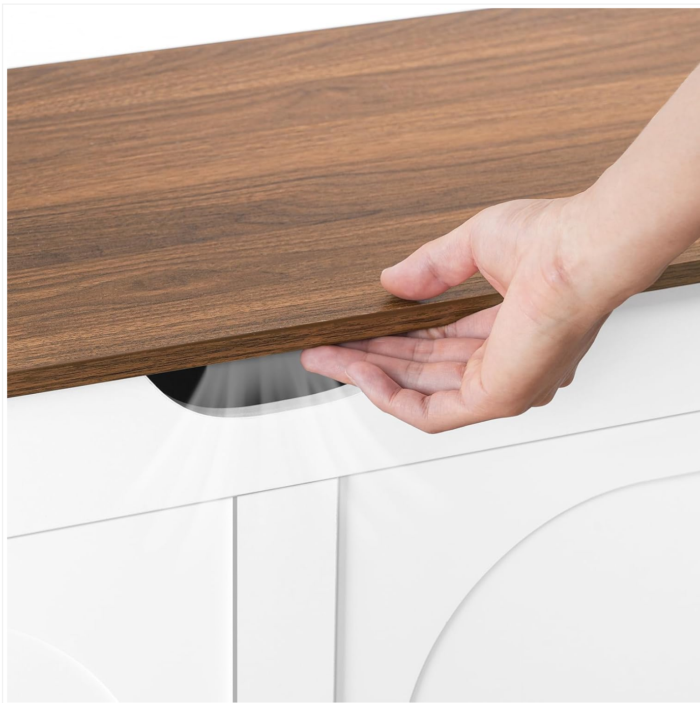
Figure 4: The ergonomic cut-out handle allows for easy and safe opening of the lid.