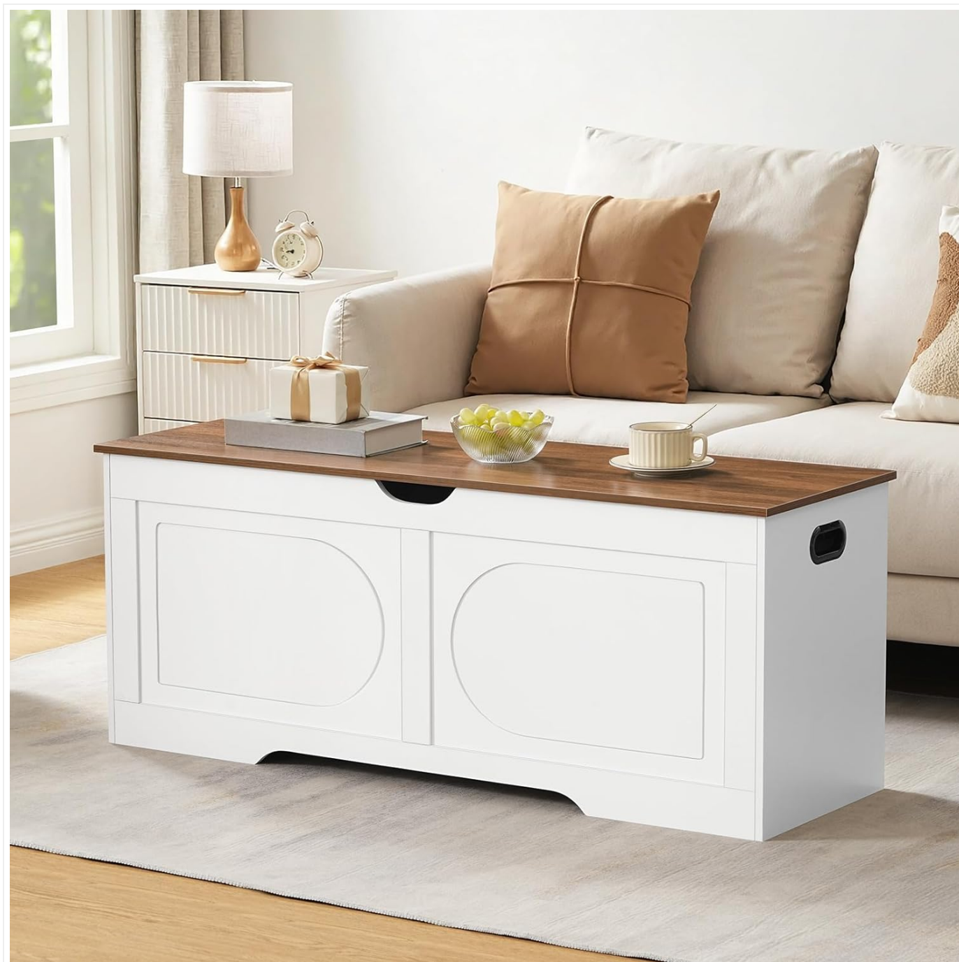
Figure 6: The storage chest functioning as a stylish and practical bench in a living room environment.