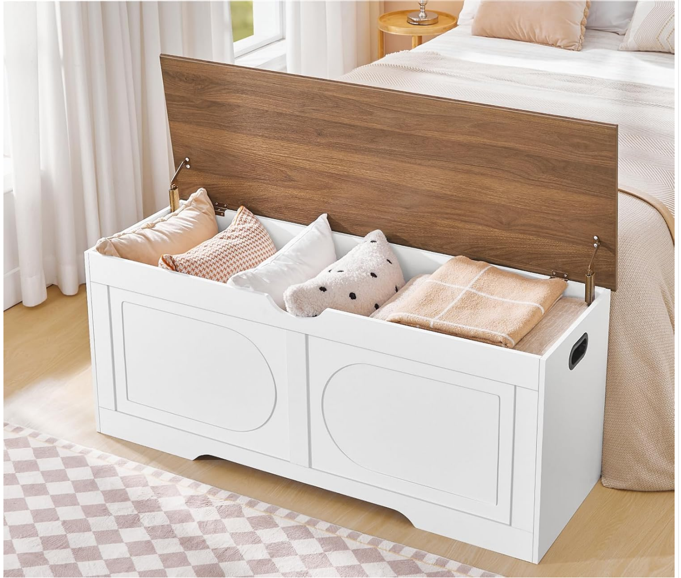
Figure 5: The spacious interior of the chest, capable of holding various items to help maintain an organized space.

Concealed storage maintains tidy spaces.