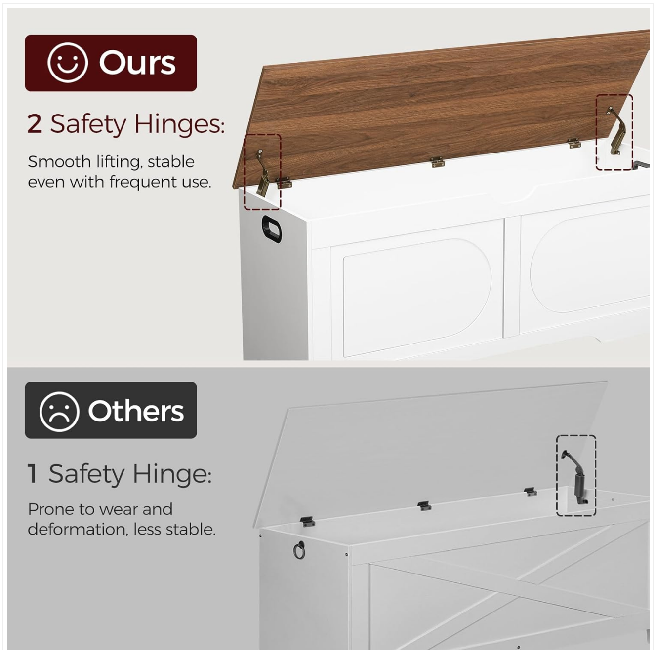
Figure 2: Detail of the dual safety hinges, designed for smooth and safe lid operation.