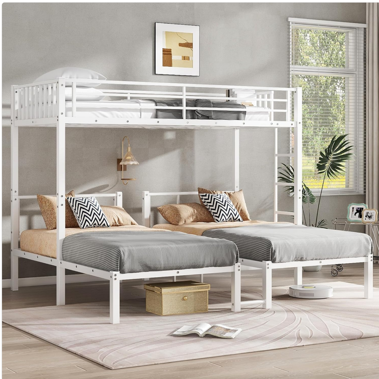
Image: The Triple Bunk Bed in its primary configuration, showcasing its space-saving design.

for additional storage of toys, boxes, or other items.