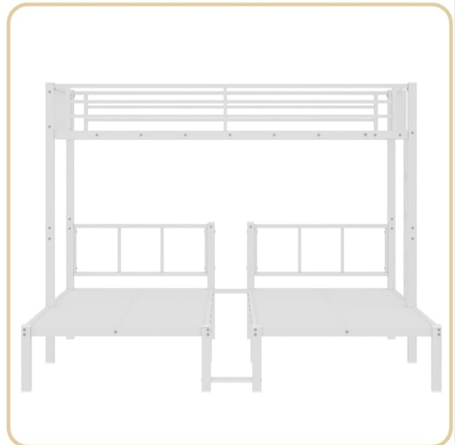
Image: Details of the sturdy construction, including slats and guardrails.

All four sides of the upper bed are equipped with protective guardrails