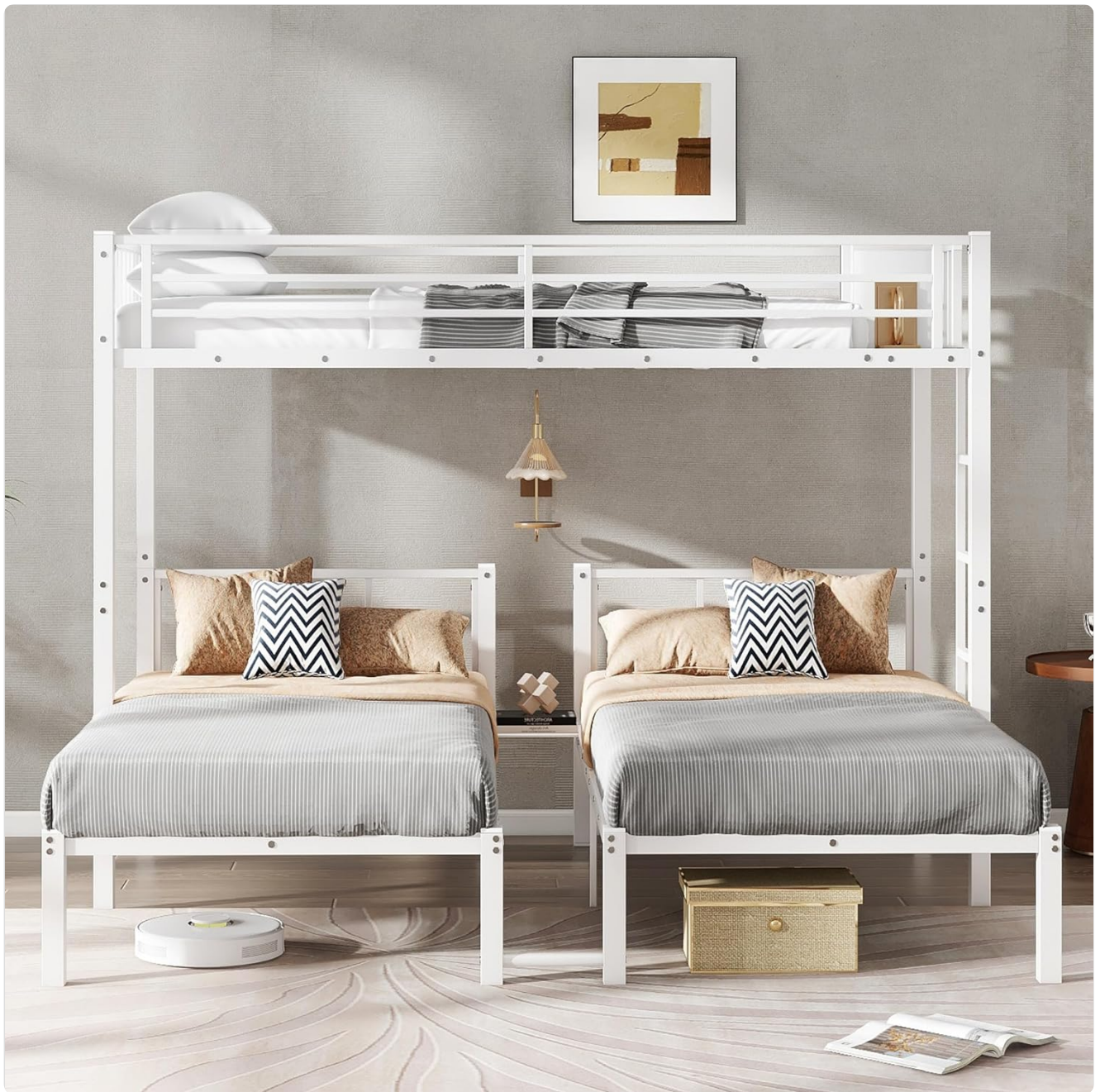
Image: The bunk bed disassembled into three separate beds, illustrating its versatility.