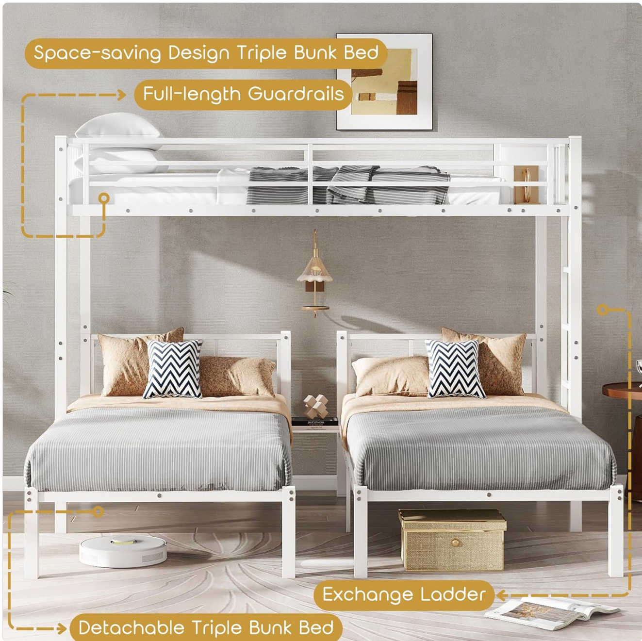
Image: Overview of the Triple Bunk Bed highlighting key features like guardrails and detachable design.