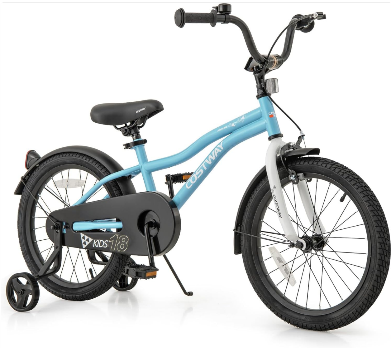
Image 1.1: Overview of the COSTWAY 18 Inch Kids Bicycle in blue, equipped with training wheels and a kickstand.