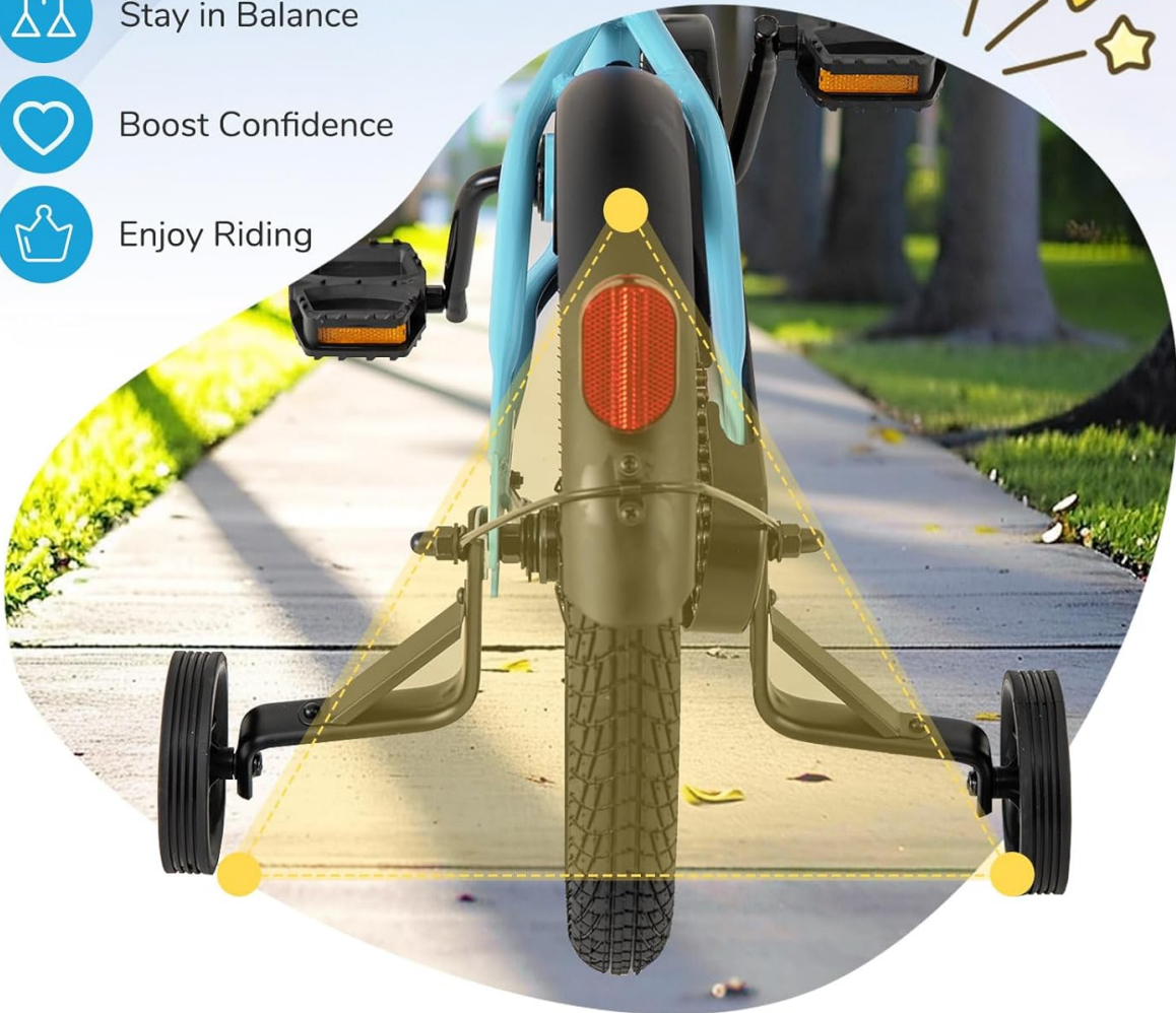
Image 5.3: The stable triangular base provided by training wheels for beginner riders.