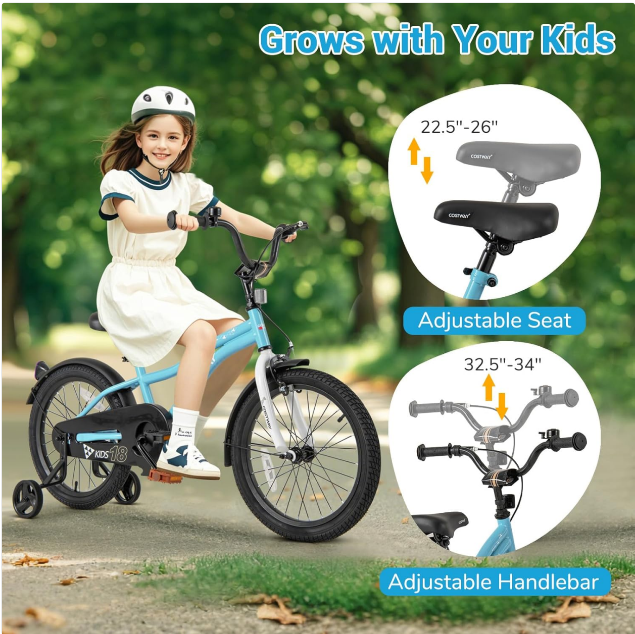
Image 5.1: Illustration of adjustable seat and handlebar heights for the COSTWAY Kids Bicycle.