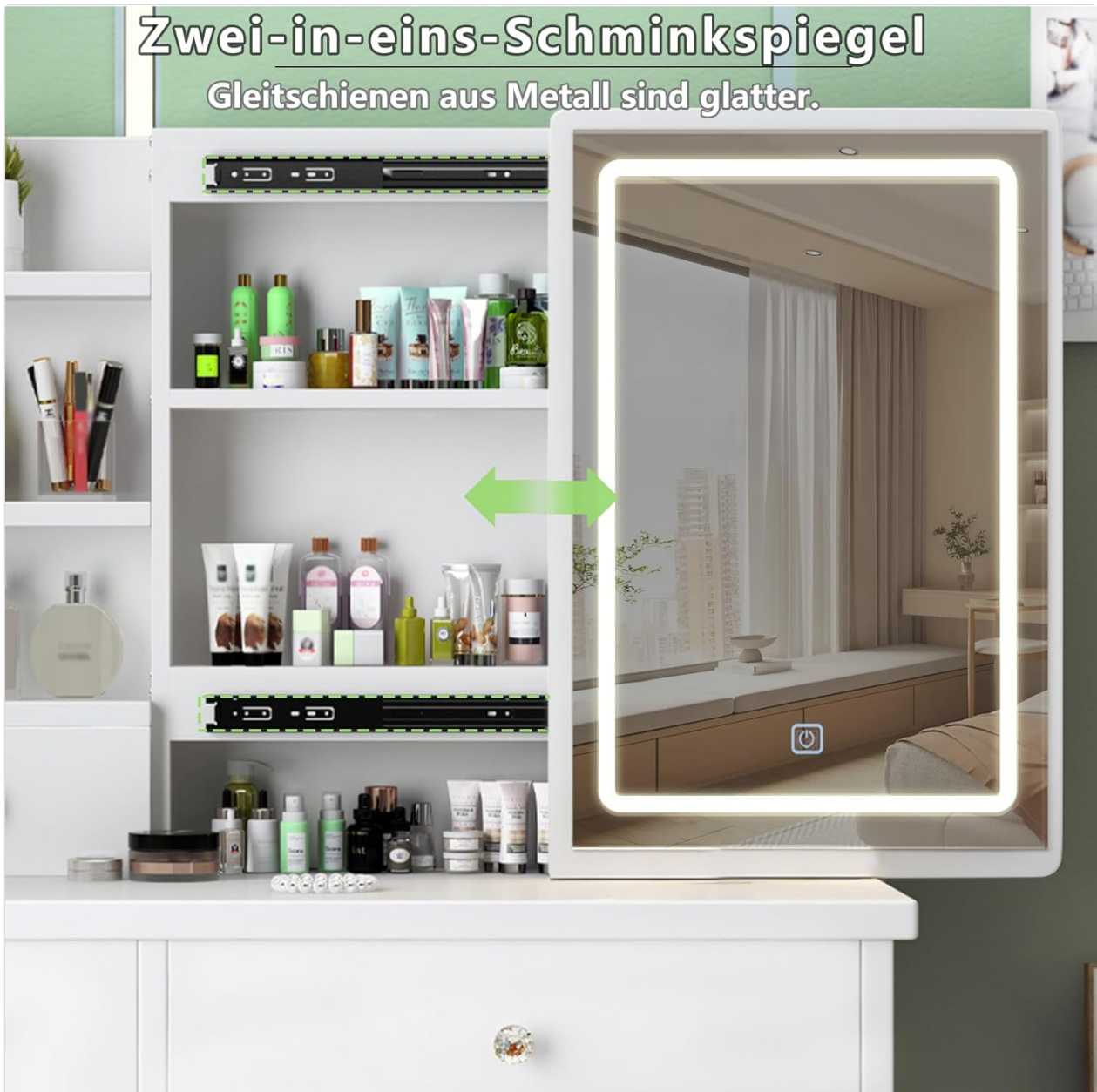
Close-up of the Freeboss T68's two-in-one sliding mirror, revealing hidden storage shelves behind it. The image also indicates smooth metal rails for operation.