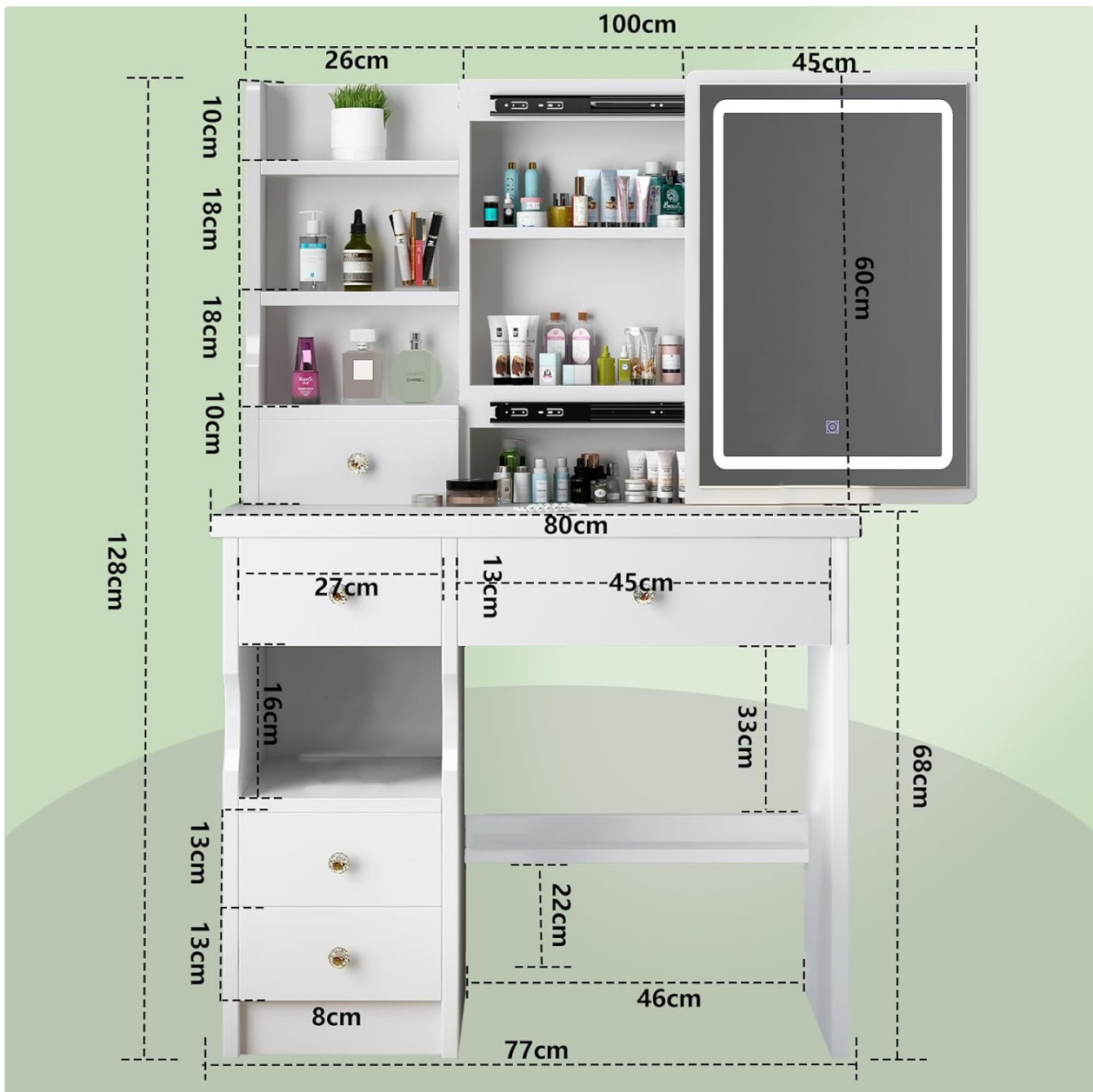
A detailed diagram illustrating the dimensions of the Freeboss T68 dressing table, including height, width, and depth of the main unit, mirror, and storage sections.