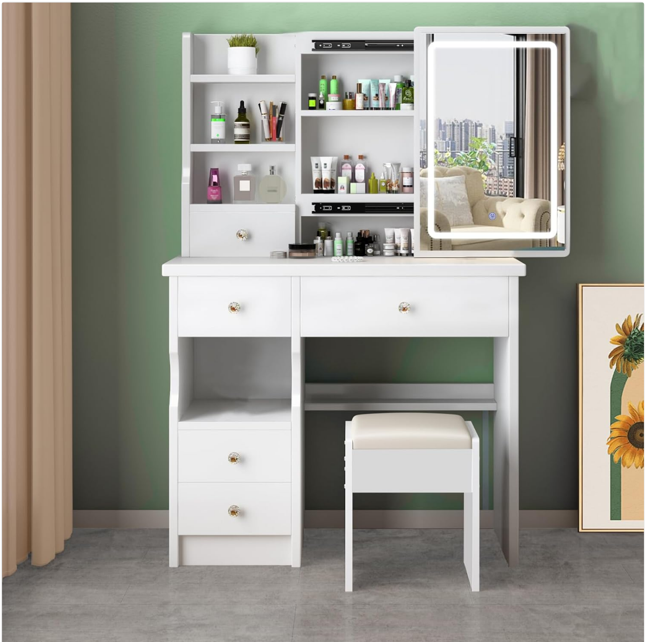
An overview of the Freeboss T68 dressing table, featuring a white finish, integrated LED mirror, multiple storage shelves, drawers, and a matching stool.