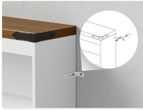
Image: A detailed view showing the anti-tip device being secured to the wall and the top of the storage rack, highlighting a critical safety feature.