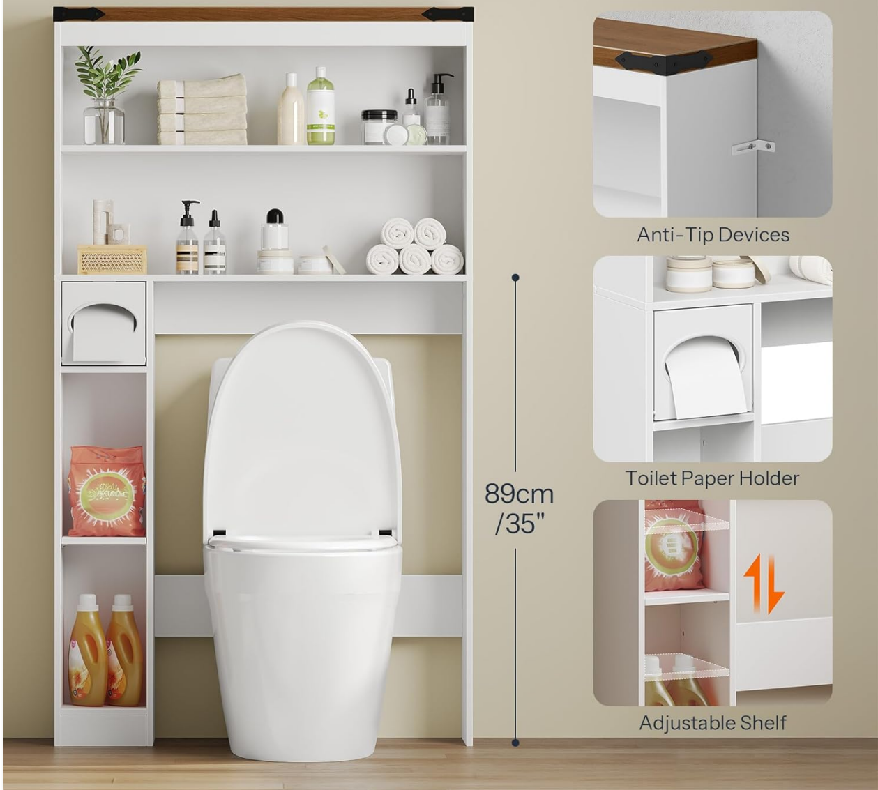
Image: A composite image highlighting the ideal height of the rack over a toilet (89cm/35"), the anti-tip devices, the integrated toilet paper holder, and the adjustable shelf feature.

Ideal Height: Allows the toilet lid to open normally.