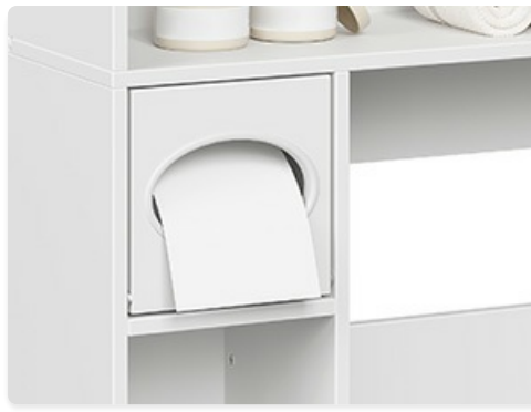
Image: A detailed shot of the built-in toilet paper holder compartment, showing a roll of toilet paper dispensed through the oval opening.