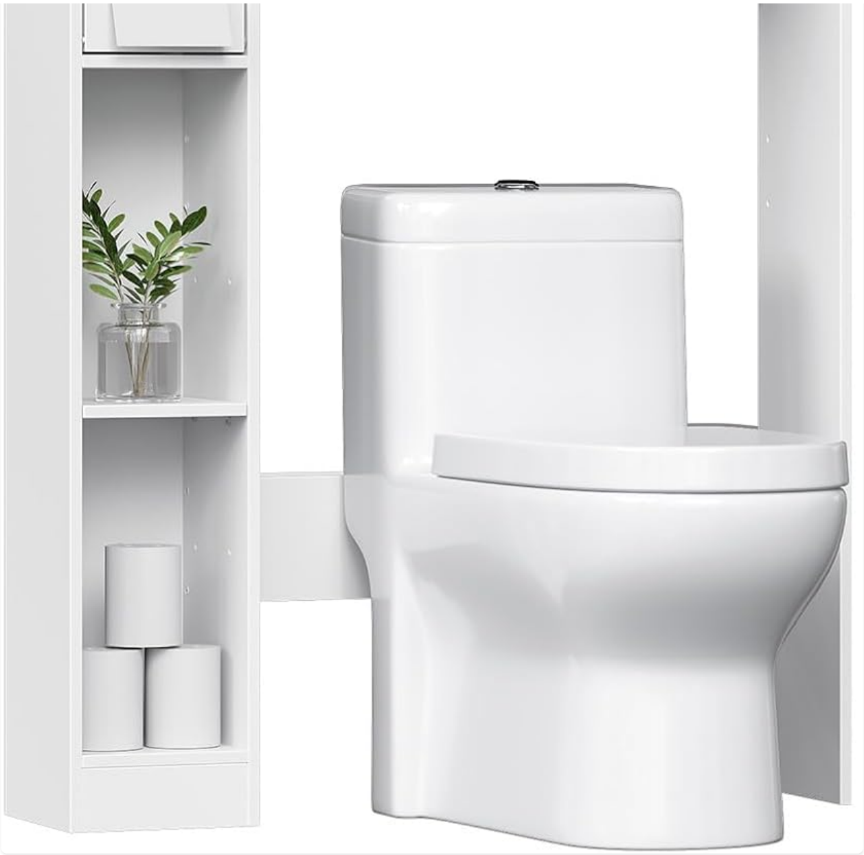
Image: The HOOBRO Over-The-Toilet Storage Rack, a white and walnut 3-tier unit, positioned over a toilet in a modern bathroom setting, showcasing its storage capabilities for toiletries and towels.