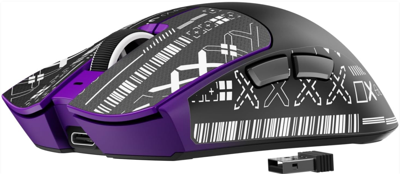
Figure 5: The mouse with its 2.4G USB dongle, which can be stored securely within the mouse body.