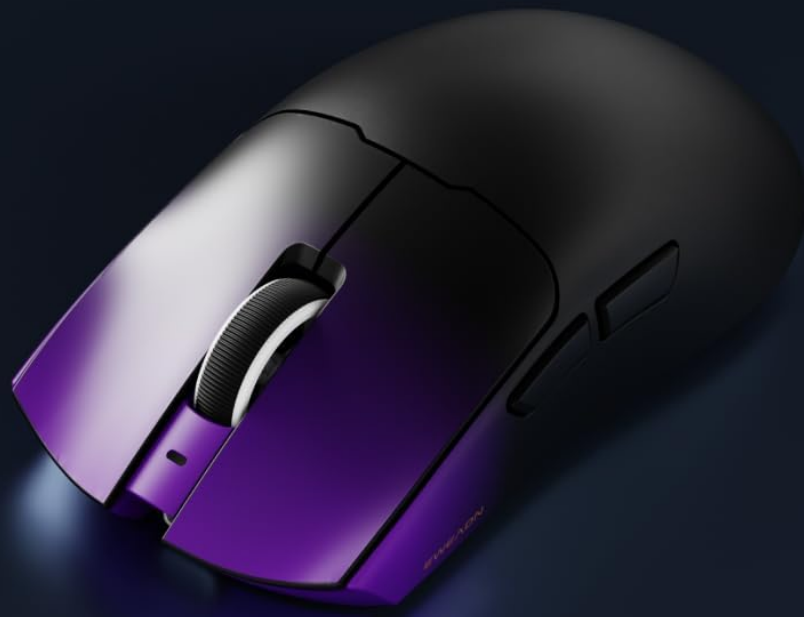
Figure 2: Key performance features including 8K Polling Rate, PAW3395 sensor, and 500mAh battery capacity.