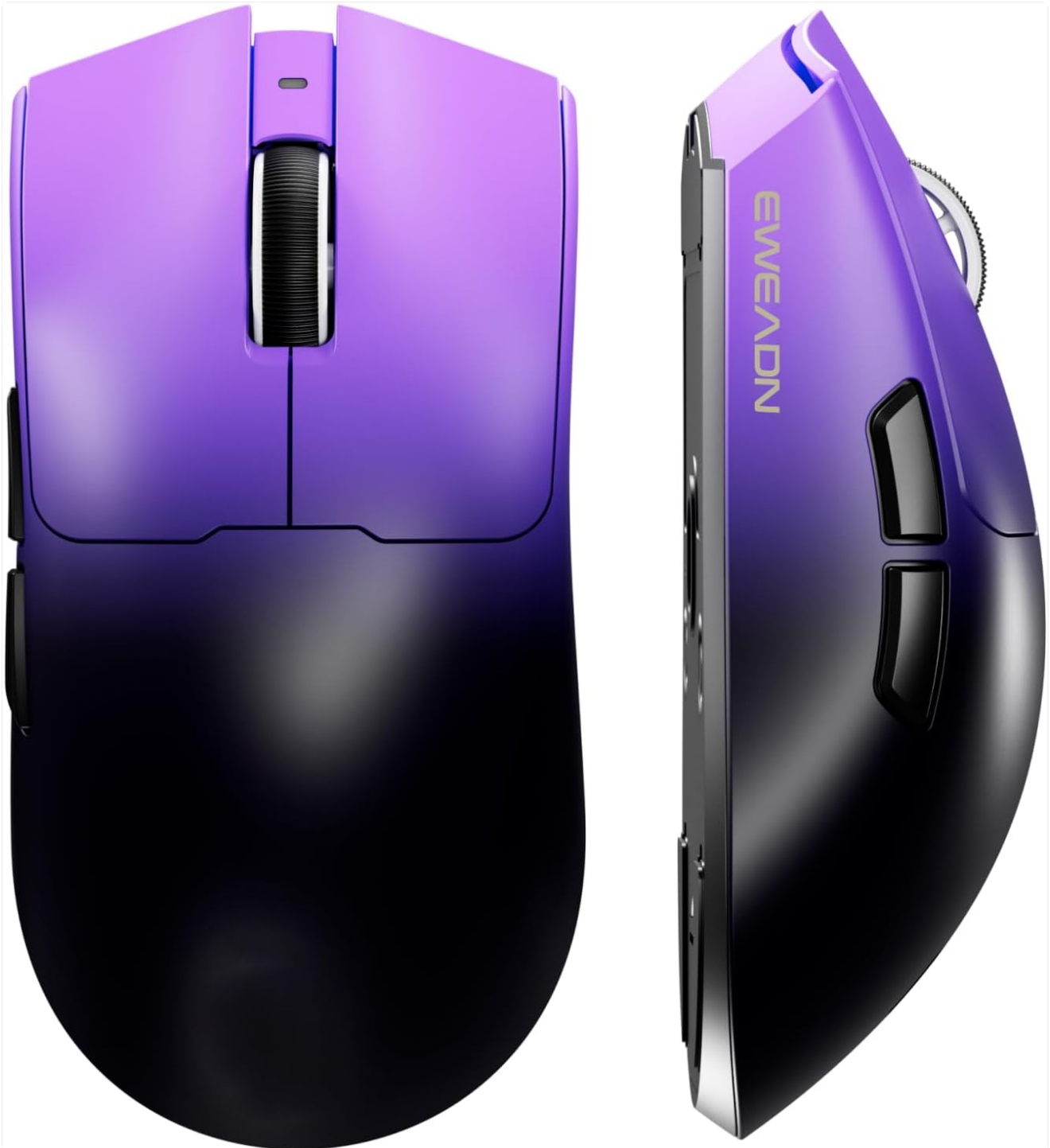
Figure 1: EWEADN S9 Pro Wireless Gaming Mouse, showcasing its ergonomic design and purple-to-black gradient finish.