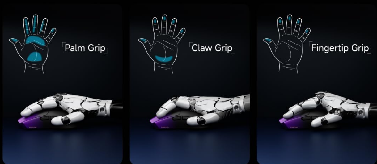
Figure 7: The mouse's design supports various grip styles for optimal comfort and control.