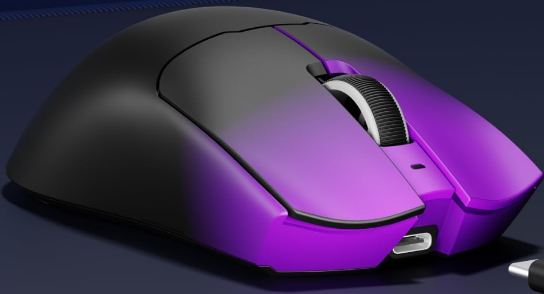
Figure 3: The mouse supports three connection modes: 2.4G wireless for blazing-fast speed, Bluetooth 5.0 for convenience, and USB-C wired for zero delay.