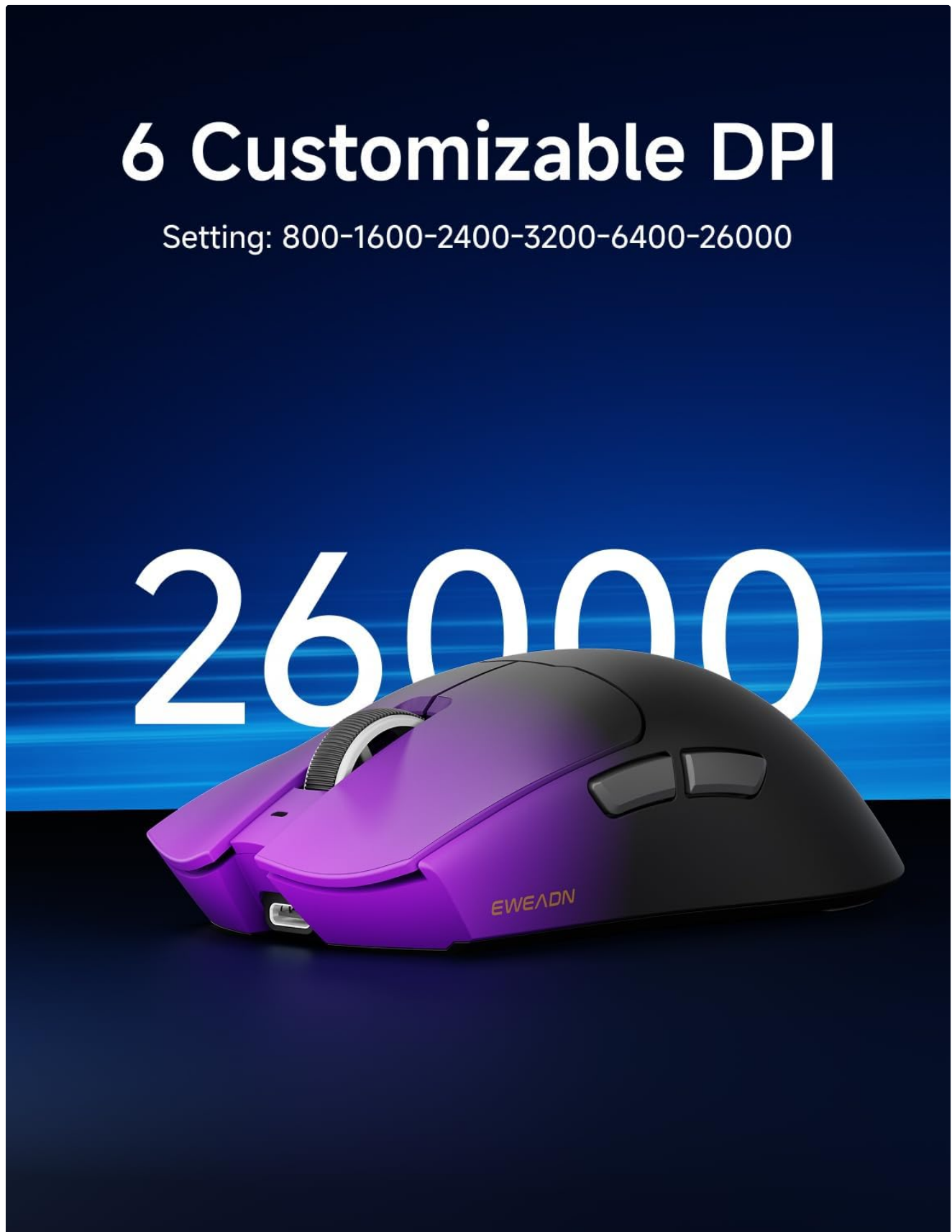
Figure 6: The mouse supports up to 26000 DPI, with 6 customizable settings for precise control.

The S9 Pro features 6 customizable DPI levels. By default, these are set to 800, 1600, 2400, 3200, 6400, and 26000 DPI. You can cycle through these settings using the dedicated DPI button located on the underside of the mouse or customize them via the software.