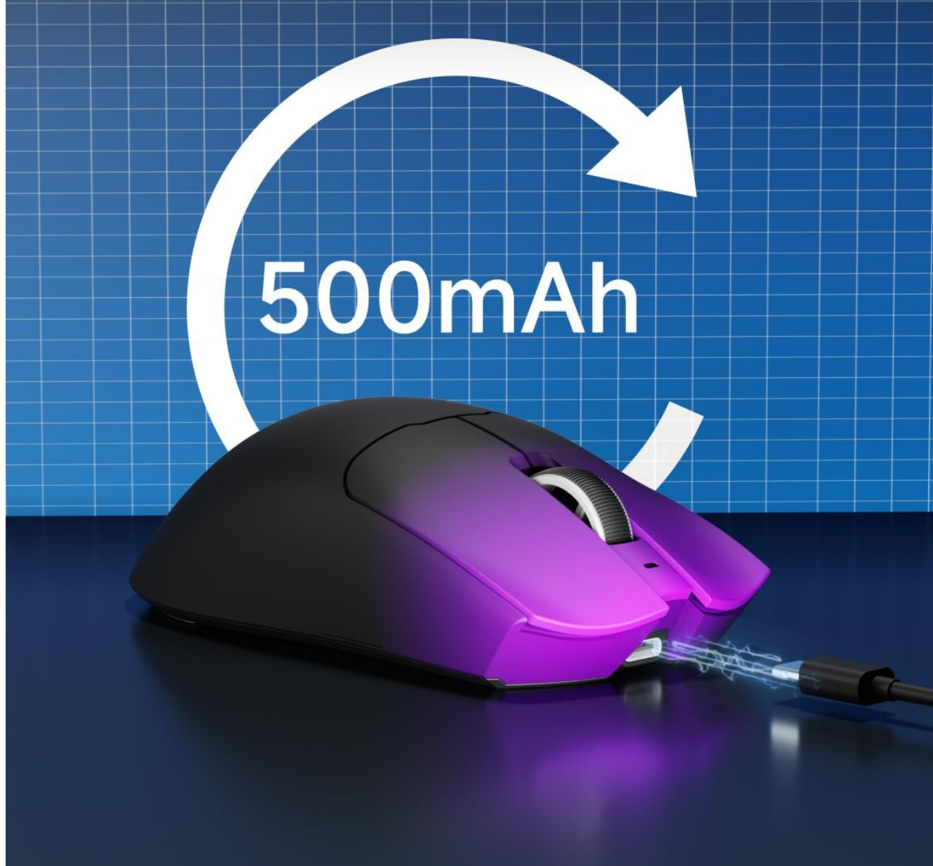
Figure 4: The mouse features a 500mAh battery for extended usage, rechargeable via the included USB-C cable.