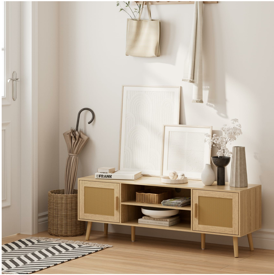
Image: The Apetacat Natural Rattan TV Stand, showcasing its design and functionality in a living room environment.