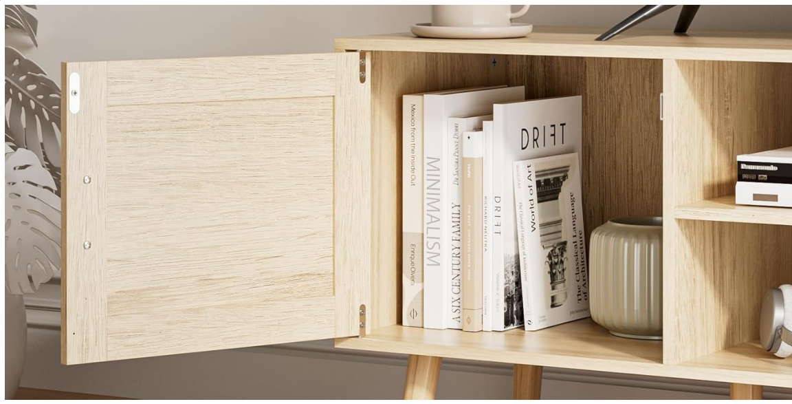
Image: The interior of one of the cabinets, demonstrating its capacity for storing books and other items.