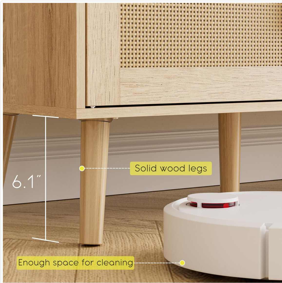
Image: The solid wood legs provide 6.1 inches of clearance, allowing for easy cleaning underneath the unit.