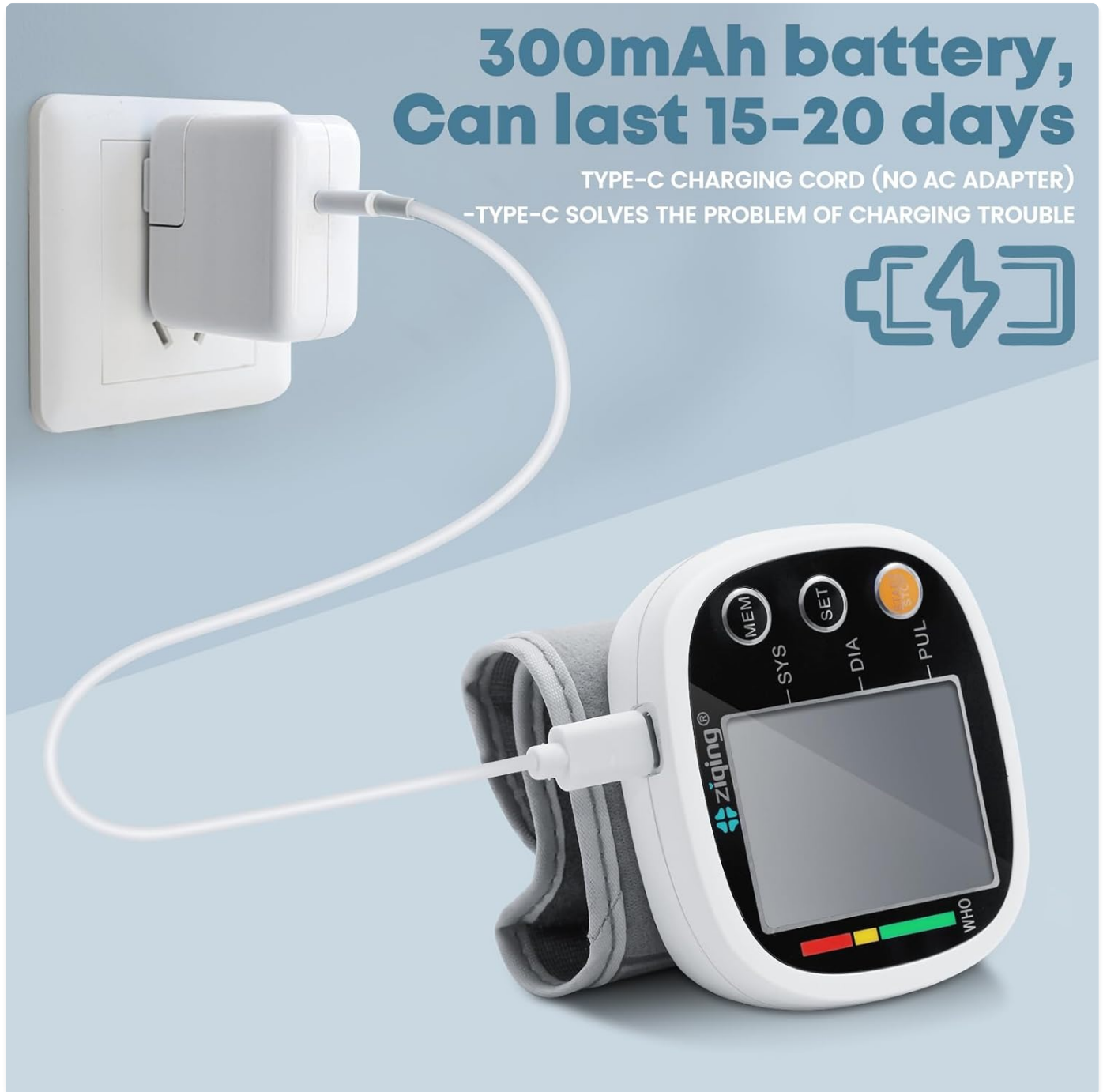
Figure 2: The monitor being charged via its Type-C port. A full charge can last for 15-20 days or up to 150 readings.

Before first use, fully charge the blood pressure monitor. Connect the provided Type-C charging cable to the device's charging port and plug the other end into a standard USB power adapter (not included) or a computer USB port. The battery indicator on the display will show charging status.