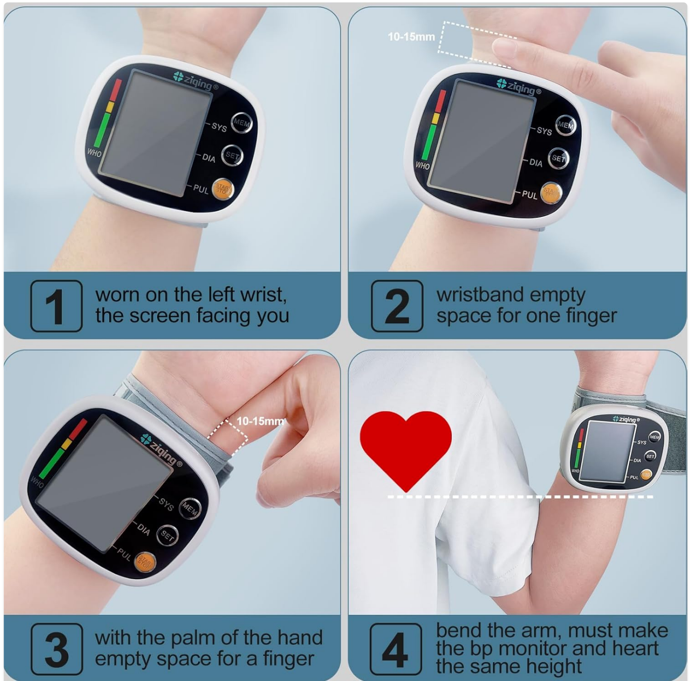
Figure 3: Step-by-step guide for correctly positioning the wrist cuff and arm for an accurate blood pressure reading.