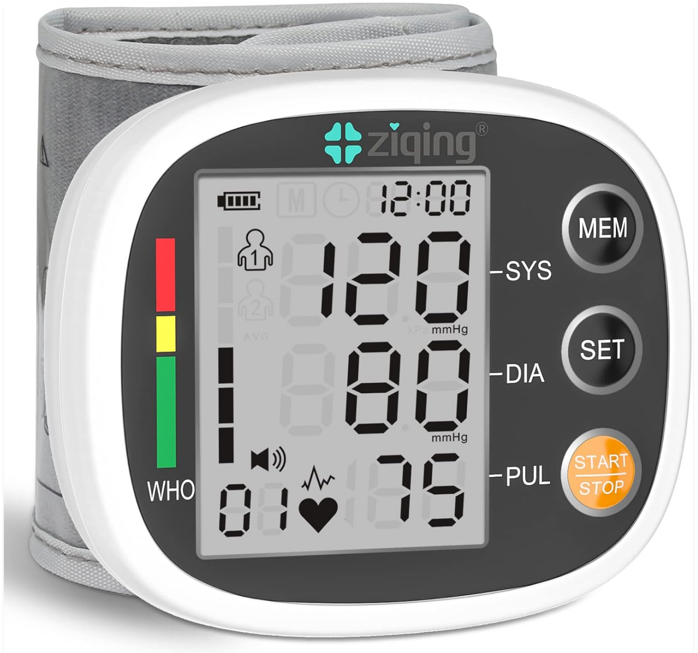
Figure 1: Front view of the GUAEVER Wrist Blood Pressure Monitor, showing the large LCD screen, WHO classification indicator, and control buttons (MEM, SET, START/STOP).