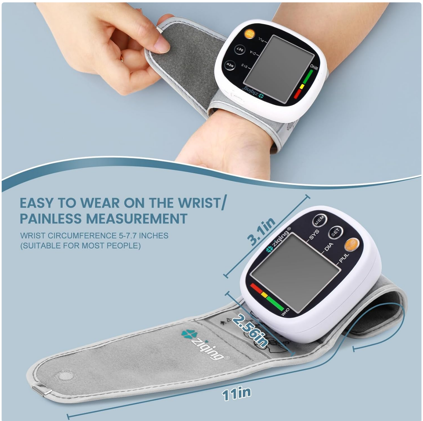
Figure 6: Dimensions of the monitor and the adjustable cuff, suitable for most wrist sizes.