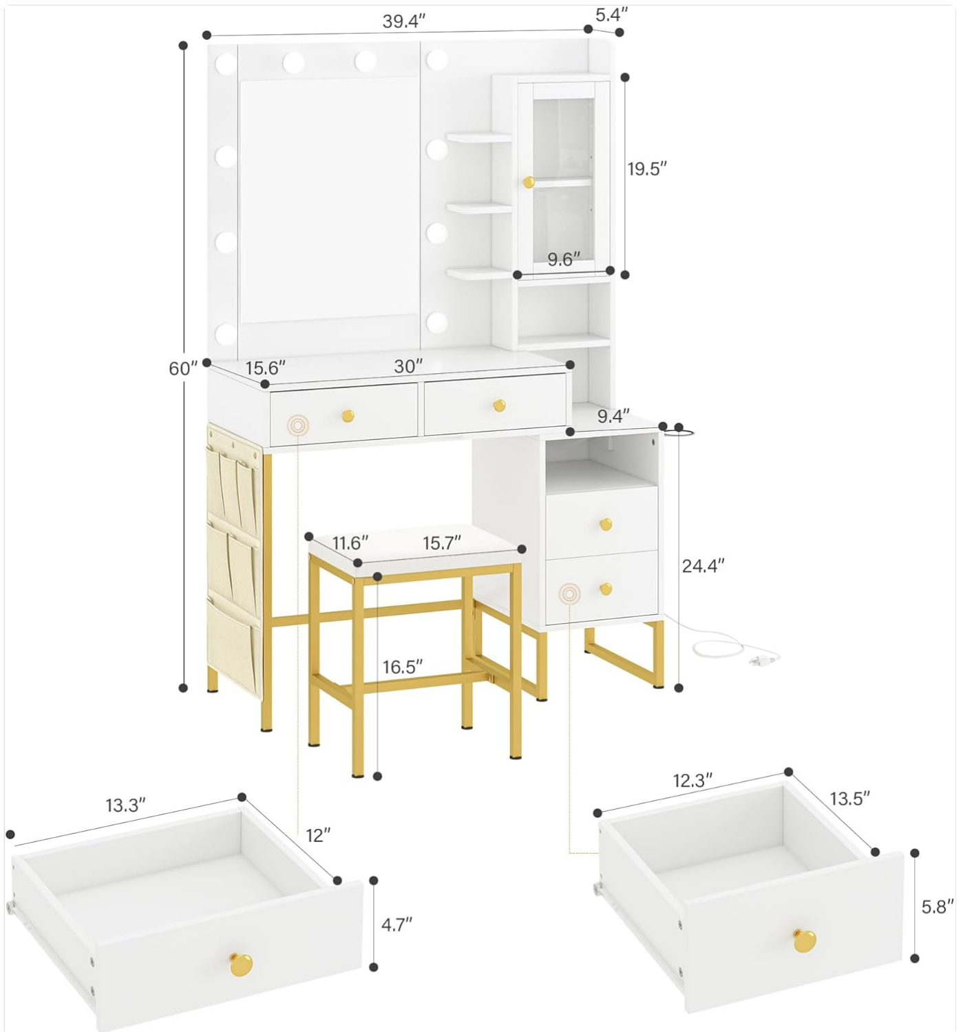
Figure 3: Dimensional diagram of the vanity, providing measurements for assembly and placement.