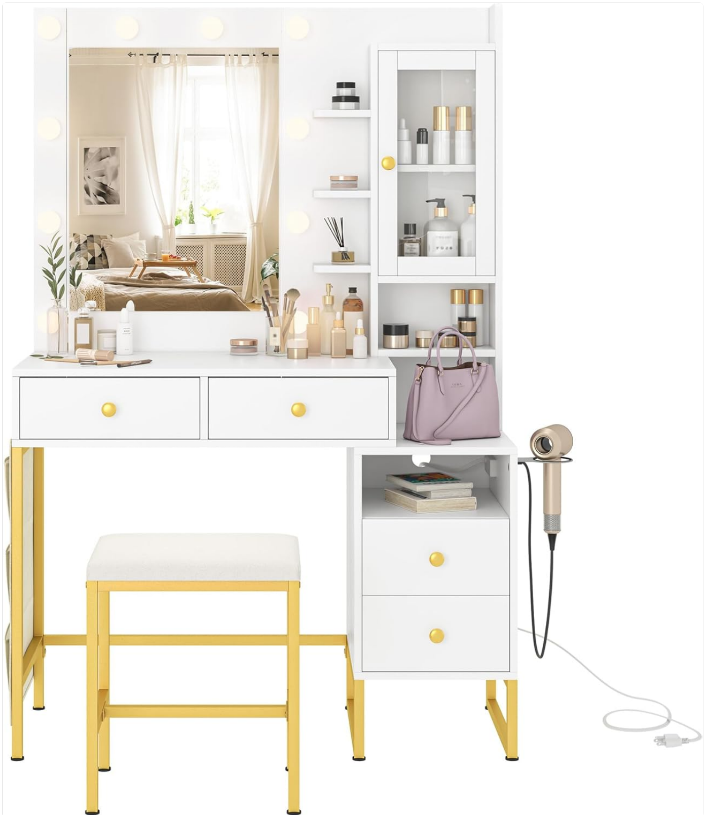
Figure 5: The vanity's integrated power strip and convenient hairdryer holder.