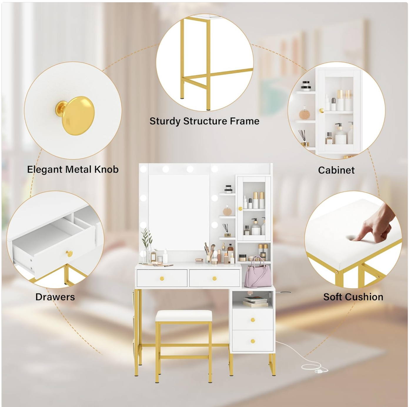
Figure 2: Key components of the vanity, illustrating the elegant metal knob, sturdy frame, cabinet, drawers, and soft cushion.