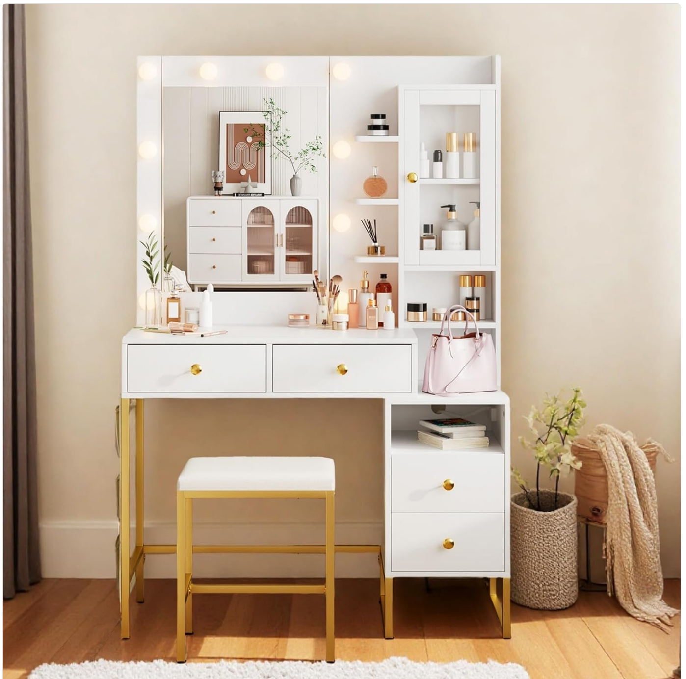
Figure 1: Fully assembled NBYSGO Makeup Vanity with its integrated mirror, lighting, and storage.