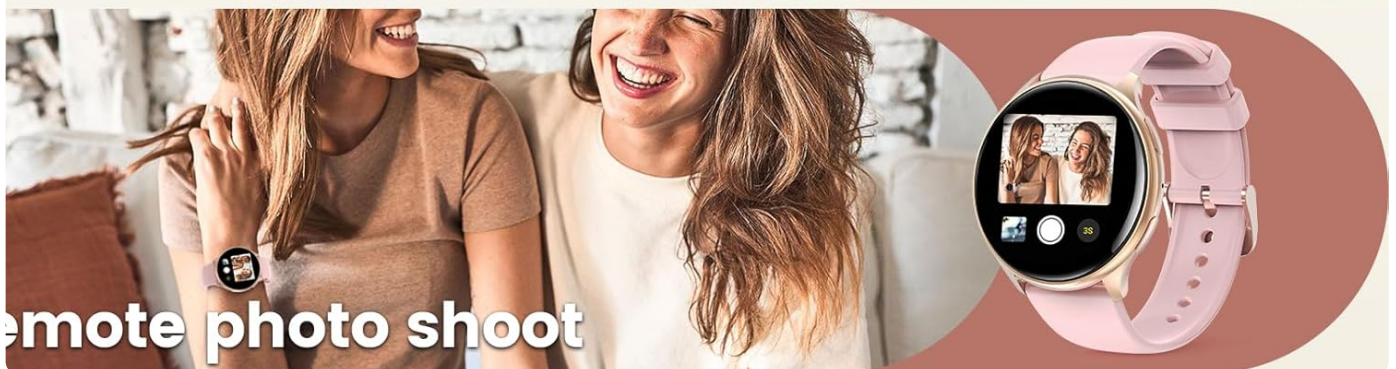
Image: Three panels illustrating the RifePhi Smart Watch's smart features: weather notifications with a snowy mountain scene, music control with a person listening to headphones, and remote photo capture with two people taking a selfie.