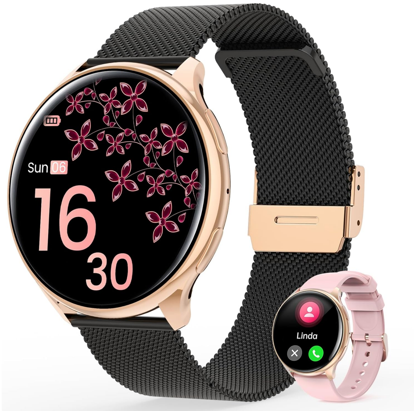
Image: The RifePhi Smart Watch in Black Rose Gold, showcasing its elegant design with a black Milanese strap. A smaller image of the watch with a pink silicone strap is also visible, highlighting color options.