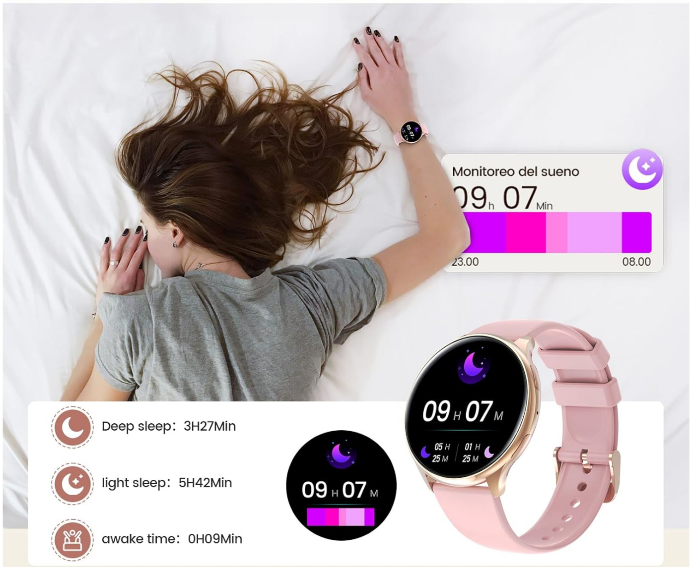
Image: The RifePhi Smart Watch displaying sleep monitoring records, showing duration of deep sleep, light sleep, and awake time, along with a visual representation of sleep stages.

Analyse the sleeping situation and adjust your sleep scientifically and rationally to make every day energetic.