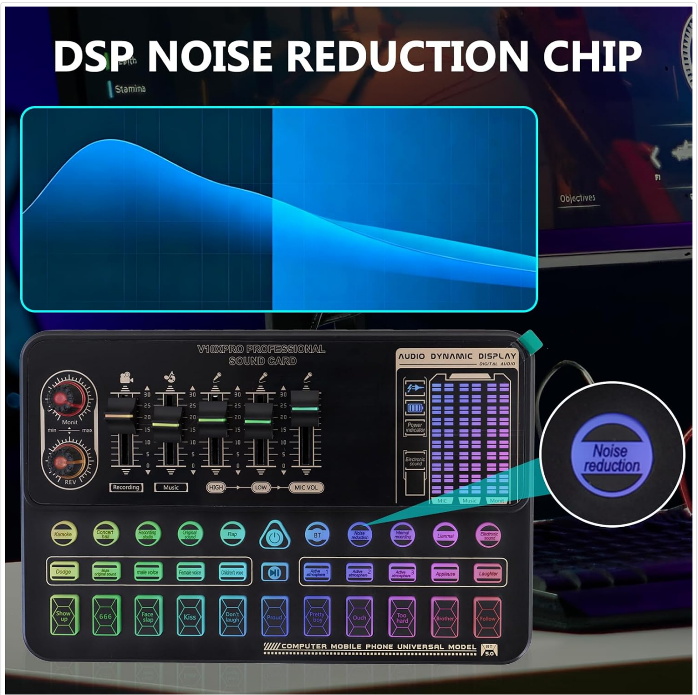
Figure 5: The V10XPRO Audio Mixer highlighting the DSP Noise Reduction feature.