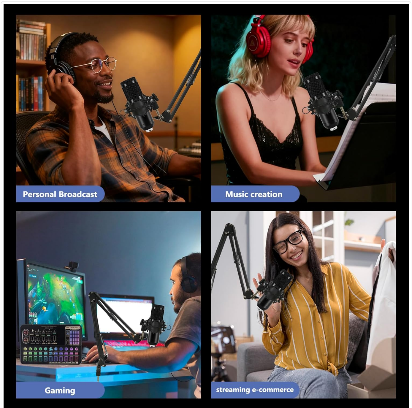
Figure 6: The podcast equipment bundle is suitable for personal broadcast, music creation, gaming, and streaming.