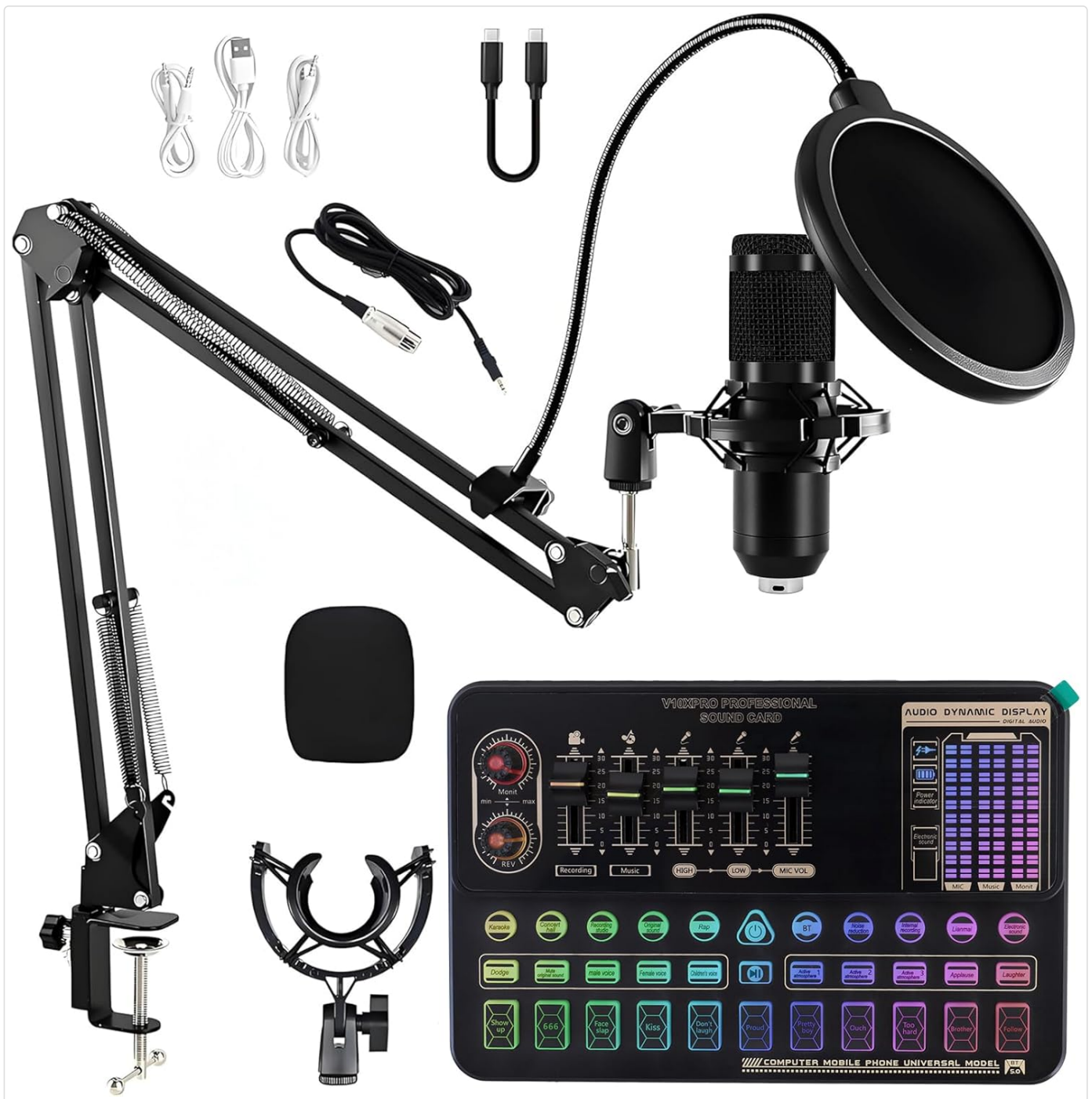
Figure 1: All components included in the ALSO GO Podcast Equipment Bundle.