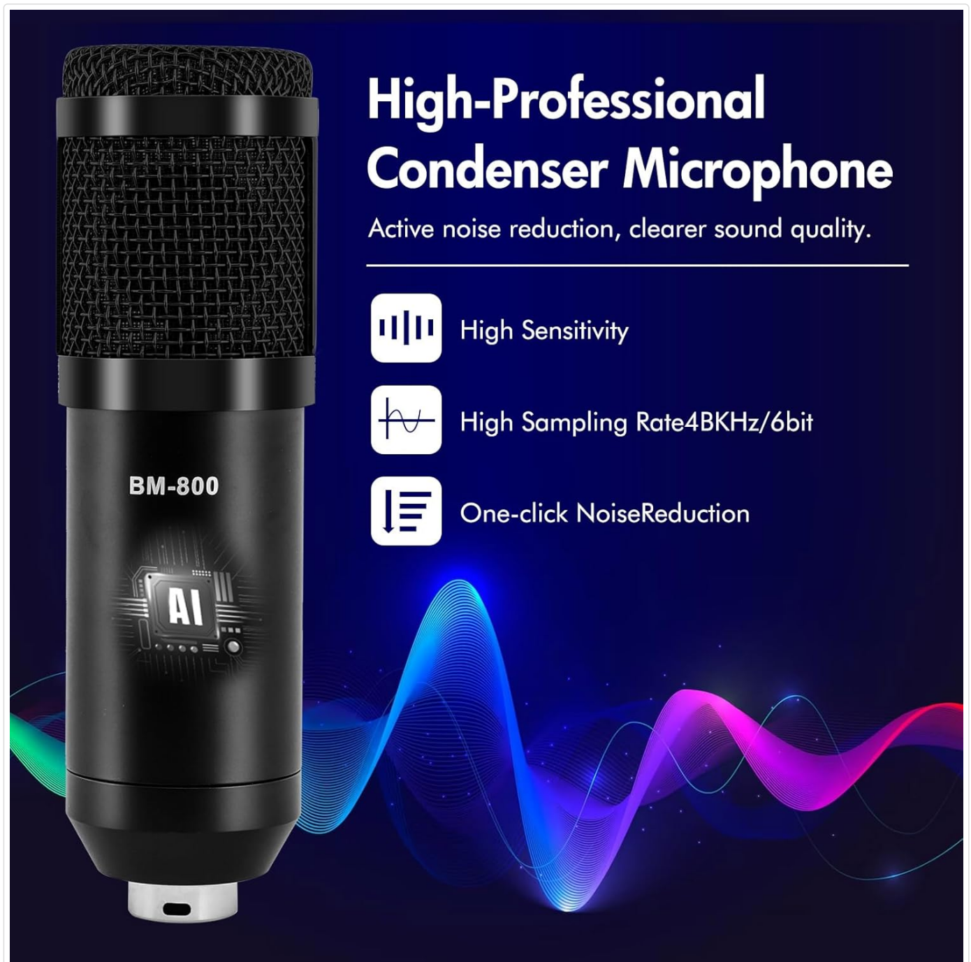
Figure 2: BM-800 Condenser Microphone with shock mount and pop filter attached to the stand.