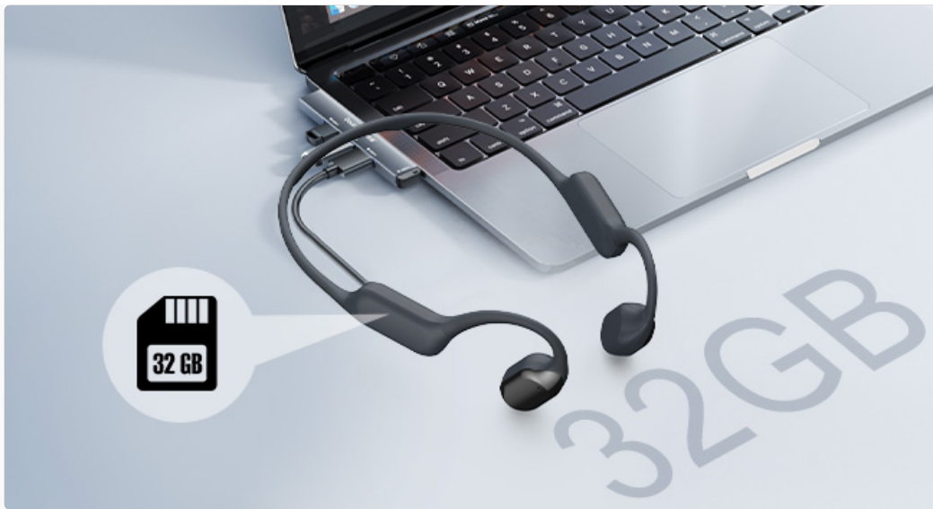
Image: Headphones connected to a laptop, highlighting the 32GB internal storage capacity for music files.