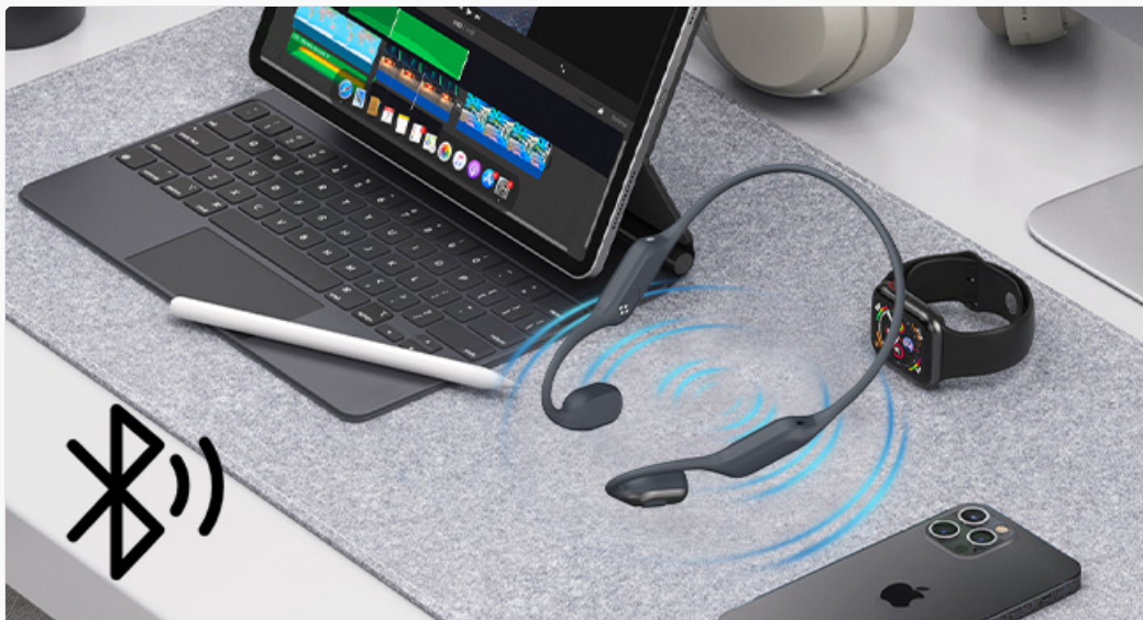
Image: The headphones wirelessly connected to multiple devices via Bluetooth, demonstrating connectivity.