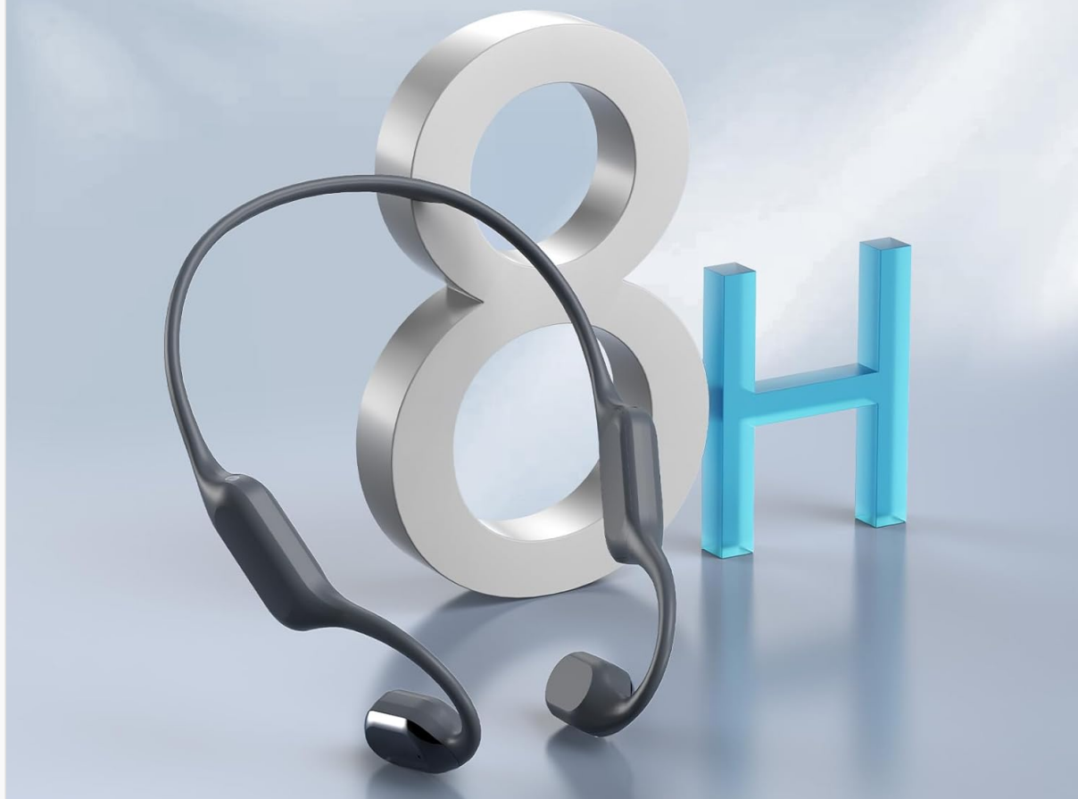
Image: The MARLALL NOS 08W headphones illustrating their 8-hour battery life and 2.5-hour charging time.