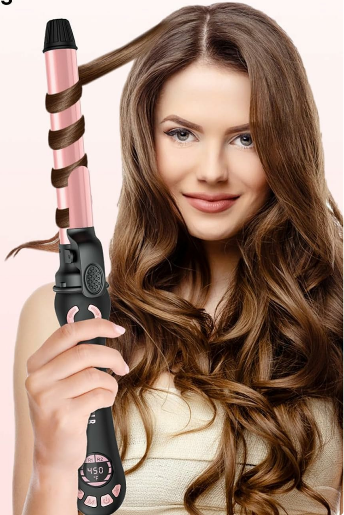
Image: Details on the 1-inch barrel for classic waves, 30-second heat-up, ceramic coating for shine, dual voltage for travel, and 1-hour auto-off safety feature.