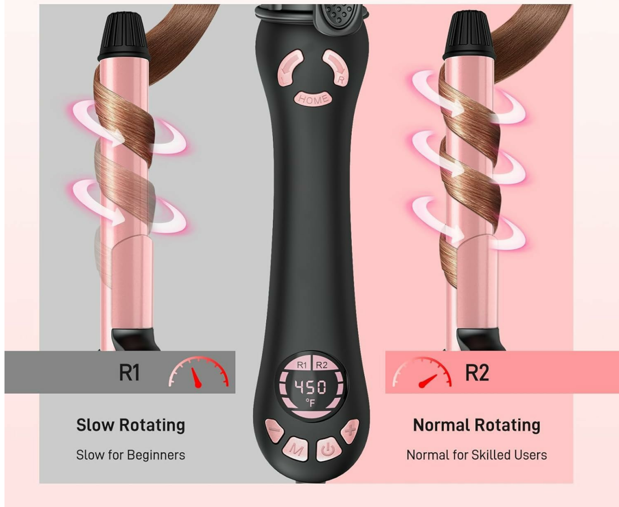
Image: Illustration of the two auto-rotating speeds (R1 for slow, R2 for normal) and their recommended uses.