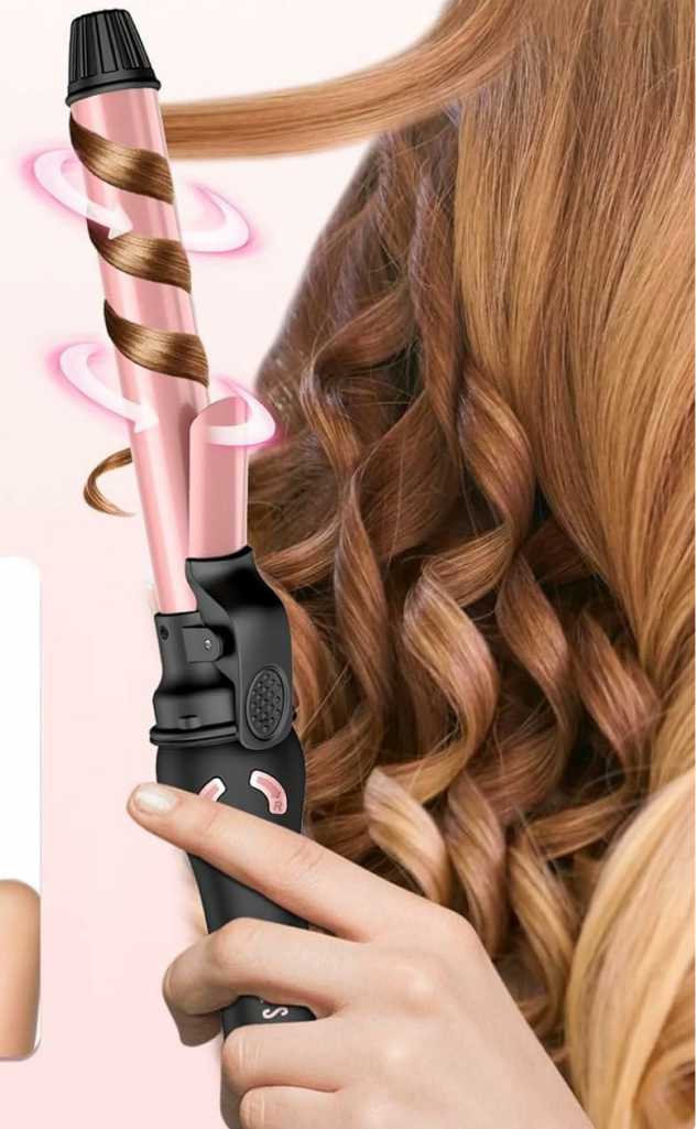
Image: Overview of the curling iron's time-saving and effortless features, including 360° auto-rotate, two rotating speeds, 6-inch long barrel, and 2.3-inch clamp.