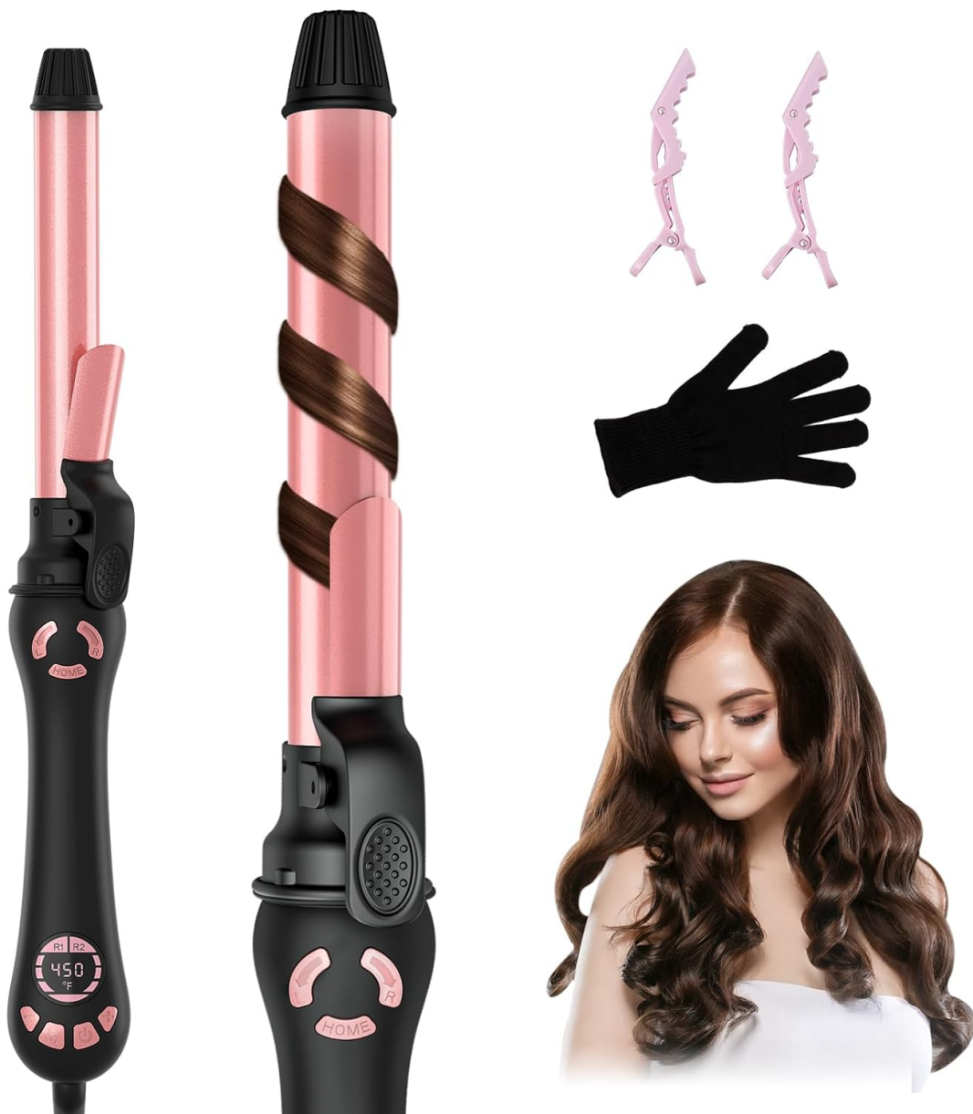
Image: The HITTIONA Rotating Curling Iron MS-C210, Rose Gold color.