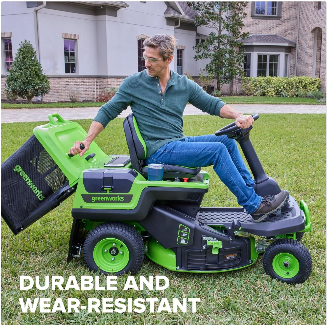
Image: A person is shown securing the Greenworks bagging kit to the riding mower, highlighting the connection point for the grass collection system.