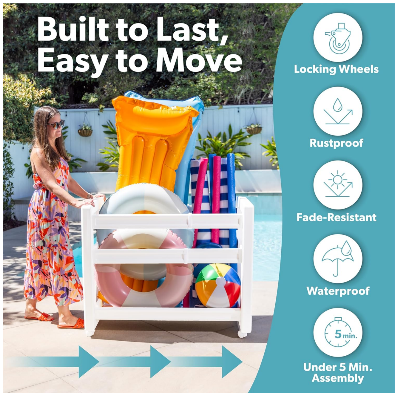
Figure 4.1: The organizer features locking wheels for mobility and is designed for quick assembly.