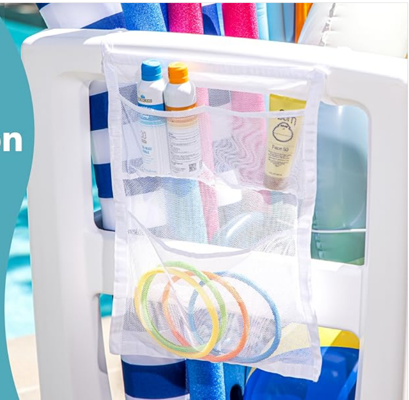
Figure 4.2: Built-in organization features include mesh accessory bags and bungee dividers.