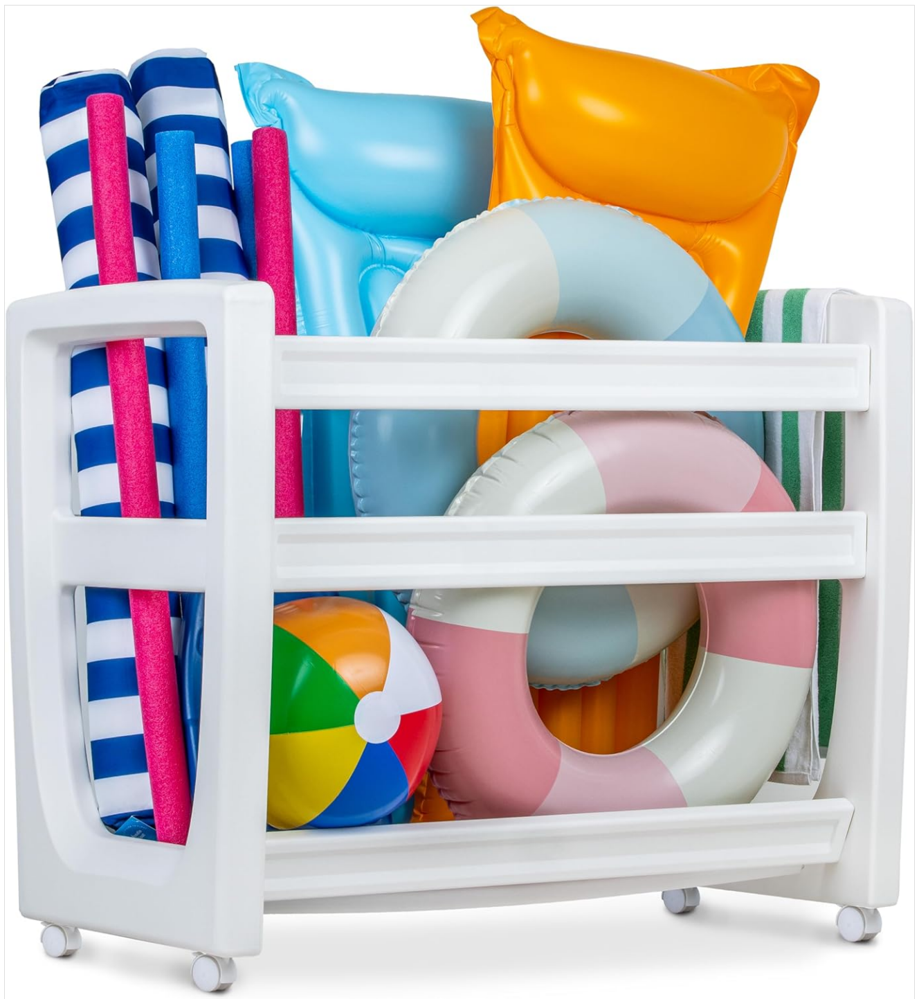
Figure 5.1: The organizer provides ample space for various pool items.