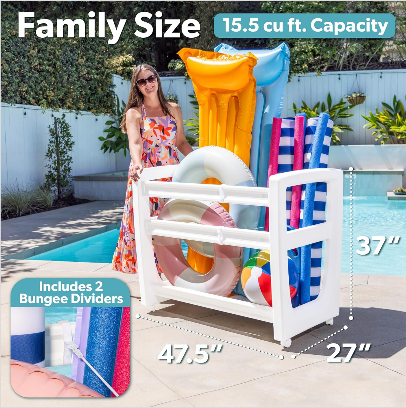
Figure 8.1: Dimensions and capacity of the GoSports Coast Modern Pool Organizer.