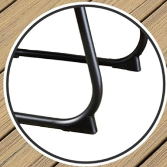
16 Slip Resistant Feet