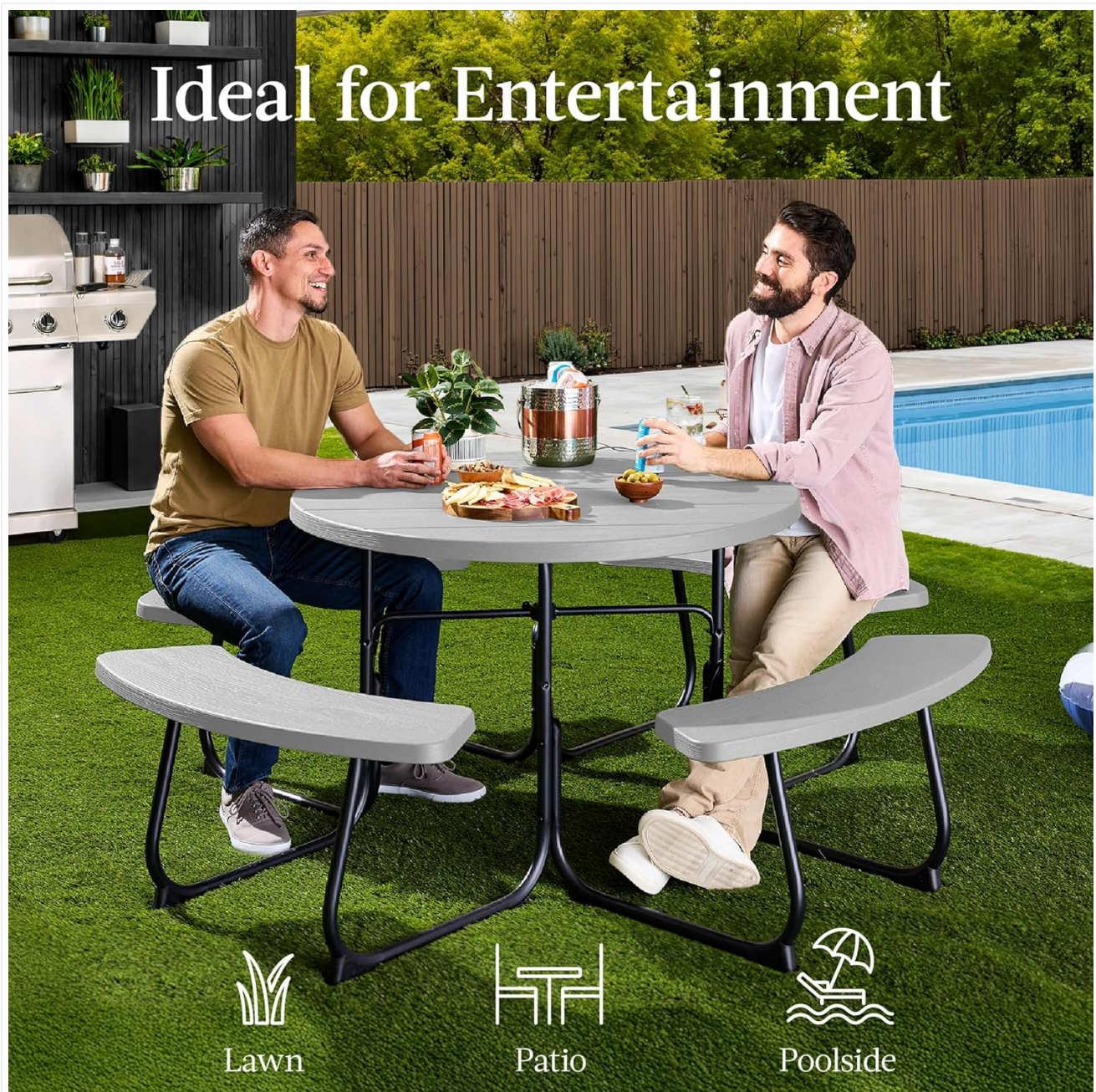
Image 5.2: The picnic table is suitable for various outdoor entertainment settings.