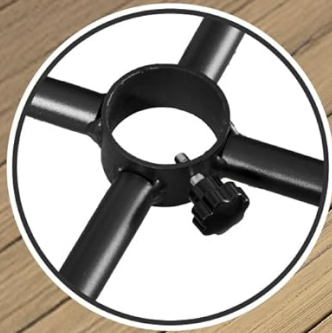
Adjustable Anchor Screw