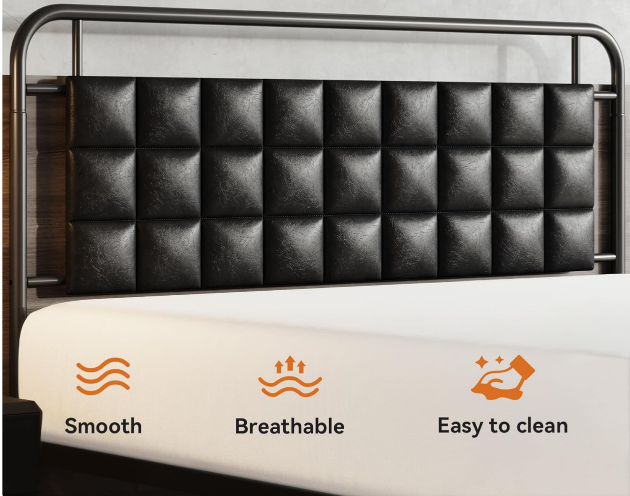
Image 6.1: Features of the PU Leather Headboard, including ease of cleaning.