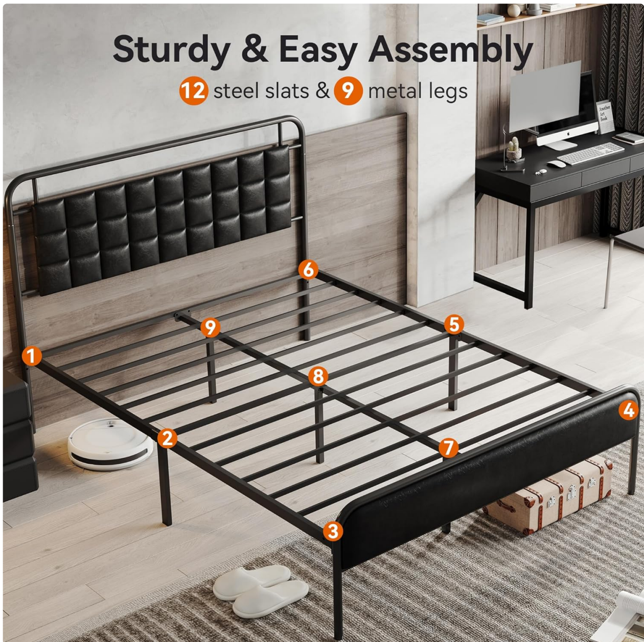
Image 3.1: Illustration of bed frame components and their arrangement for assembly.