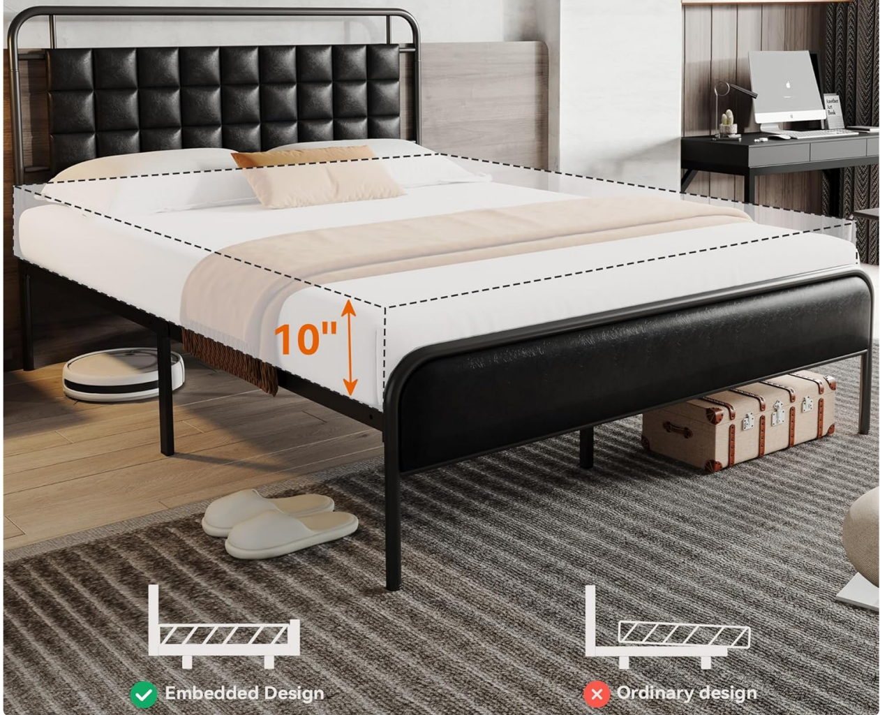
Image 5.1: Mattress recommendation and embedded design for secure mattress placement.