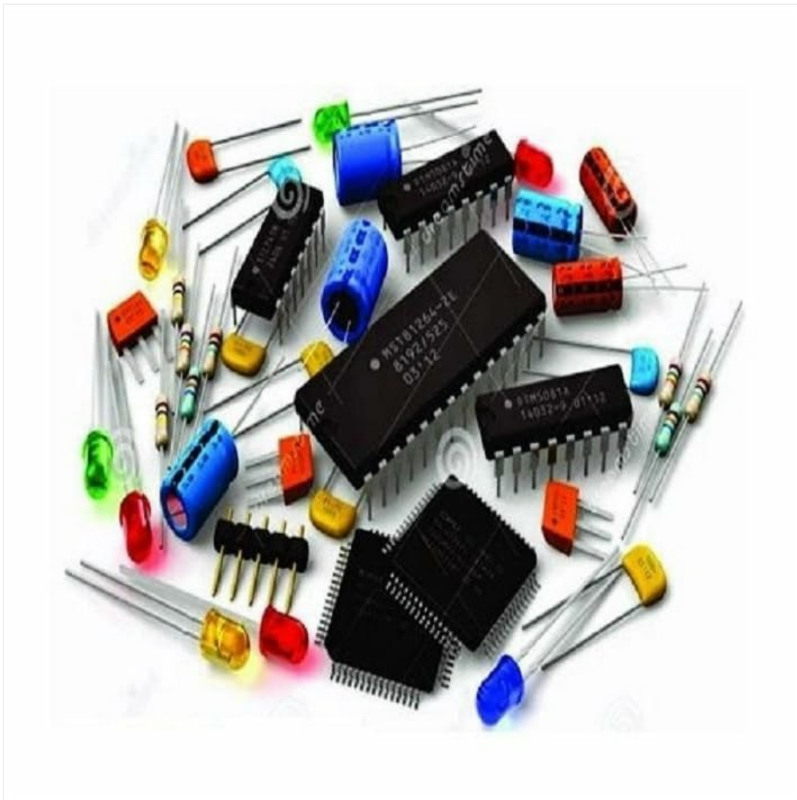
Figure 2: A variety of electronic components typically found in DIY kits, illustrating the types of parts used in this radio kit.