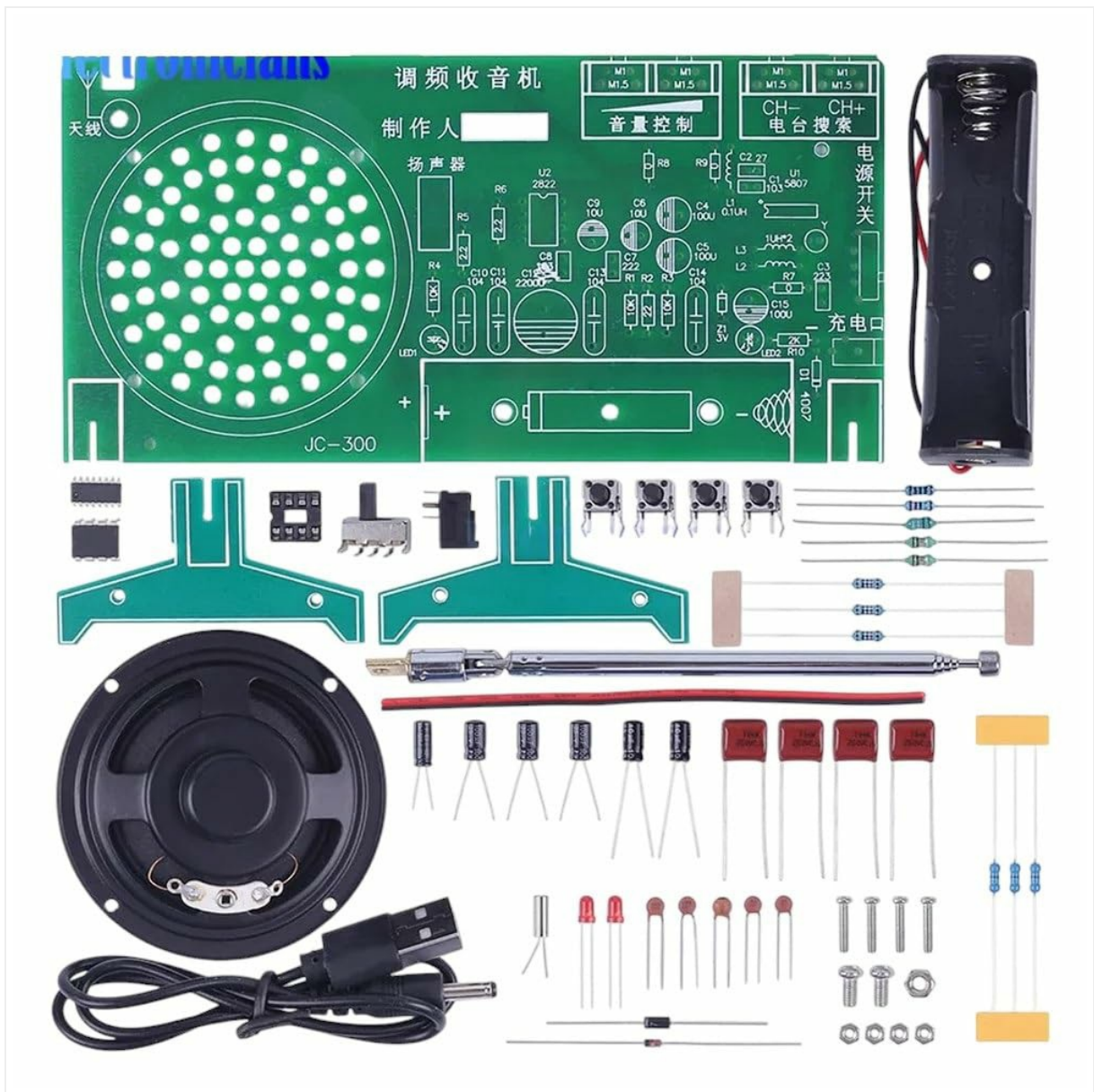
Figure 1: All components of the RDA5807FP FM Radio DIY Kit, including the PCB, speaker, battery holder, antenna, and various electronic parts.