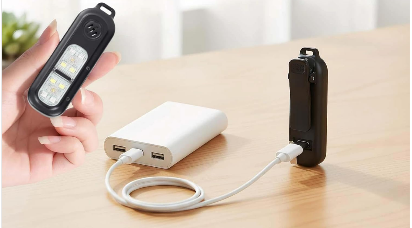
Image: The personal safety alarm connected to a power bank via its USB-C charging port.