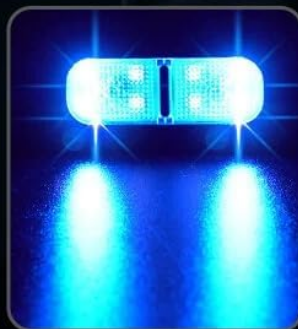
Flash Blue Light 6H