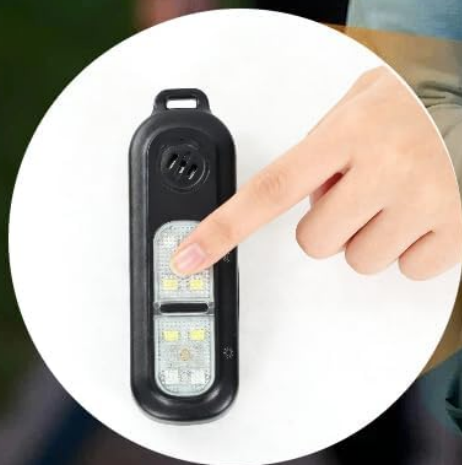
Image: Visual guide on how to activate the 135dB personal alarm by double-clicking and deactivate by pressing and holding for 3 seconds.

On: Double-click Off: Press and hold (3s)