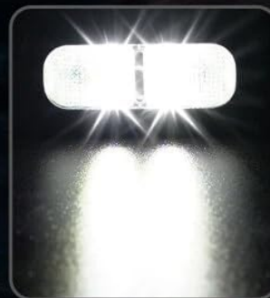
Flash White Light 6H