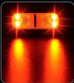
Flash Red Light 6H