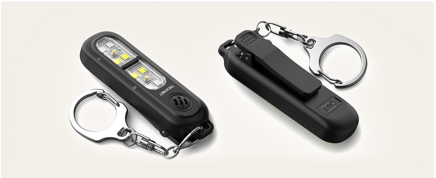
Image: Contents of the TECKNET Personal Safety Alarm package, including the alarm unit, USB-C cable, and keychain.