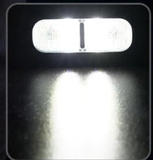
White Steady 2H

Image: Illustration of the four lighting modes: flashing red, flashing blue, flashing white, and steady white, with their respective durations.