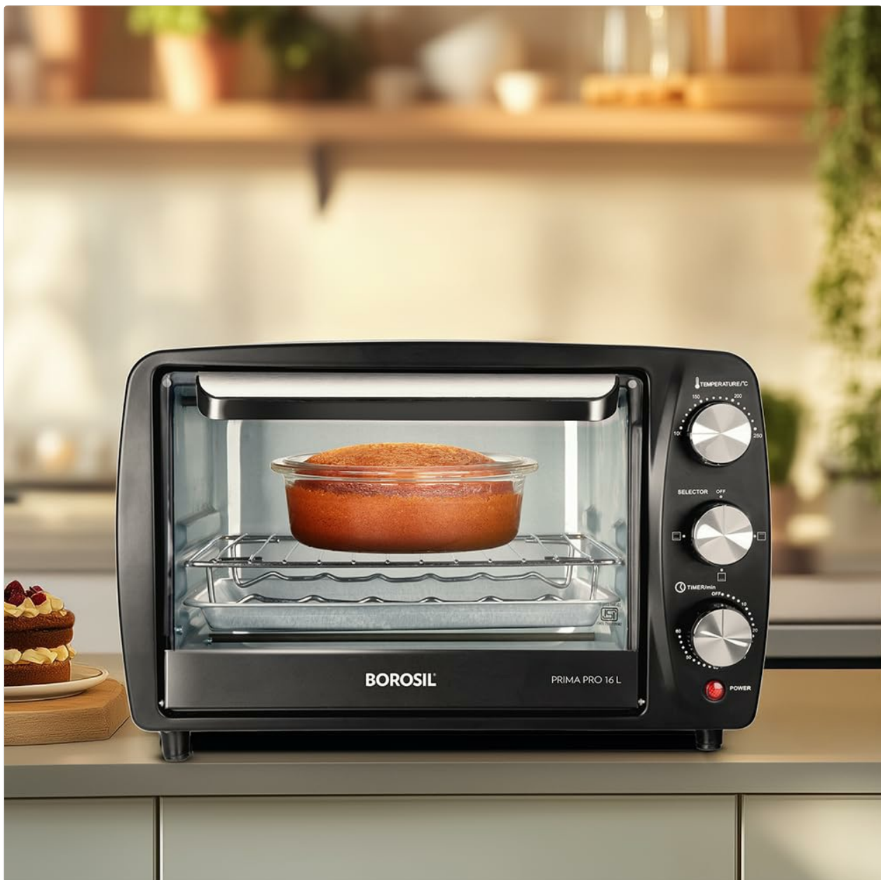
Image: The Borosil Prima Pro 16L OTG with a cake baking inside, demonstrating its baking capability.