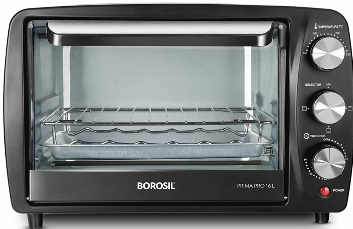
Image: Front view of the Borosil Prima Pro 16L OTG, showcasing its sleek design and control panel on the right side.