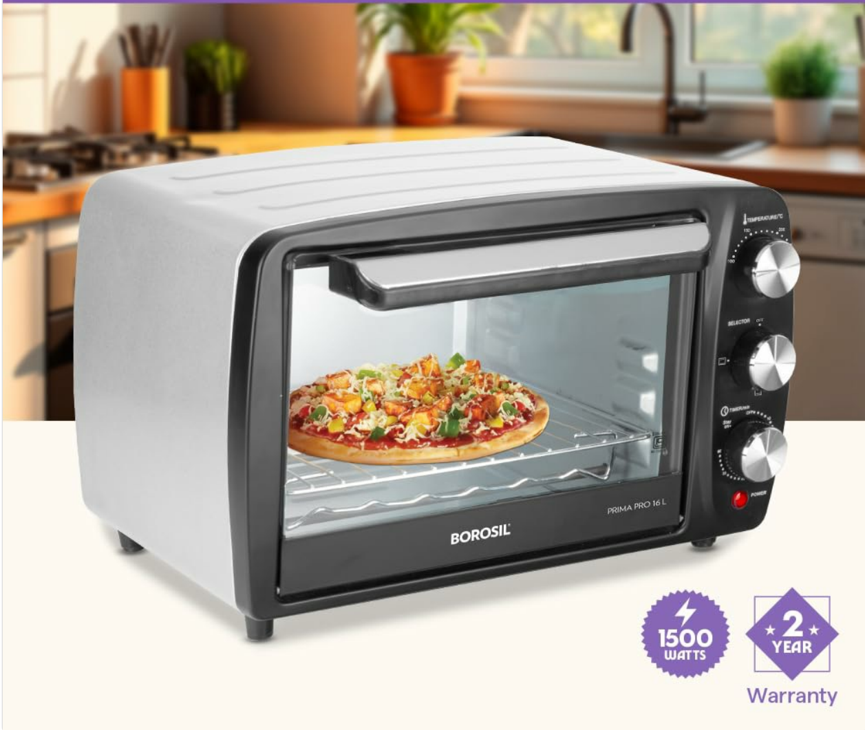
Image: The Borosil Prima Pro 16L OTG with text indicating its 16L capacity, ability to fit a 9-inch pizza or 3-4 slices of toast, 1500 Watts power (Note: Product title states 1350W), and a 2-year warranty.

16 L CAPACITY Can fit 9" pizza or 3-4 slices of toast