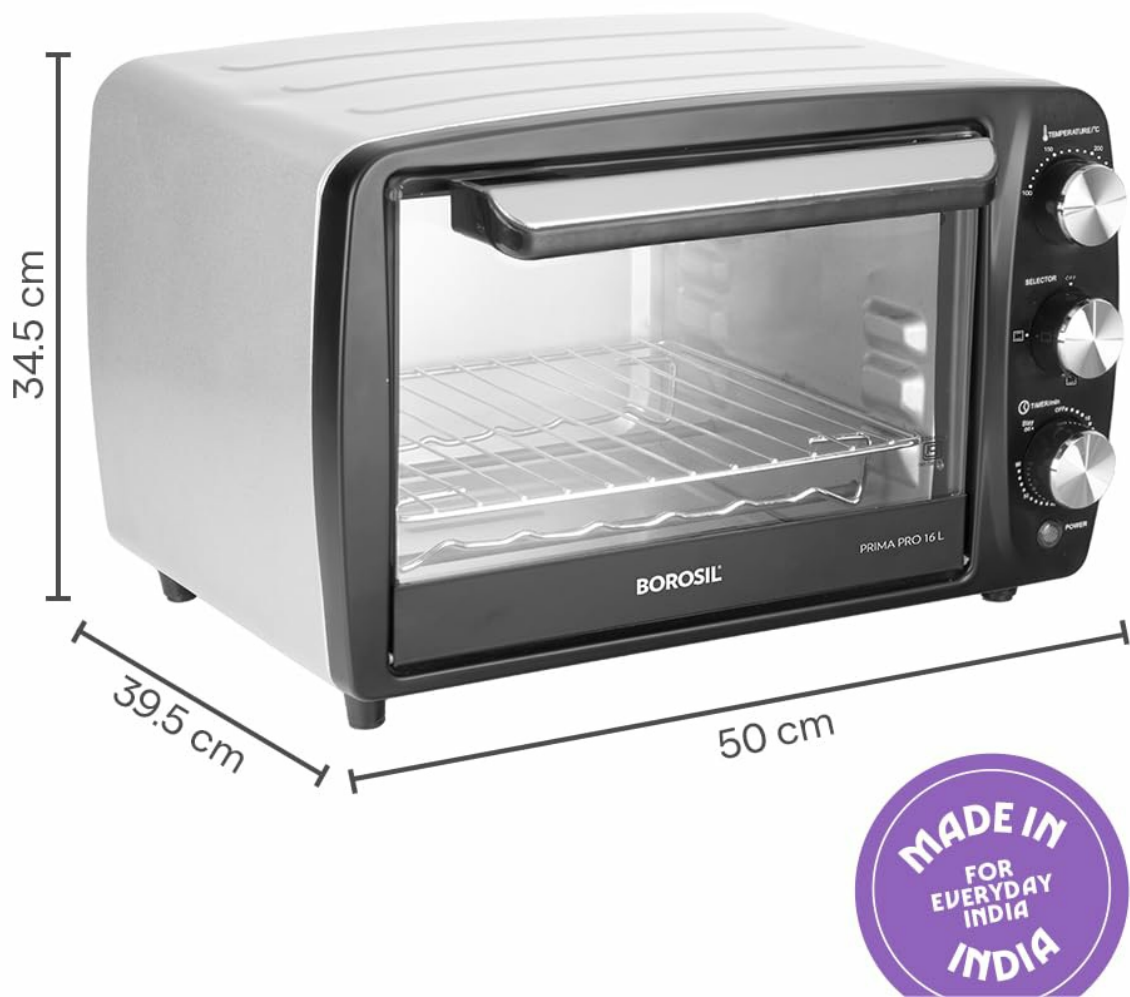
Image: A diagram showing the dimensions of the Borosil Prima Pro 16L OTG: 39.5 cm depth, 50 cm width, and 34.5 cm height.