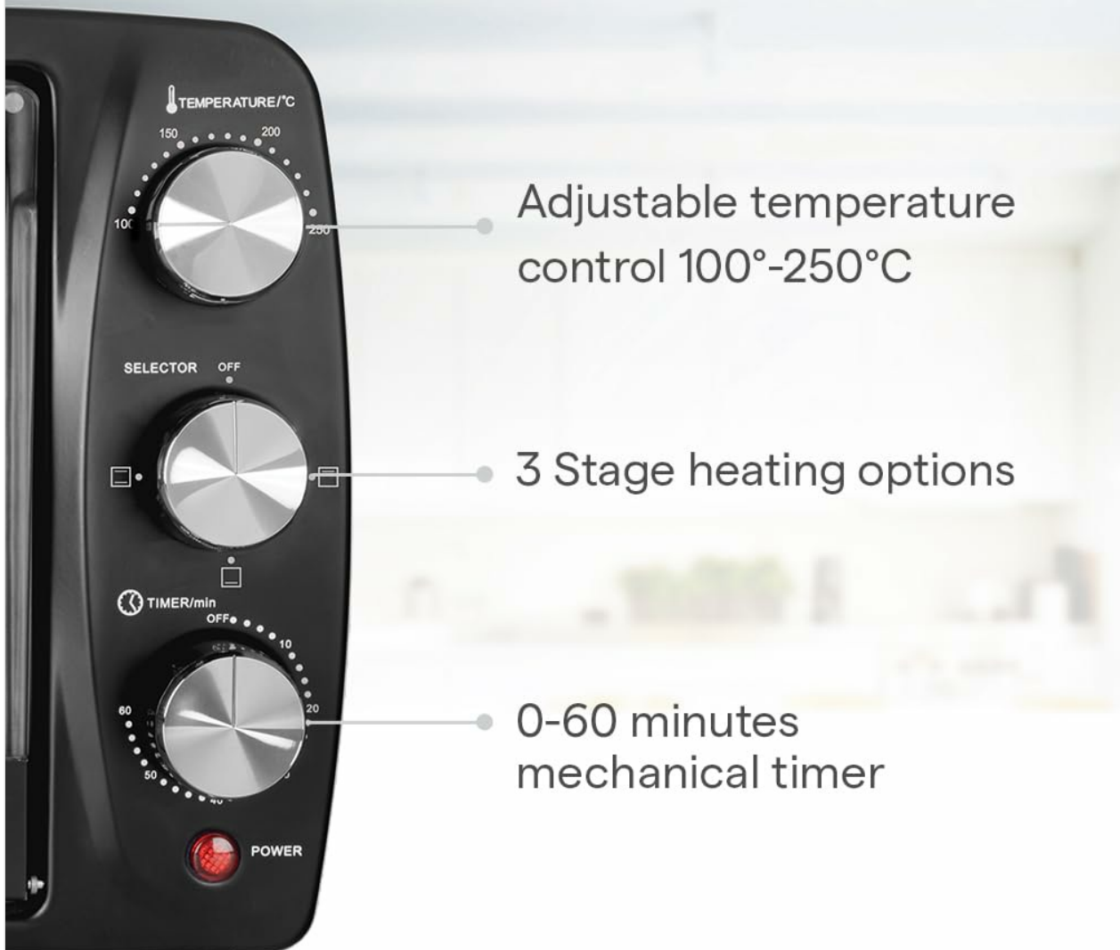
Image: A close-up view of the control panel on the Borosil Prima Pro OTG, highlighting the adjustable temperature control, selector knob for heating options, and the 0-60 minute mechanical timer.