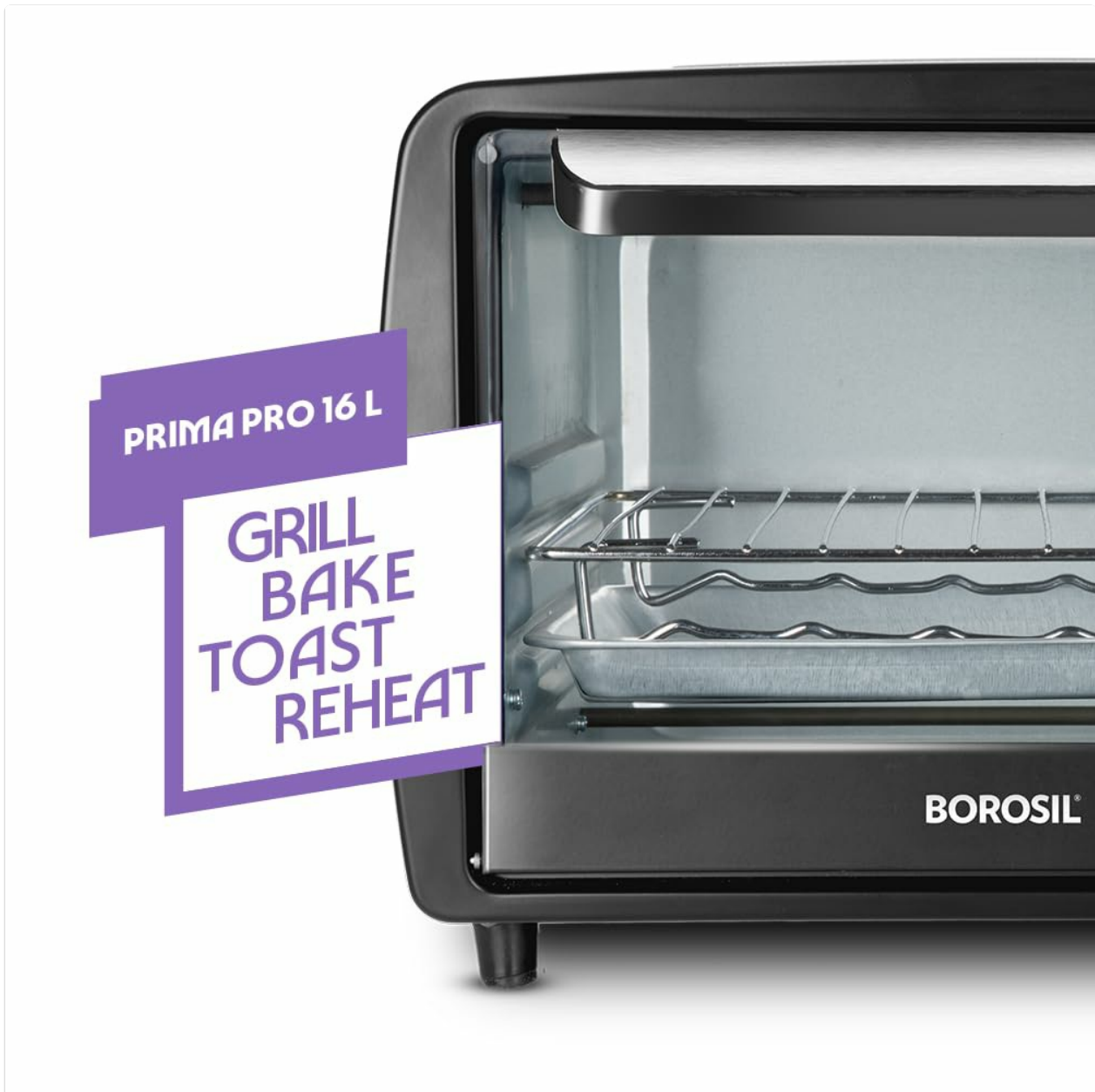
Image: The Borosil Prima Pro 16L OTG with text overlay indicating its multi-functional capabilities: Grill, Bake, Toast, Reheat.

The Borosil Prima Pro OTG offers multiple cooking functions: