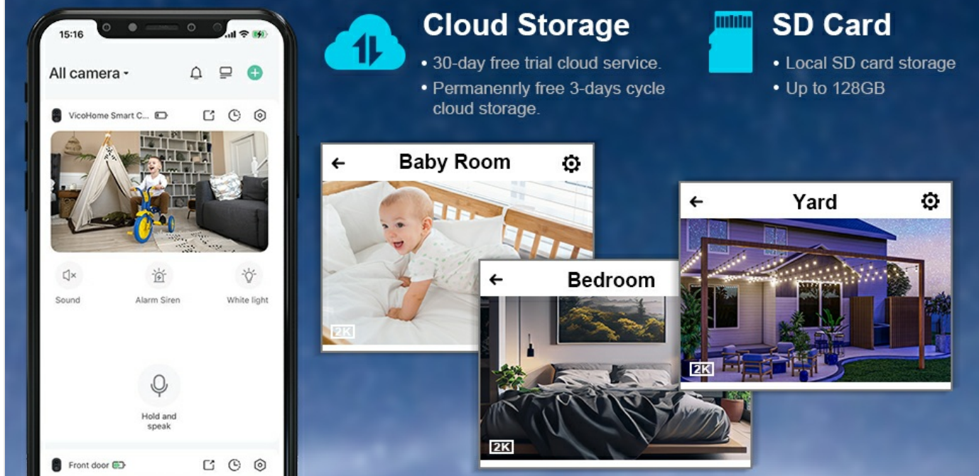
Figure 4.6: Storage Options.

The image highlights the dual storage options: local micro SD card storage (up to 128GB) and cloud storage, which includes a 3-day rolling service and a 30-day trial for advanced features. The mobile app interface shows different camera views for various rooms, indicating recorded footage availability.